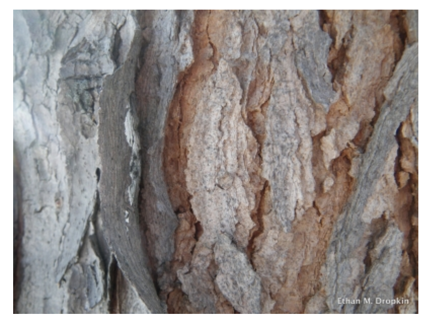
Gymnocladus dioicus - Bark