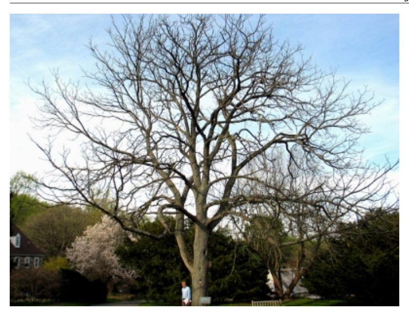
Gymnocladus dioicus - Habit