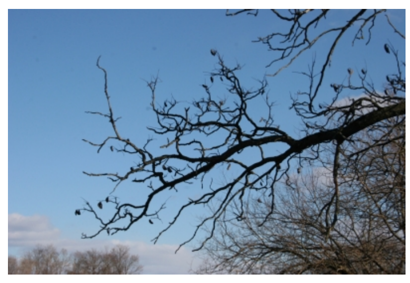
Gymnocladus dioicus - Branch