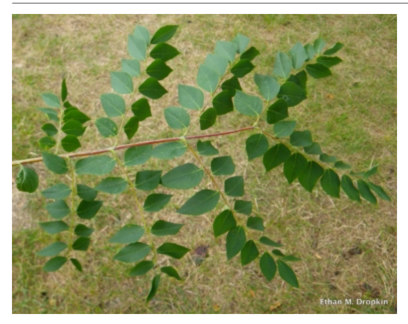
Gymnocladus dioicus - Leaves