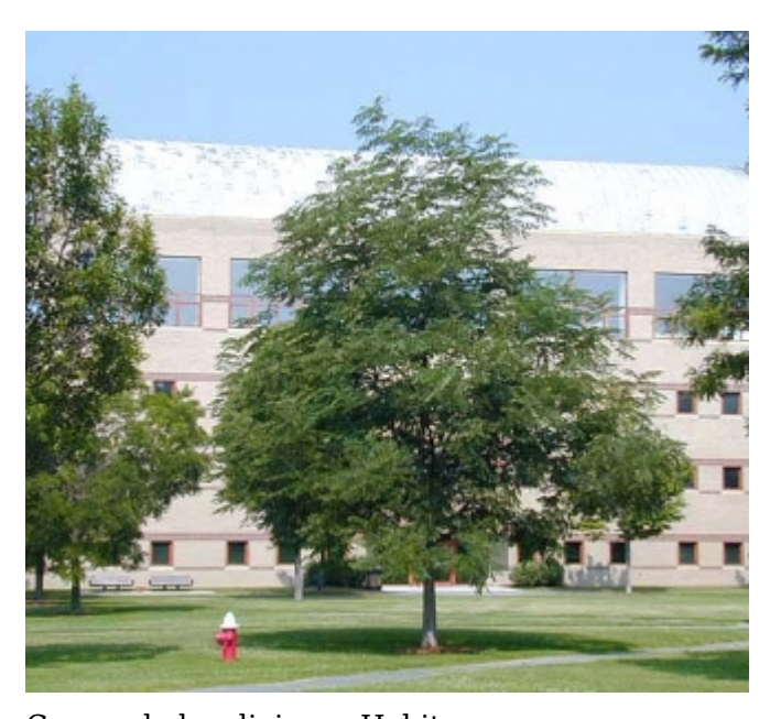
Gymnocladus dioicus - Habit