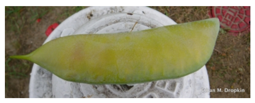
Gymnocladus dioicus - Fruit