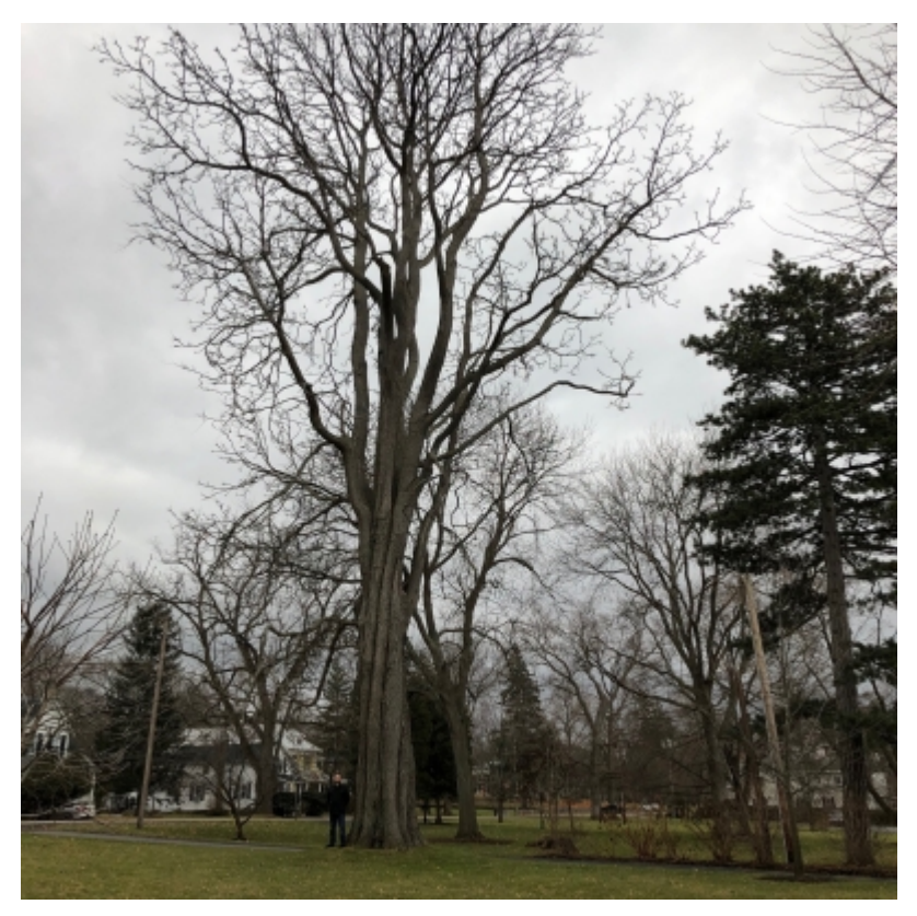
NYS Champion Gymnocladus in Auburn, NY