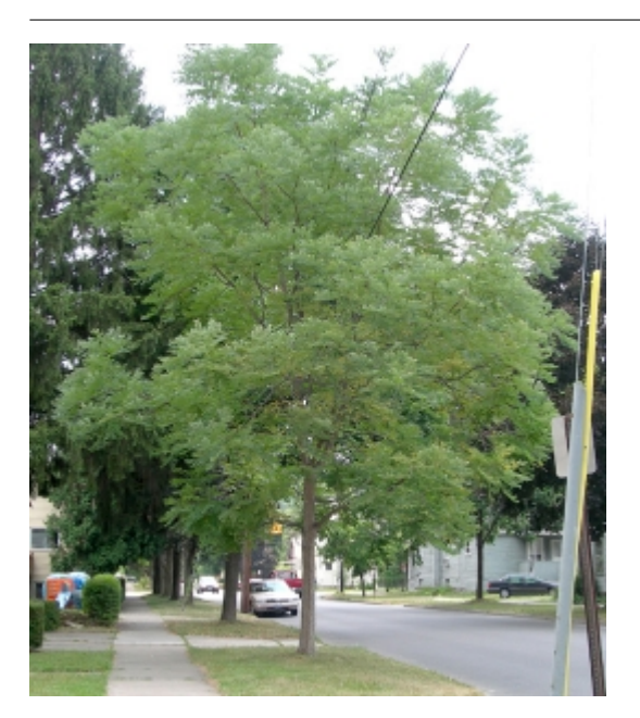
Gymnocladus dioicus - Habit