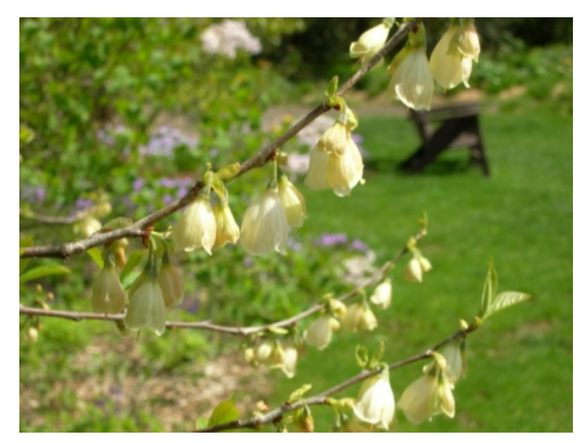
Halesia tetraptera - Flowers