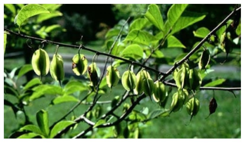
Halesia tetraptera - Fruit