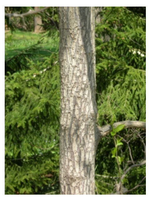
Halesia tetraptera - Bark