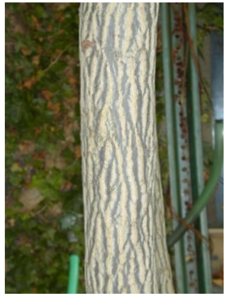
Halesia tetraptera - Bark