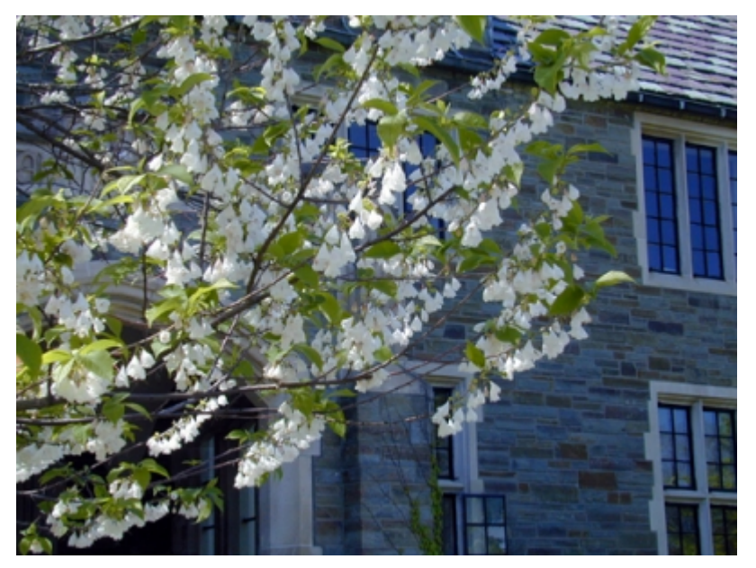
Halesia tetraptera - Flowers