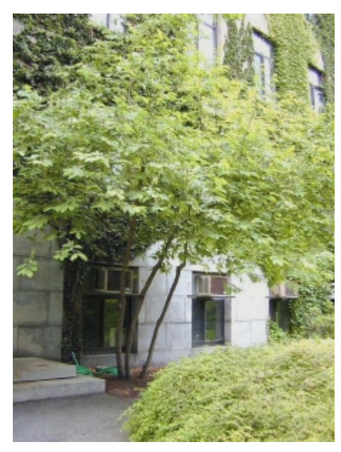
Halesia tetraptera - Habit