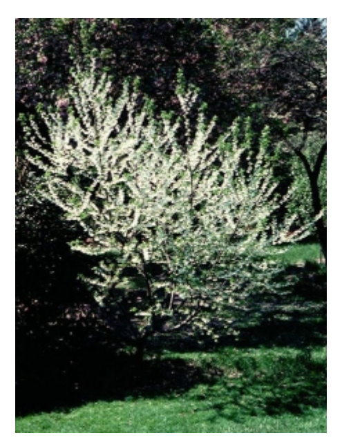
Halesia tetraptera - Habit