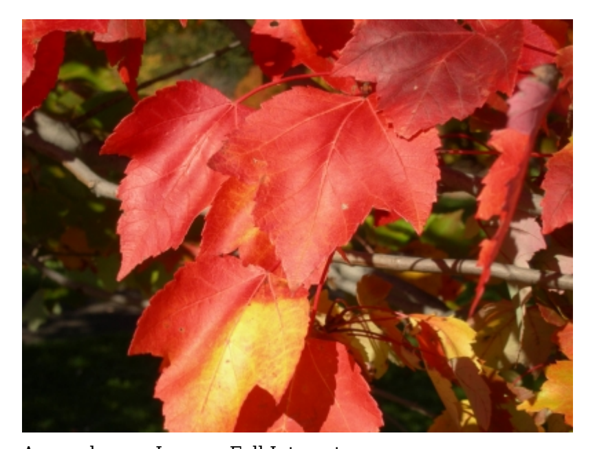
Acer rubrum - Leaves, Fall Interest