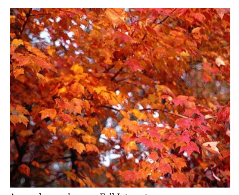
Acer rubrum - Leaves, Fall Interest