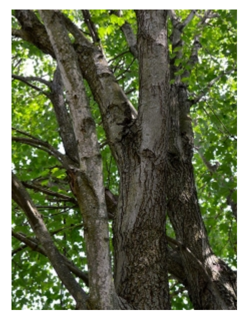
Acer rubrum - Bark