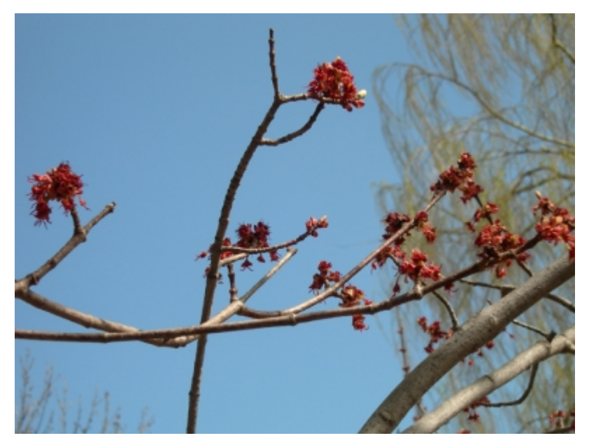
Acer rubrum - Flowers