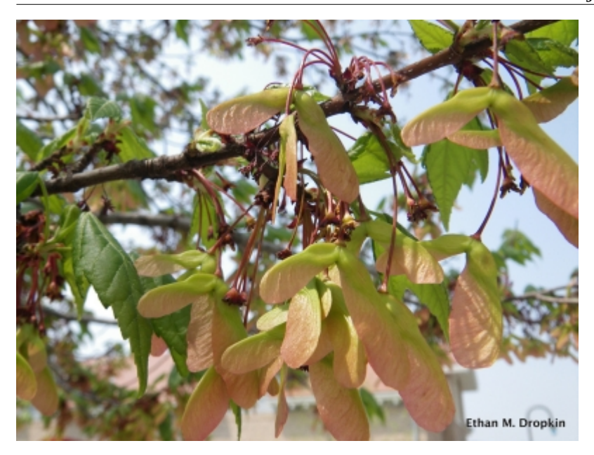
Acer rubrum - Flowers, Seeds