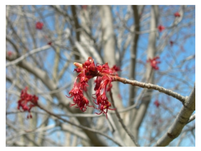
Acer rubrum - Flowers