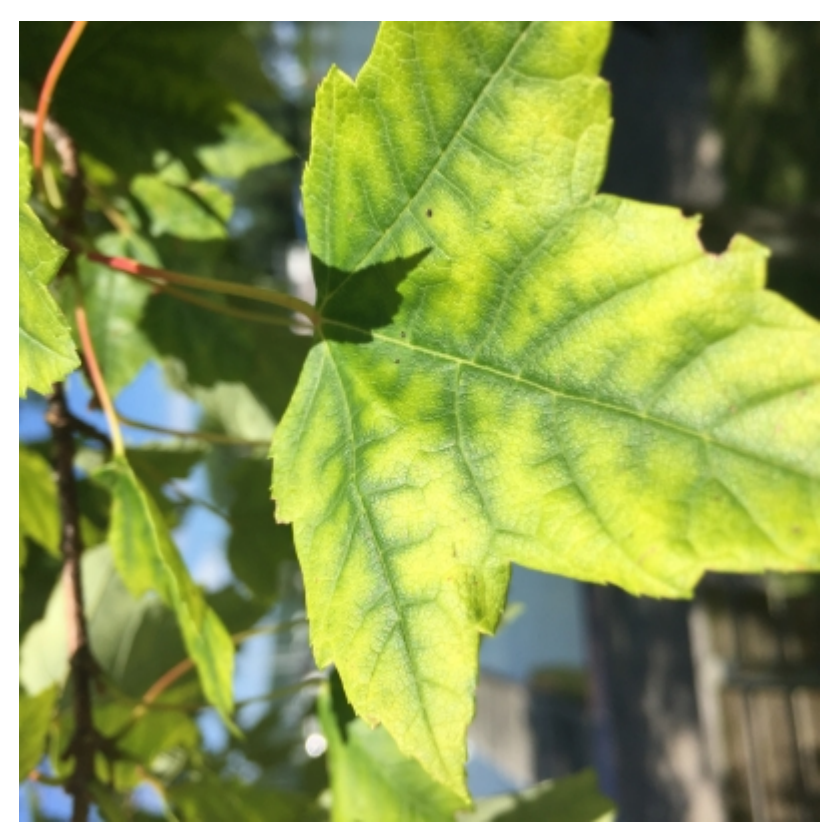
Acer rubrum chlorotic foliage