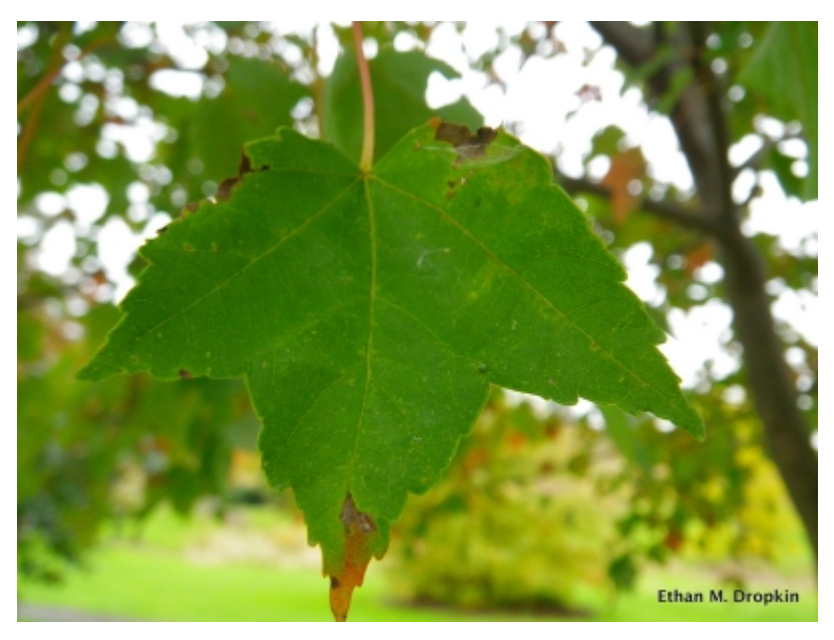
Acer rubrum - Leaf