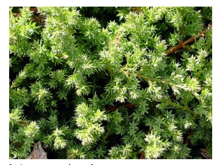
Juniperus procumbens - Leaves