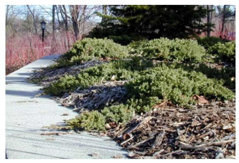
Juniperus procumbens - Habit