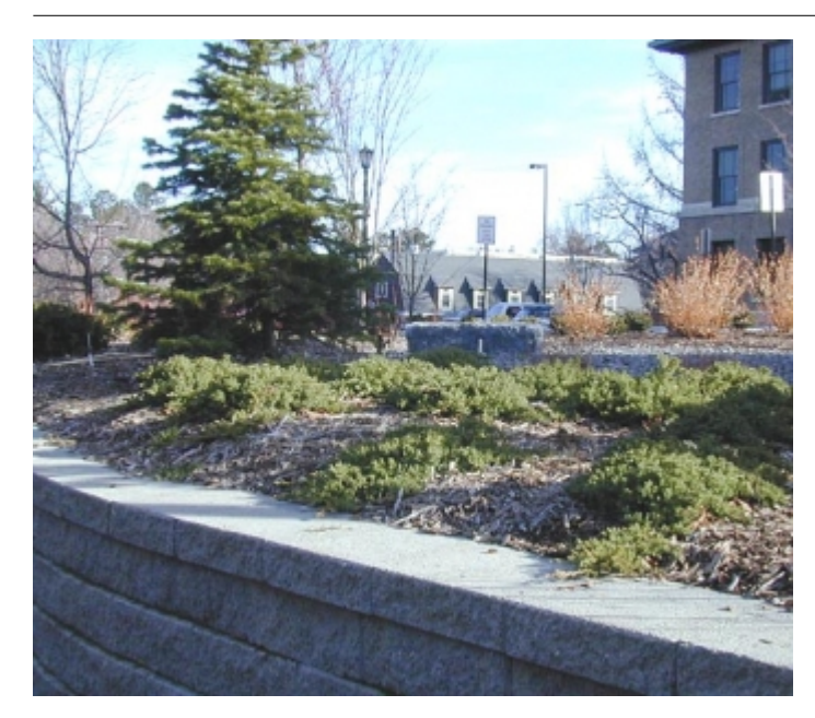
Juniperus procumbens - Habit