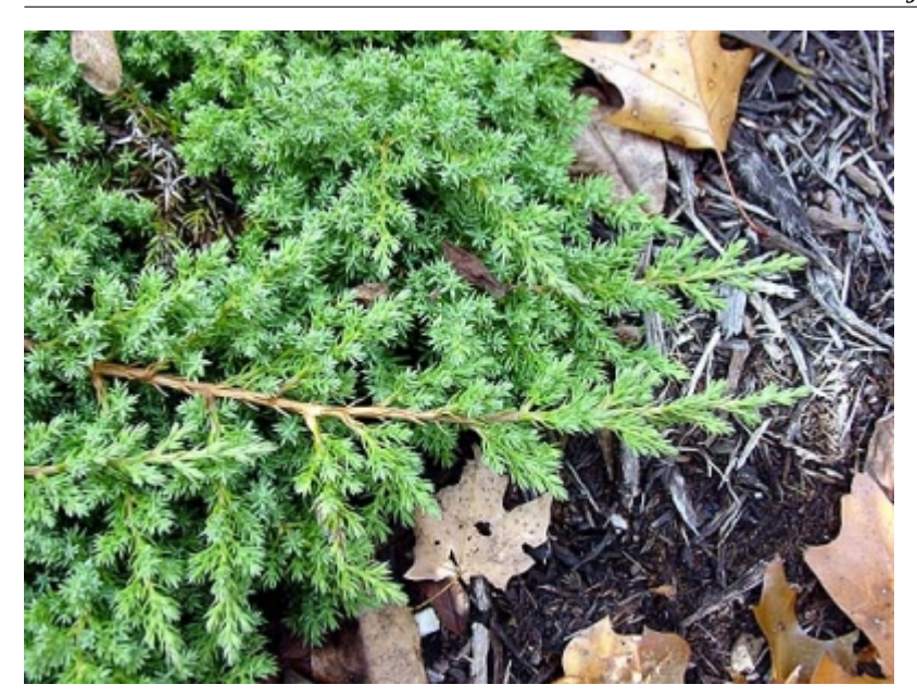
Juniperus procumbens - Leaves