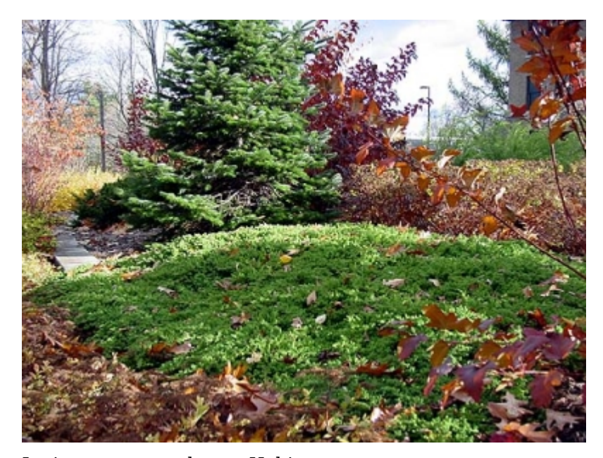
Juniperus procumbens - Habit