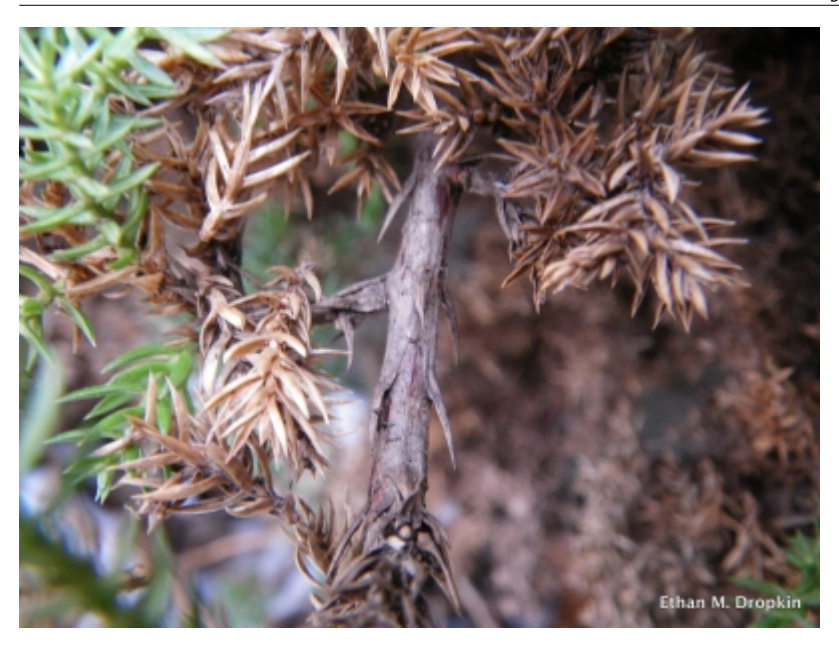
Juniperus procumbens - Bark