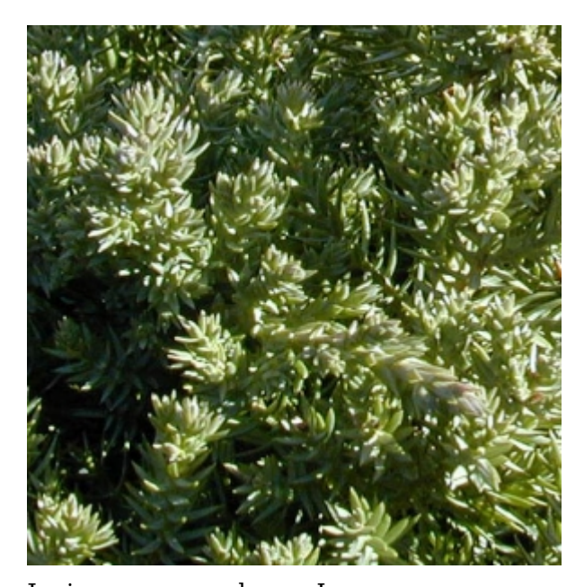
Juniperus procumbens - Leaves