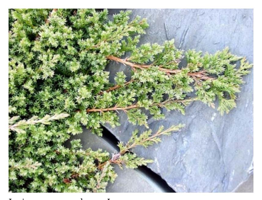
Juniperus procumbens - Leaves