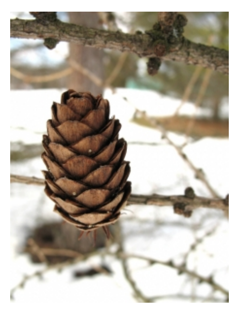
Larix decidua - Cone