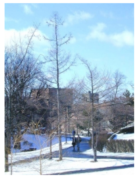
Larix decidua - Habit