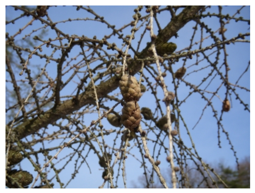
Larix decidua - Cones