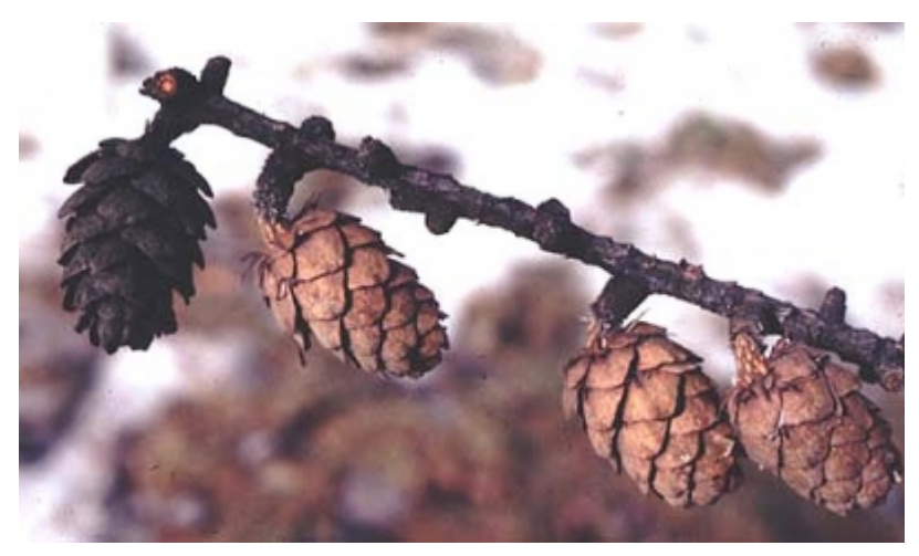
Larix decidua - Cones