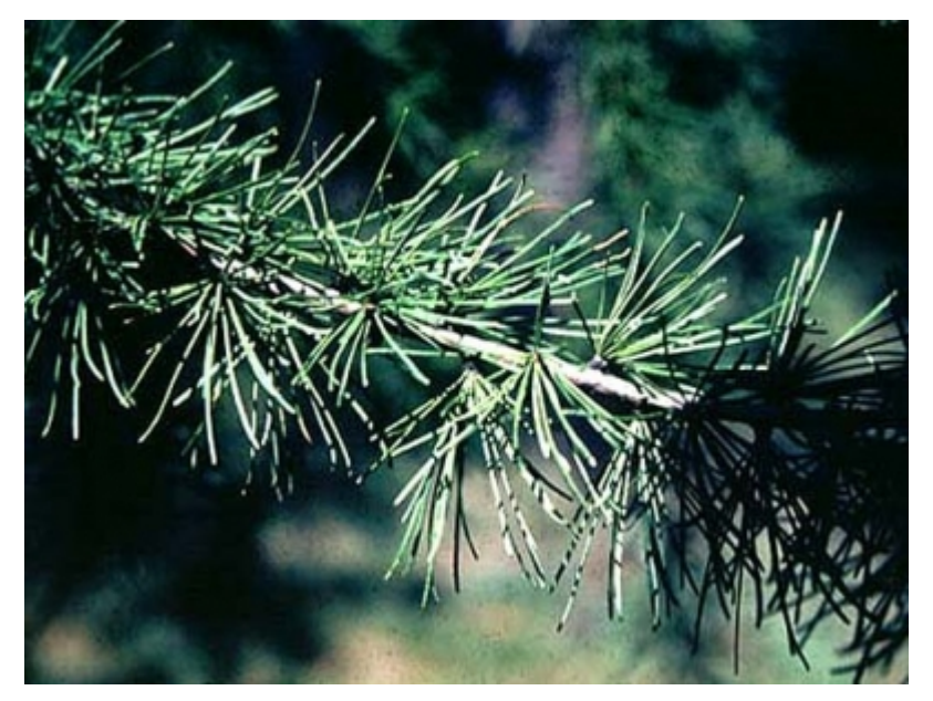
Larix decidua - Leaves