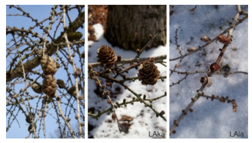
Larix decidua - Cones