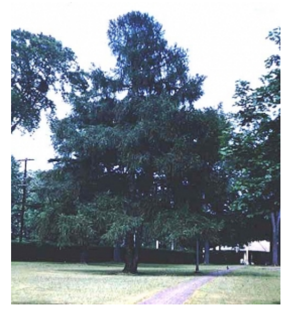
Larix decidua - Habit