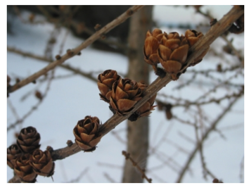
Larix laricina - Cones