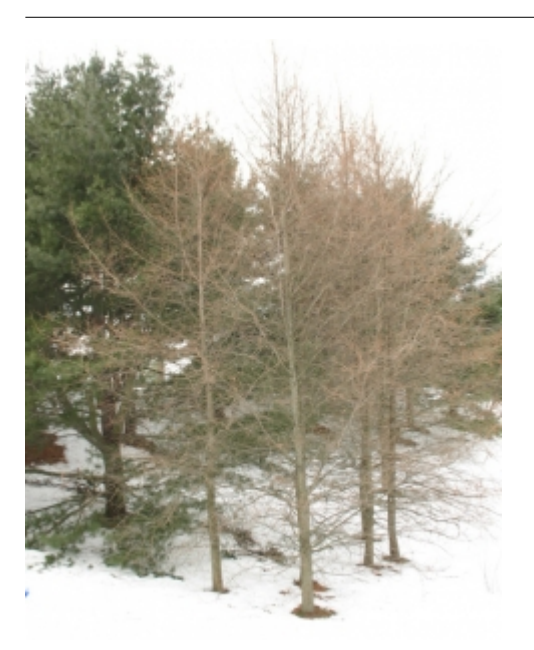
Larix laricina - Habit