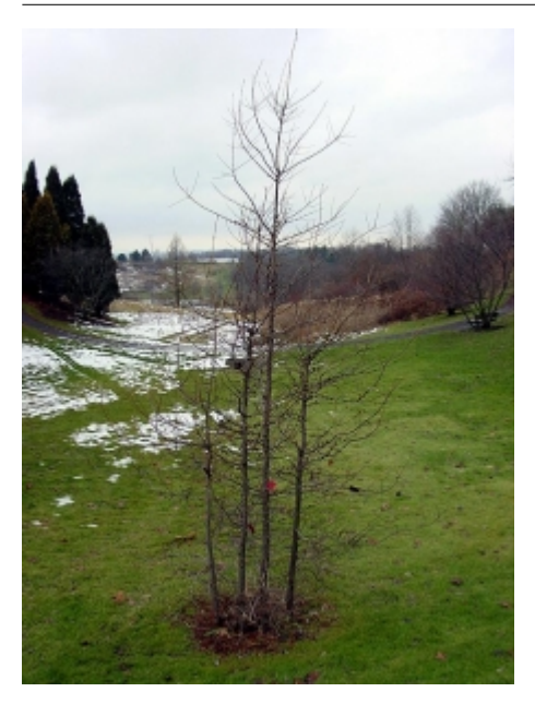
Larix laricina - Habit