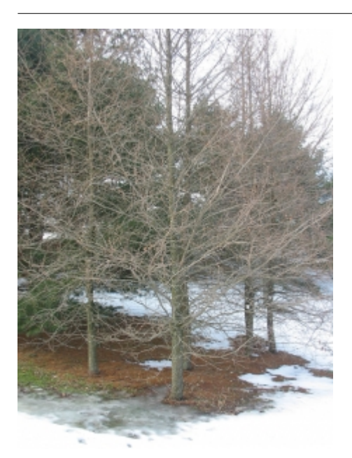
Larix laricina - Habit