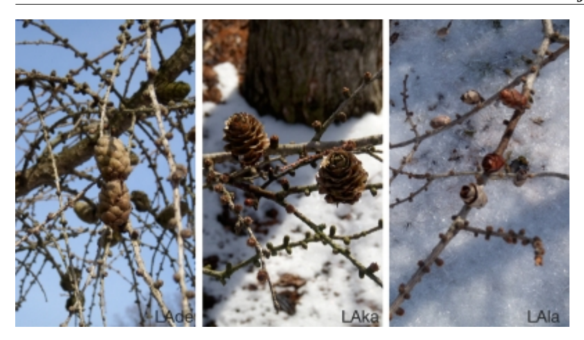
Larix laricina - Cones