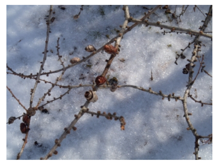
Larix laricina - Cones