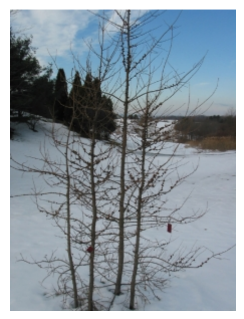
Larix laricina - Habit