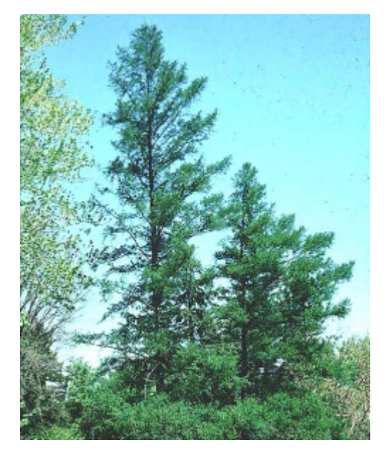
Larix laricina - Habit