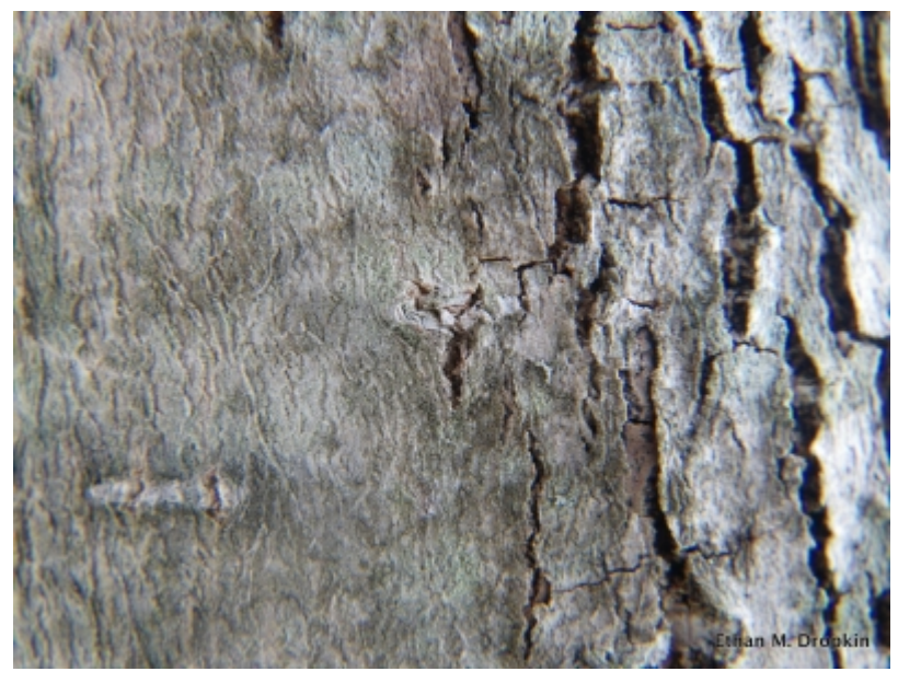
Magnolia acuminata - Bark