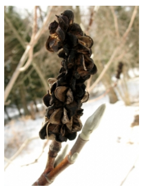
Magnolia acuminata - Fruit