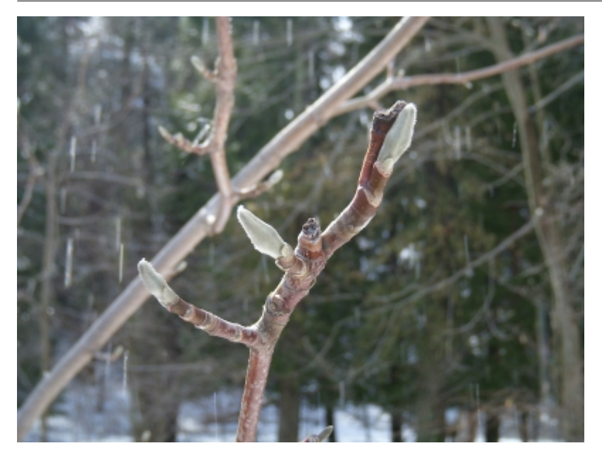
Magnolia acuminata - Buds