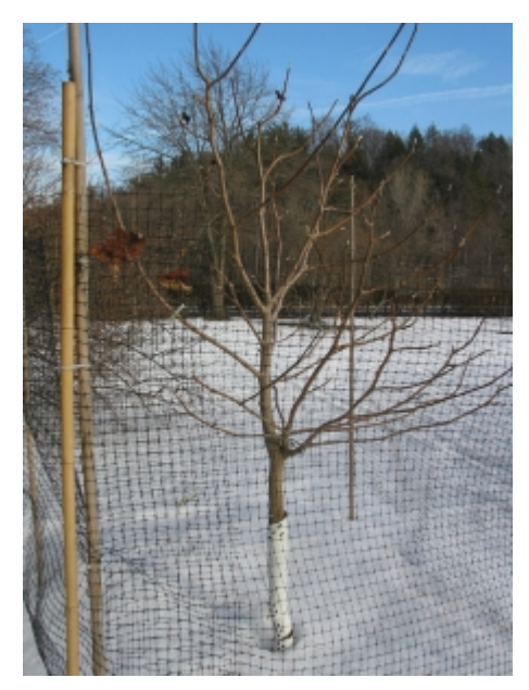
Magnolia acuminata - Habit