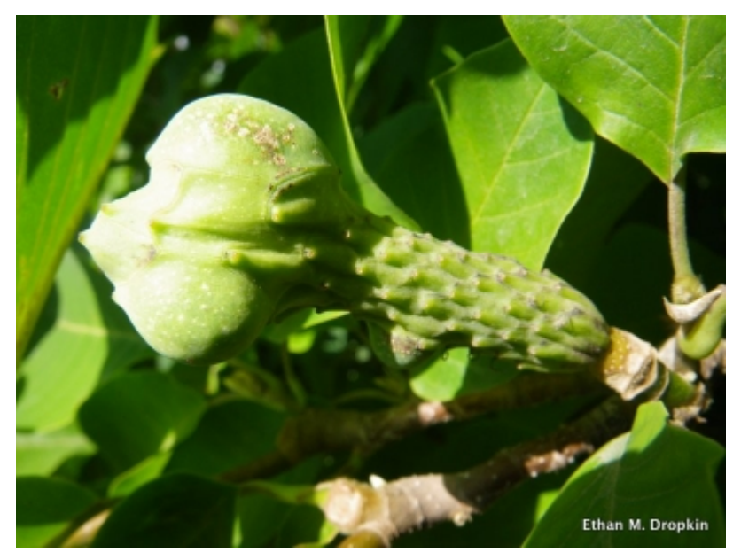
Magnolia acuminata - Fruit