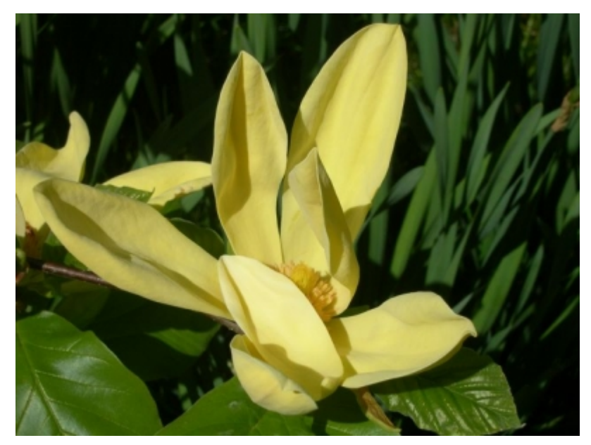
Magnolia acuminata - Flowers