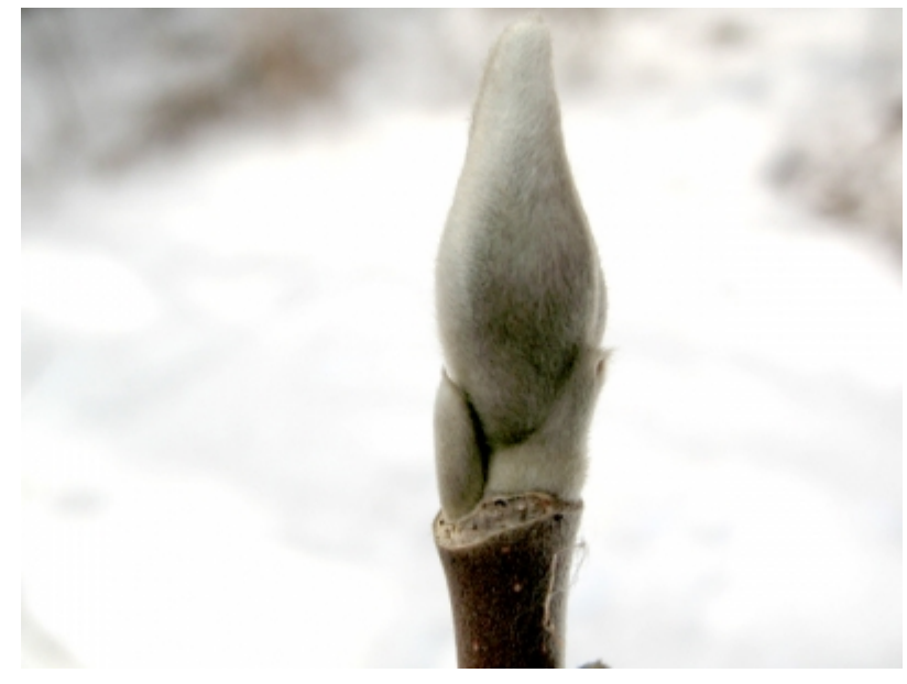
Magnolia acuminata - Bud