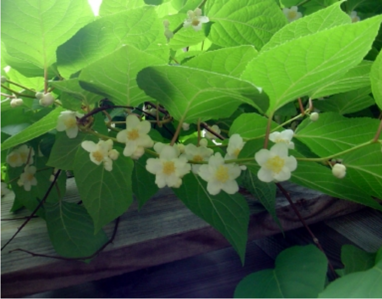
Actinidia arguta - Flowers