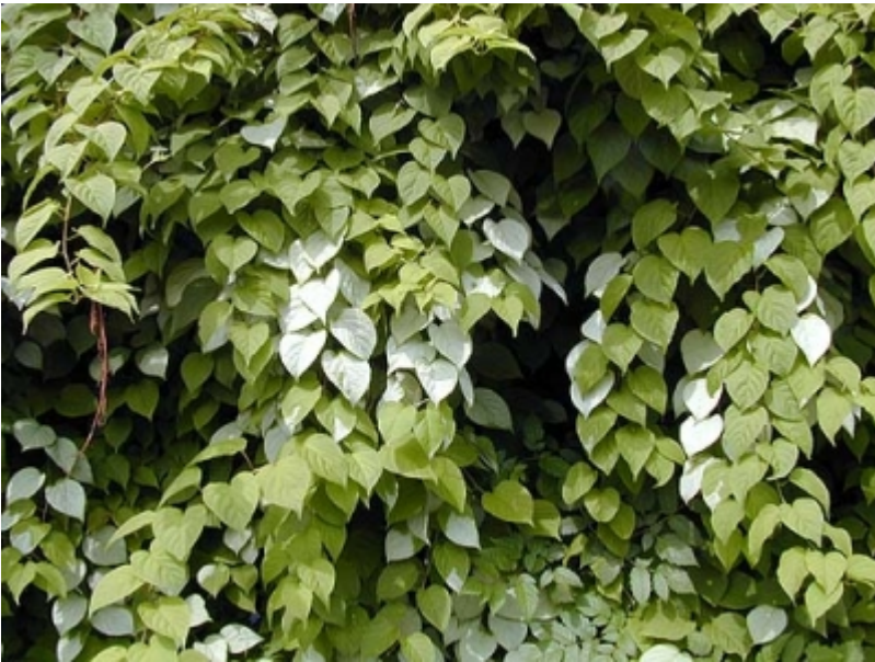
Actinidia arguta - Leaves