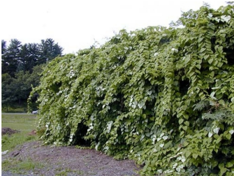
Actinidia arguta - Habit