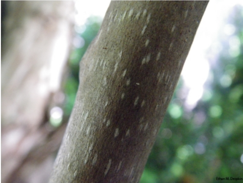
Actinidia arguta - Bark