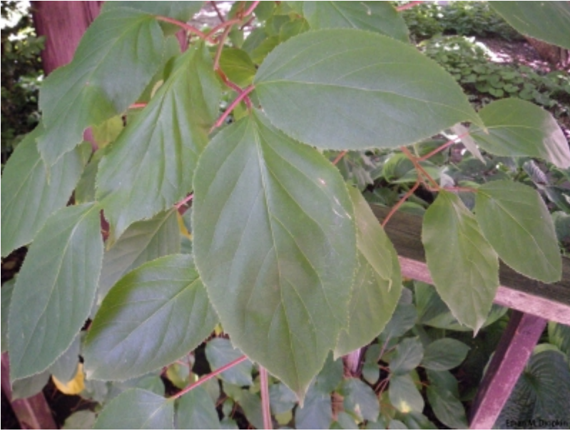
Actinidia arguta - Leaves