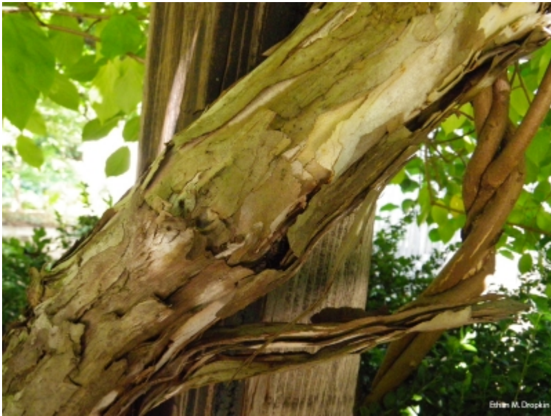
Actinidia arguta - Bark