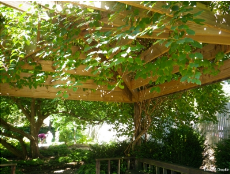
Actinidia arguta - Habit