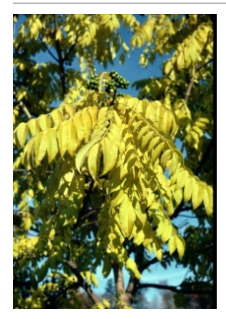
Phellodendron amurense - Leaves, Fall Interest