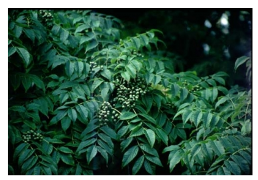
Phellodendron amurense - Leaves, Fruit