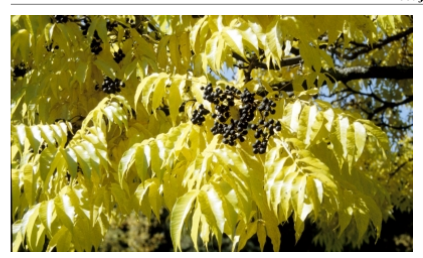
Phellodendron amurense - Leaves, Fall Interest, Fruit