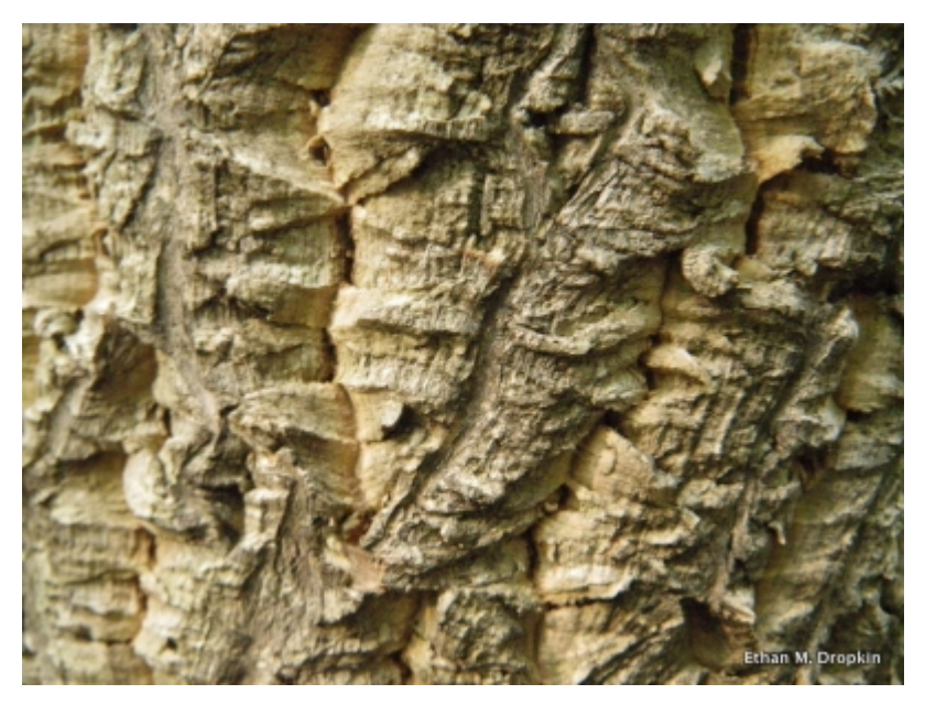
Phellodendron amurense - Bark