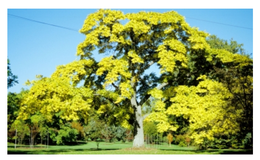
Phellodendron amurense - Habit, Fall Interest