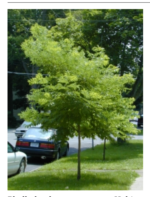
Phellodendron amurense - Habit