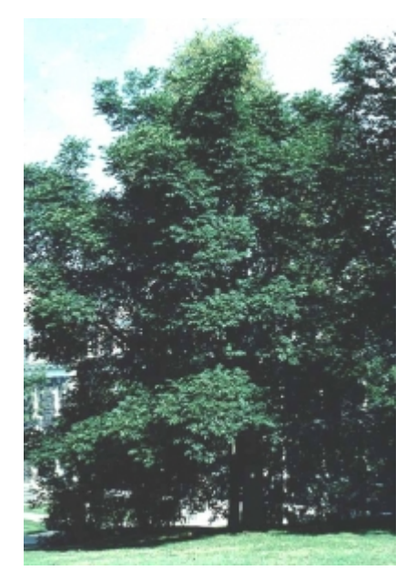
Phellodendron amurense - Habit