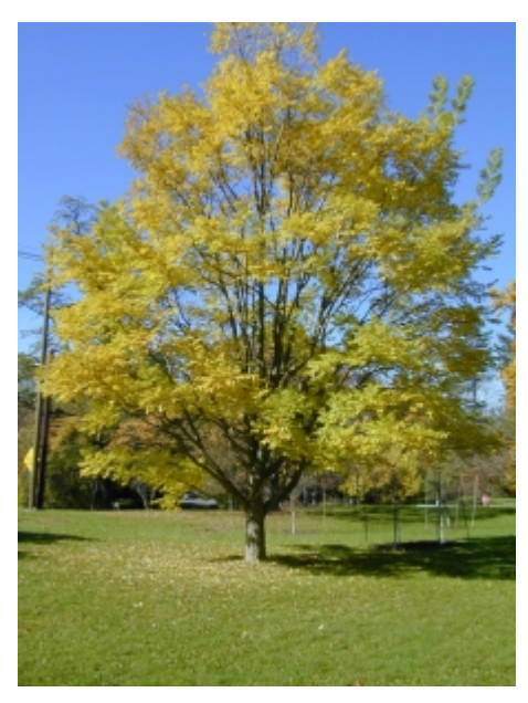
Phellodendron amurense - Habit, Fall Interest