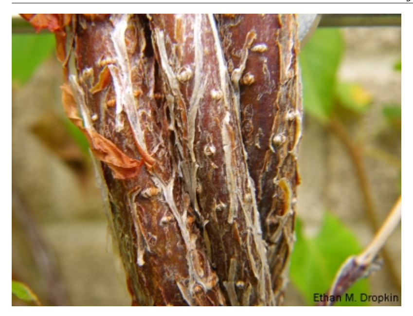
Polygonum aubertii - Bark