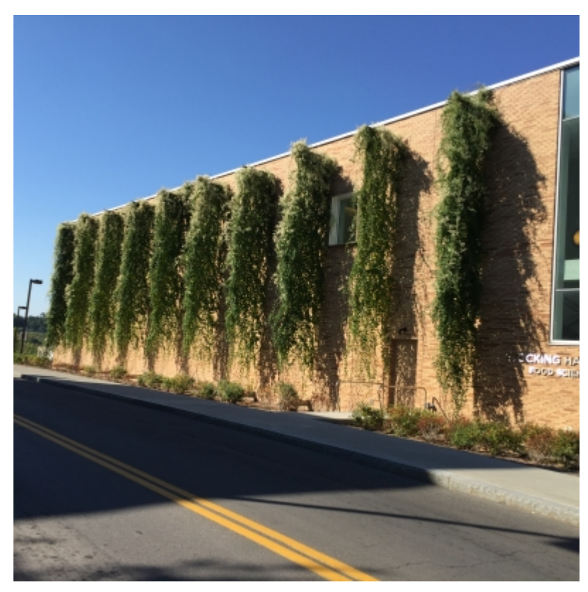
Polygonum on tall trellis