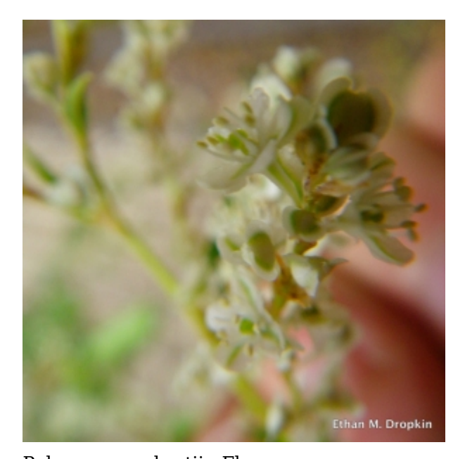
Polygonum aubertii - Flower