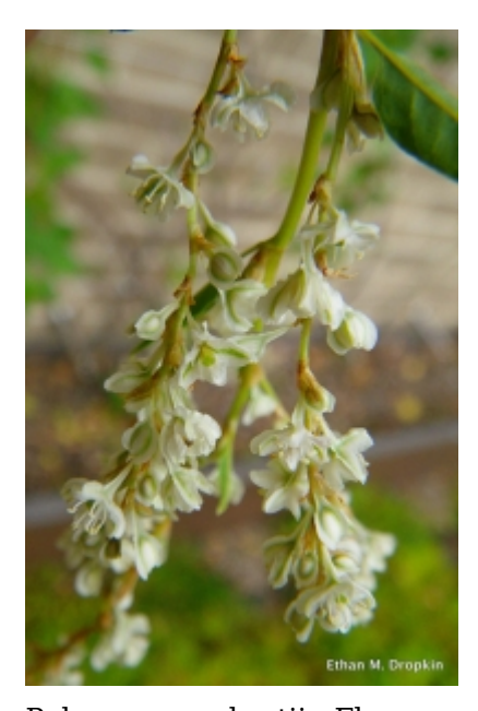
Polygonum aubertii - Flowers