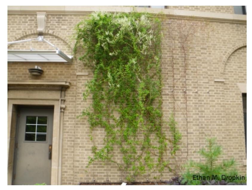
Polygonum aubertii - Habit