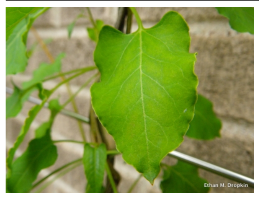
Polygonum aubertii - Leaf