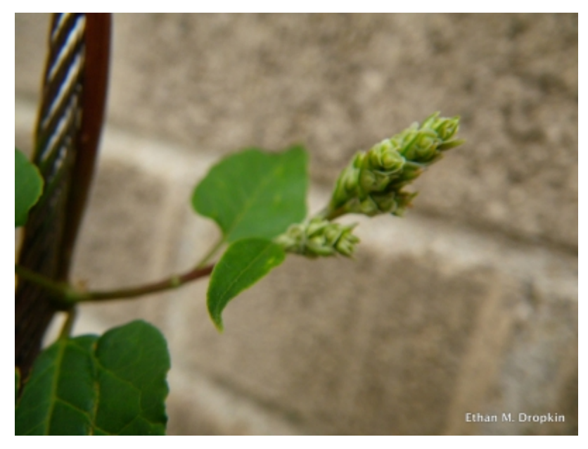
Polygonum aubertii - Buds