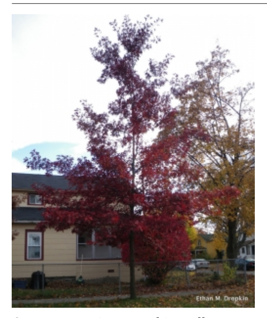
Quercus coccinea - Habit, Fall Interest