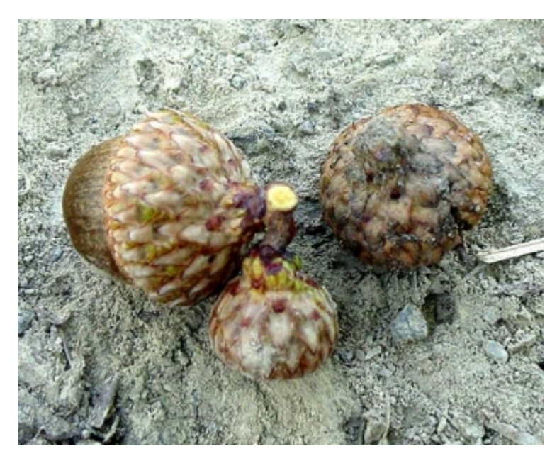
Quercus coccinea - Acorns