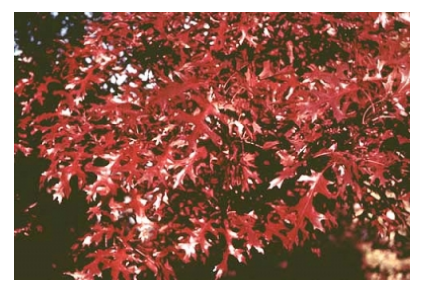
Quercus coccinea - Leaves, Fall Interest