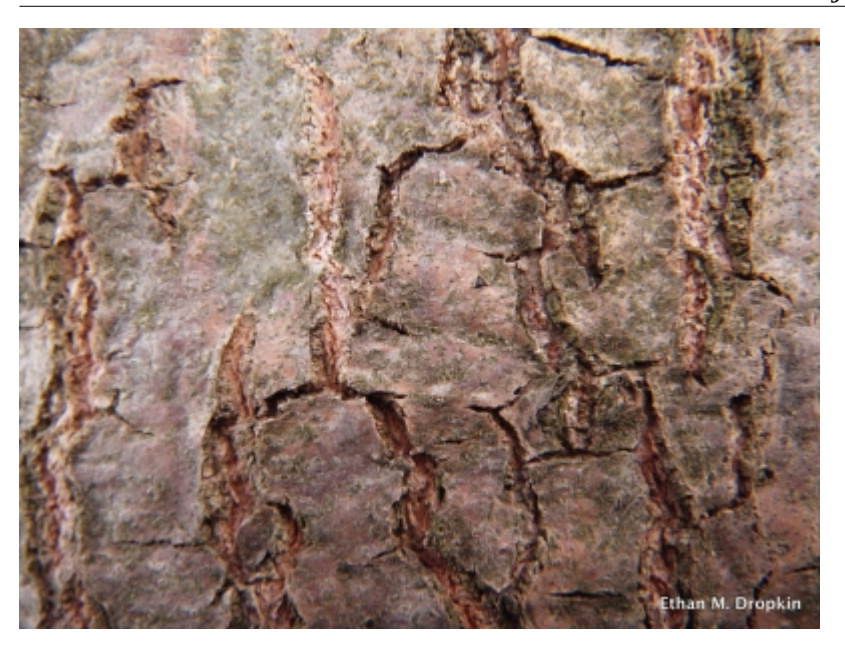
Quercus coccinea - Bark