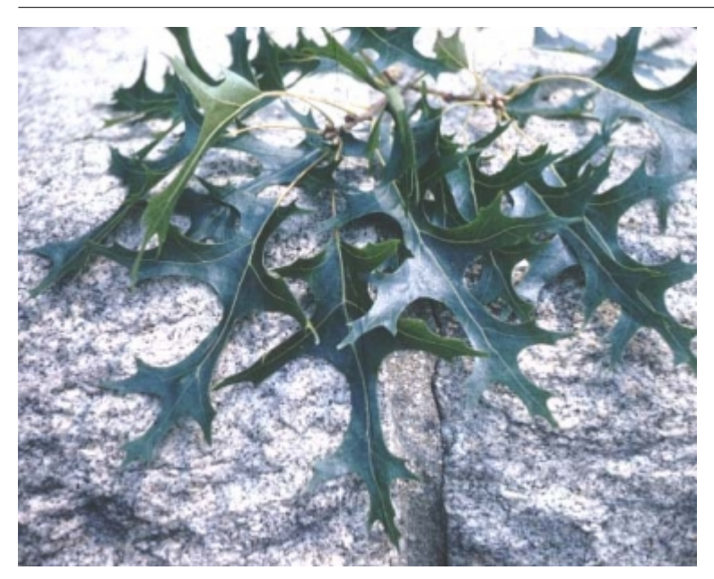
Quercus coccinea - Leaves