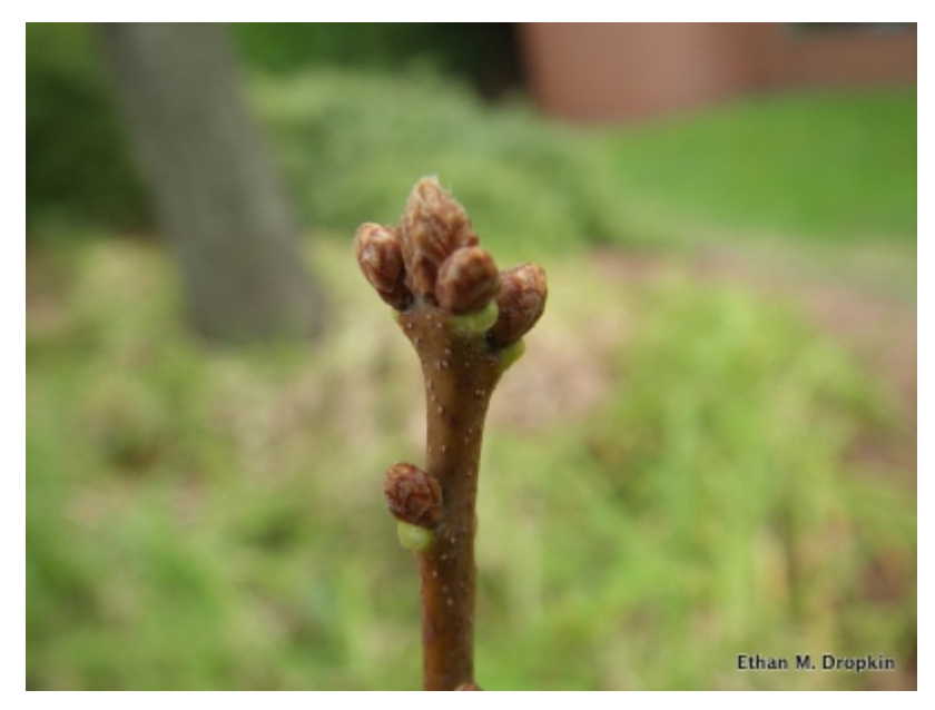
Quercus coccinea - Buds