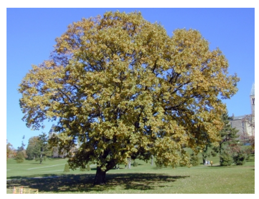
Quercus macrocarpa - Habit, Fall Interest