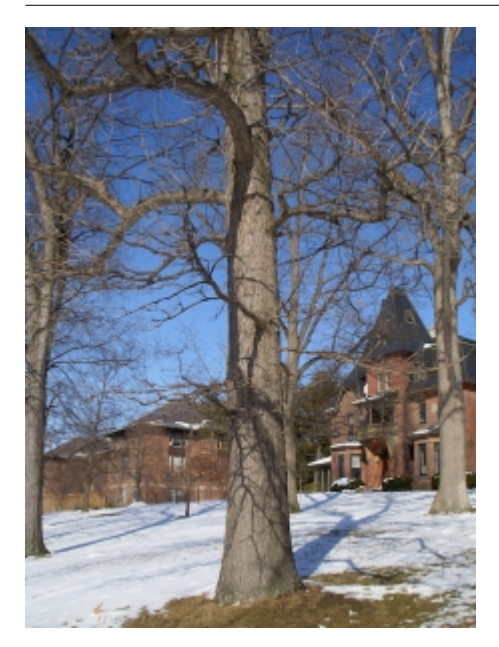
Quercus macrocarpa - Bark, Habit