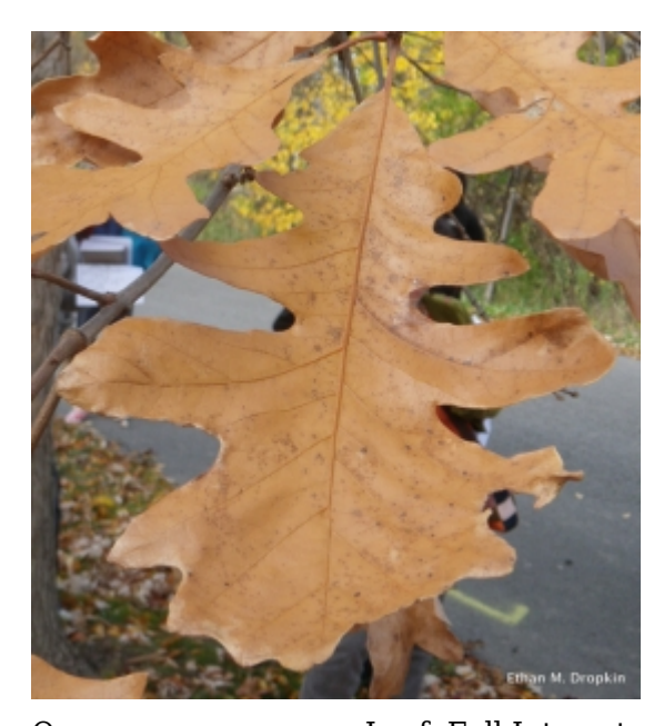
Quercus macrocarpa - Leaf, Fall Interest