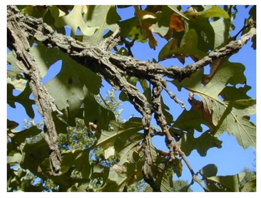
Quercus macrocarpa - Leaves, Bark