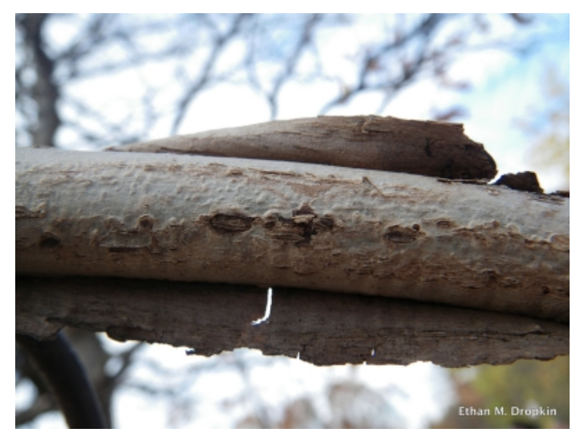
Quercus macrocarpa - Bark 'Cork Wings'