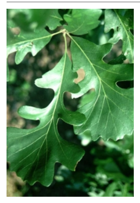
Quercus macrocarpa - Leaves