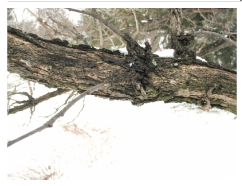
Quercus macrocarpa - Bark