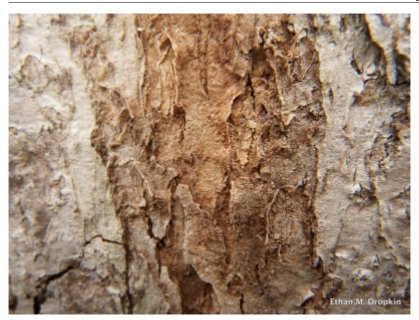
Quercus macrocarpa - Bark