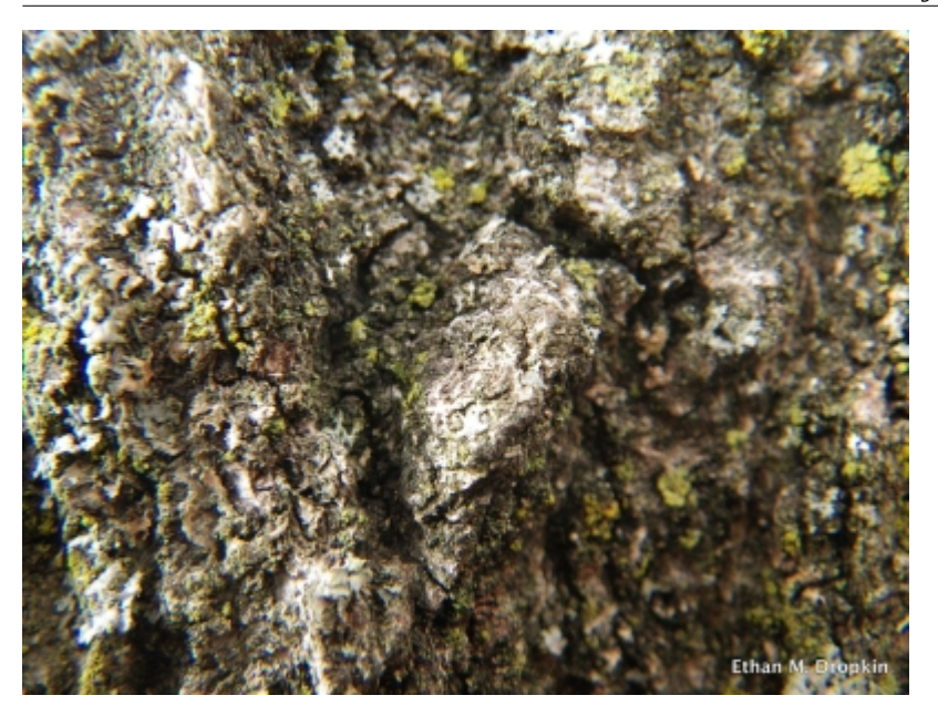
Quercus palustris - Bark