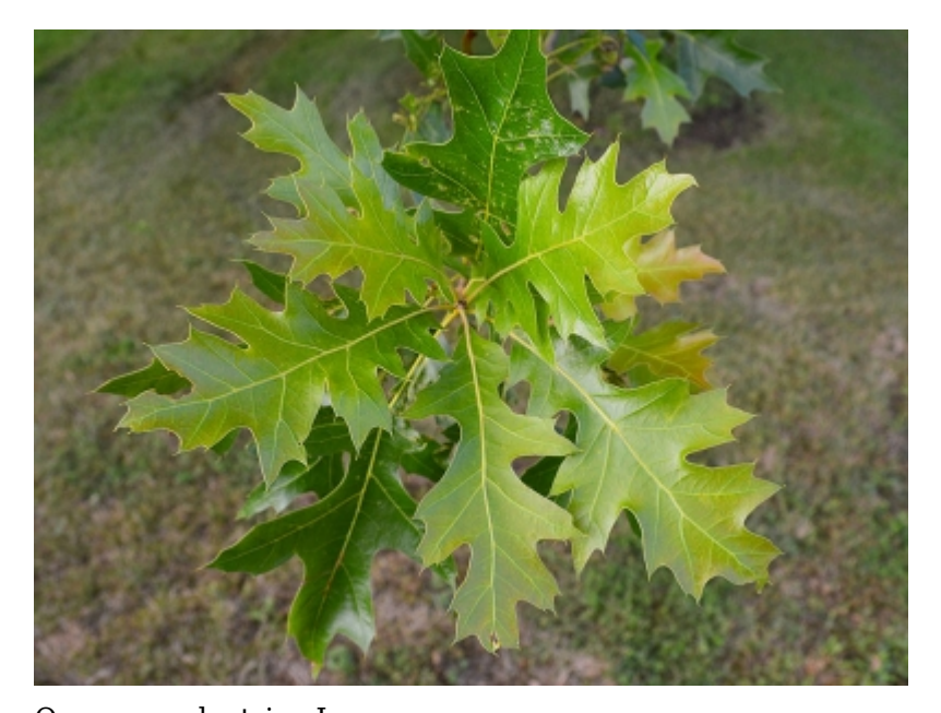
Quercus palustris - Leaves