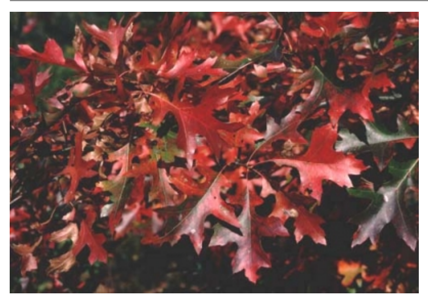
Quercus palustris - Leaves, Fall Interest