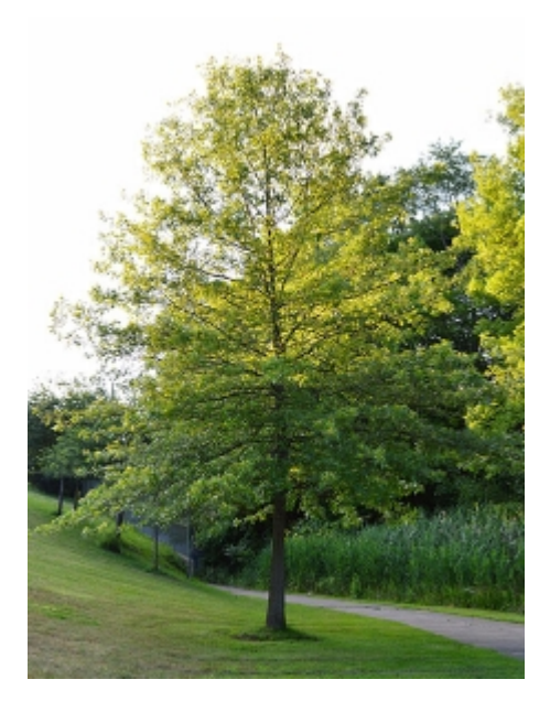
Quercus palustris - Habit