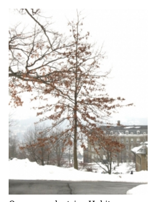
Quercus palustris - Habit