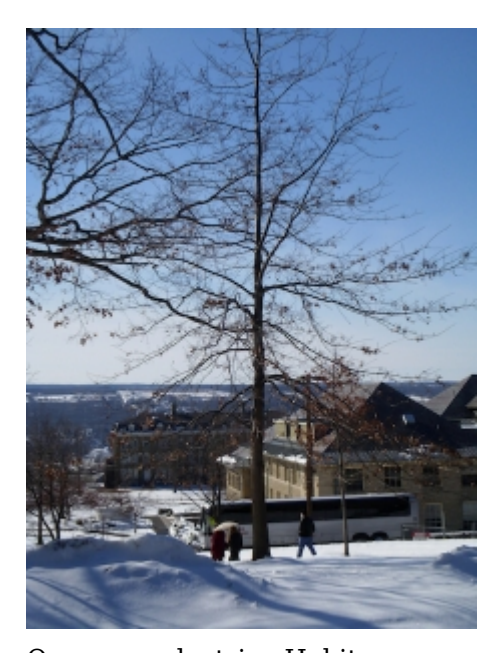
Quercus palustris - Habit