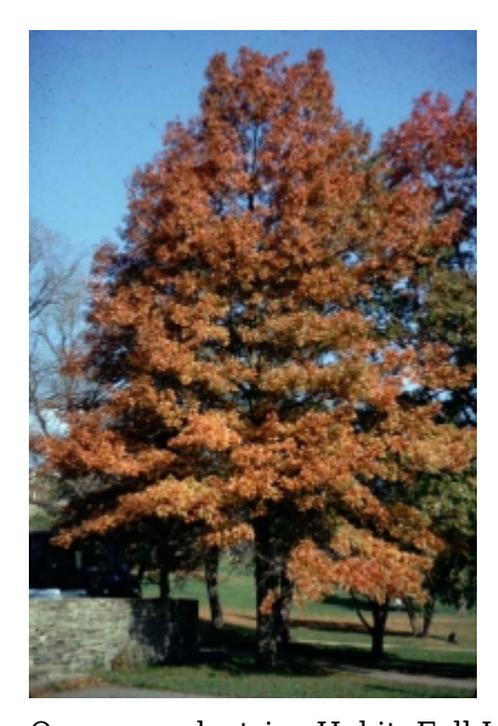
Quercus palustris - Habit, Fall Interest