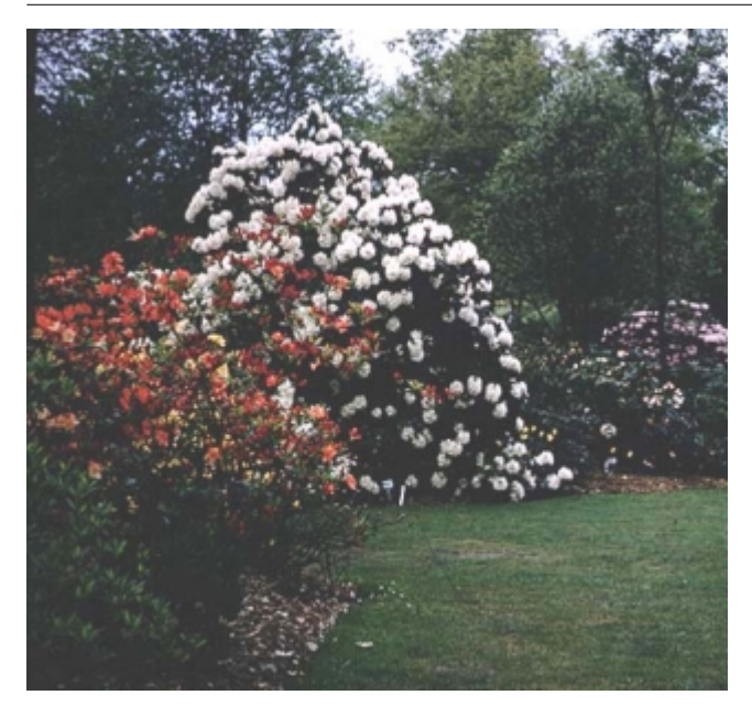
Rhododendron catawbiense - Habit, Flowers