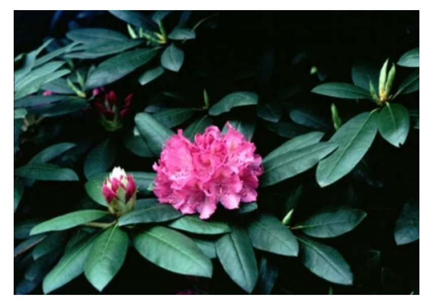
Rhododendron catawbiense - Leaves, Flowers