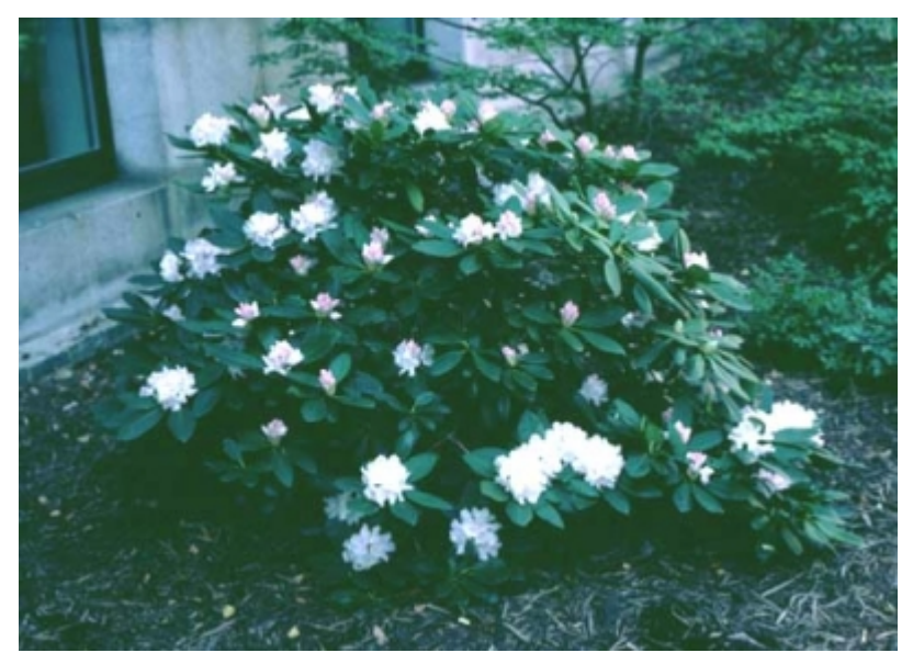
Rhododendron catawbiense - Habit, Flowers