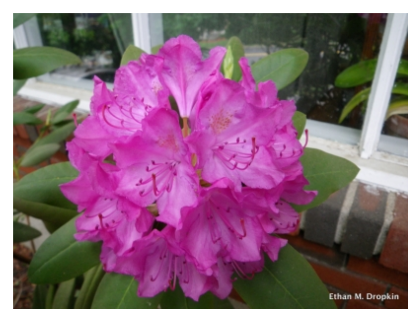
Rhododendron catawbiense - Flowers