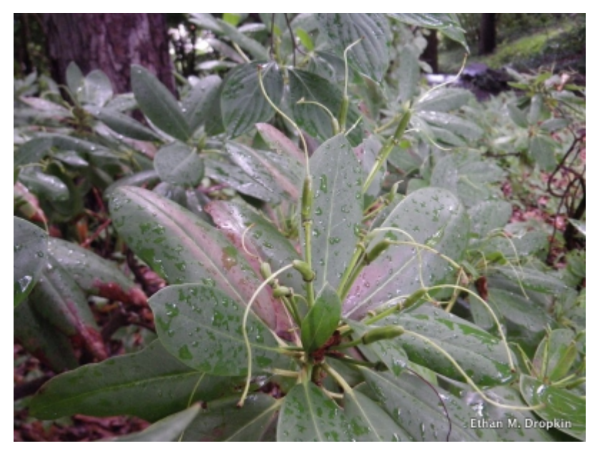
Rhododendron catawbiense - Leaves, Fruit