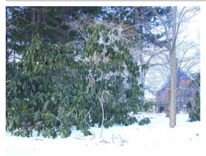
Rhododendron catawbiense - Habit