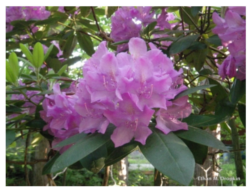
Rhododendron catawbiense - Flowers