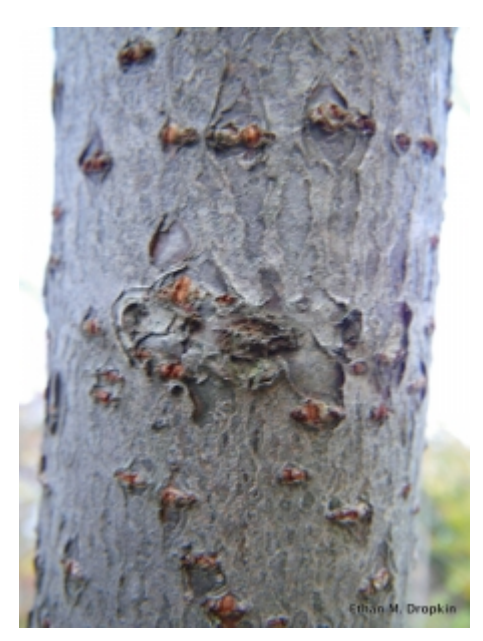
Rhus typhina - Bark