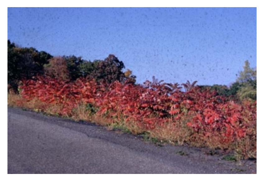
Rhus typhina - Habit, Fall Interest