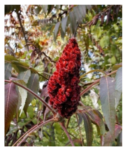
Rhus typhina - Fruit