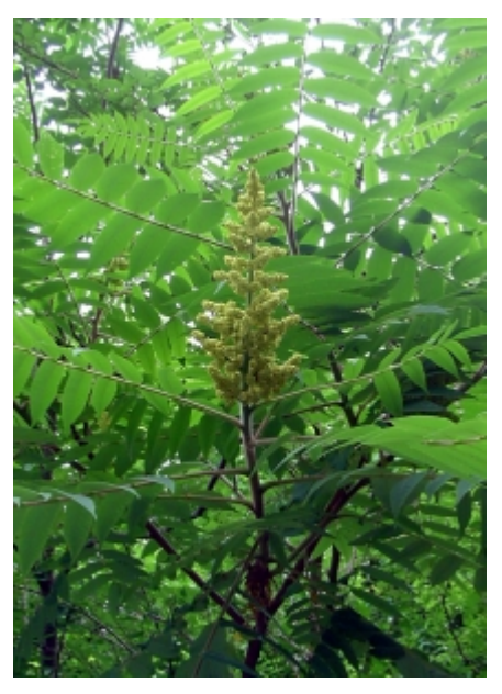
Rhus typhina - Leaves, Flowers