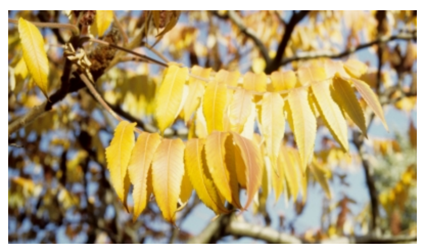
Rhus typhina - Leaves, Fall Interest