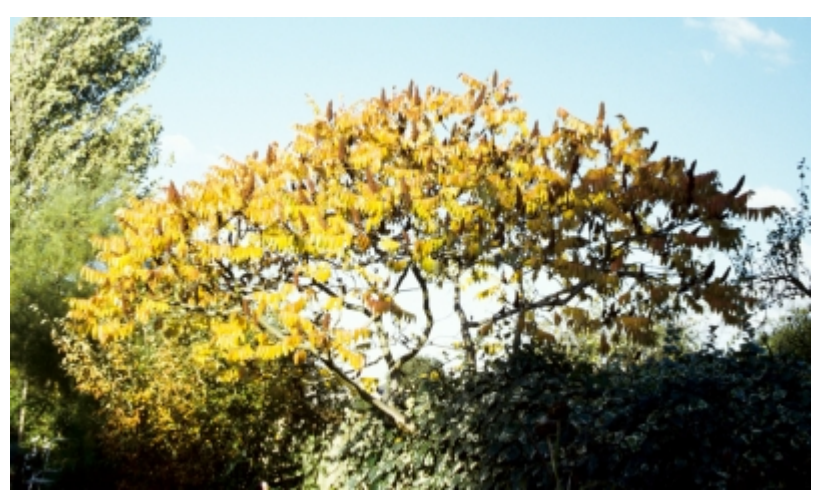
Rhus typhina - Habit, Fall Interest