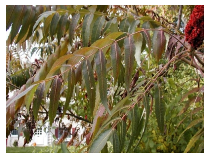
Rhus typhina - Leaves, Fall Interest