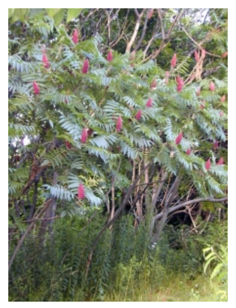
Rhus typhina - Habit