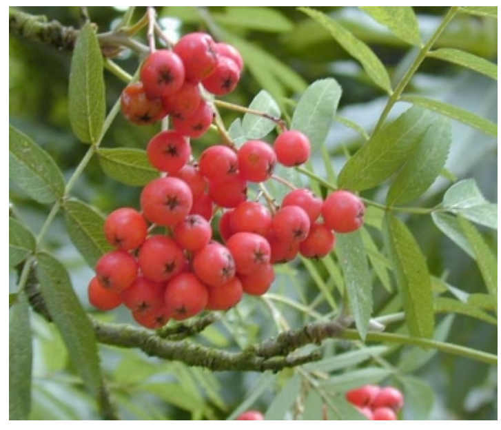
Sorbus aucuparia - Fruit