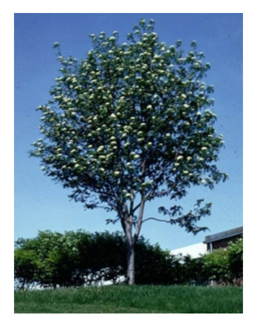
Sorbus aucuparia - Habit