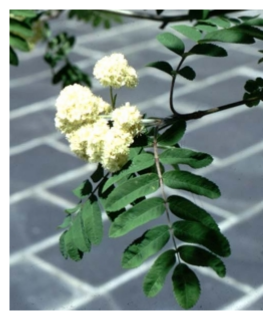
Sorbus aucuparia - Flowers, Leaves