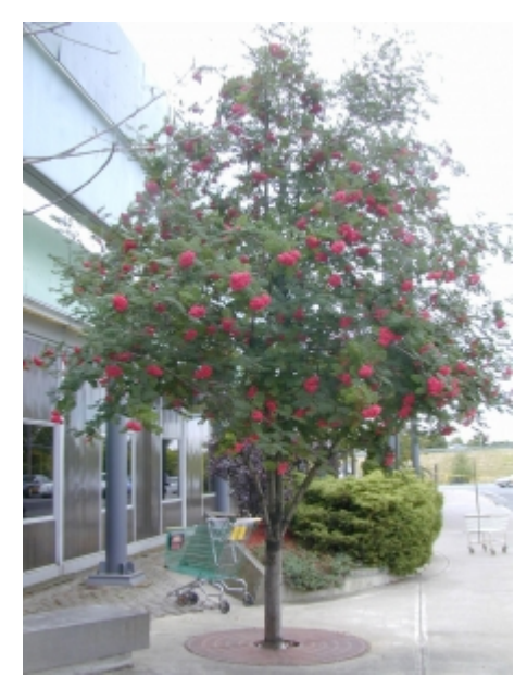
Sorbus aucuparia - Habit