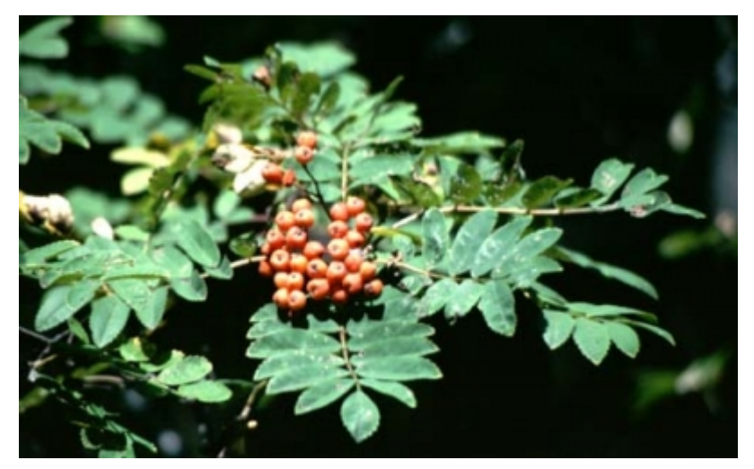
Sorbus aucuparia - Fruit, Leaves