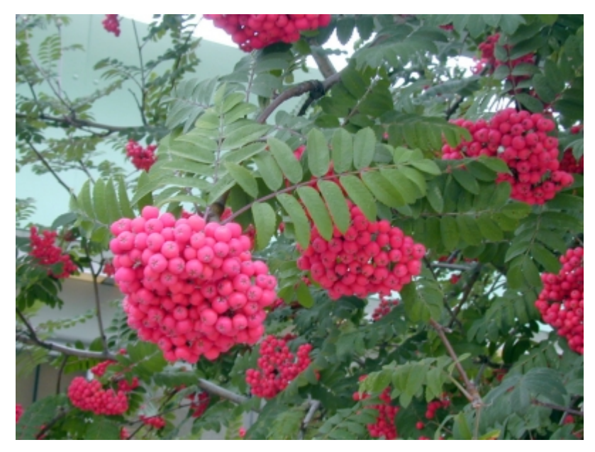
Sorbus aucuparia - Leaves, Fruit