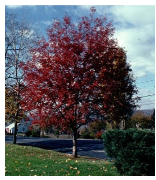
Sorbus aucuparia - Habit, Fall Interest