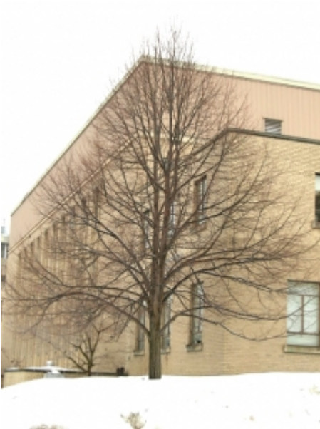
Tilia cordata - Habit