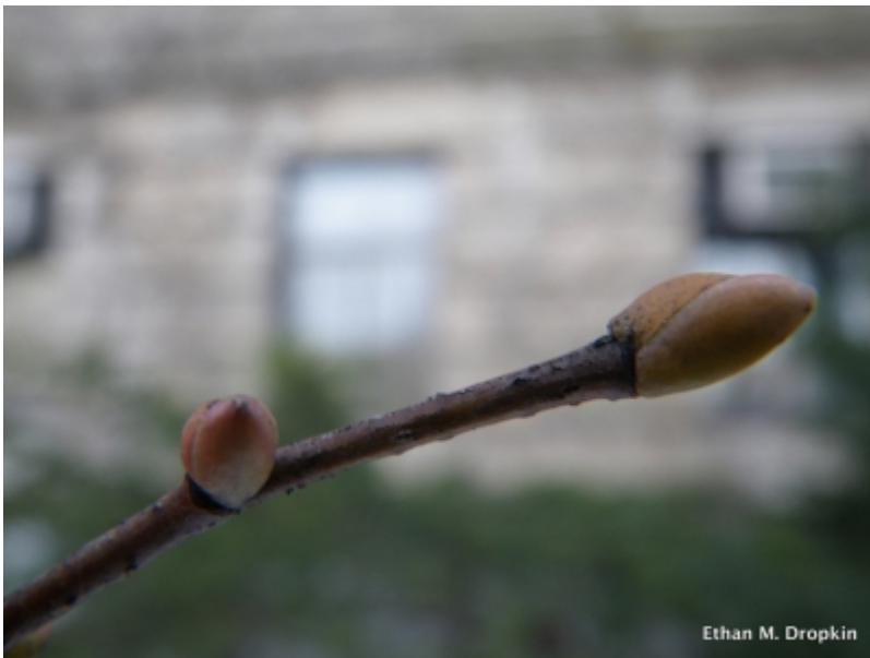
Tilia cordata - Buds