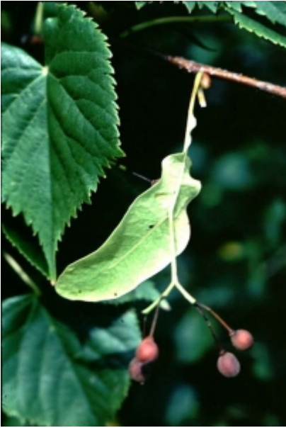
Tilia cordata - Fruit