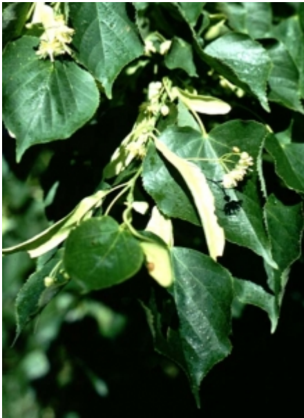
Tilia cordata - Flowers