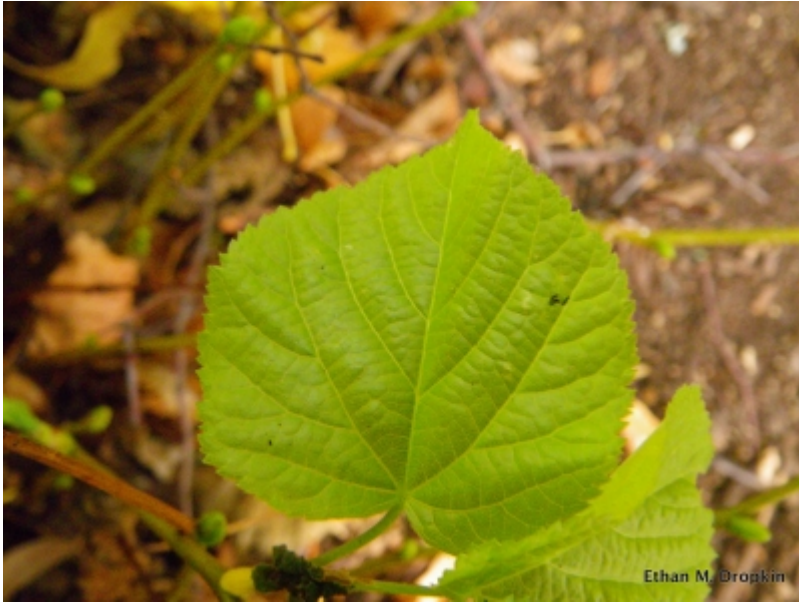
Tilia cordata - Leaf