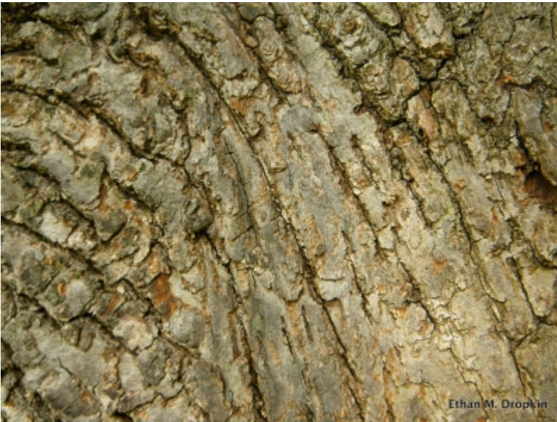
Tilia cordata - Bark