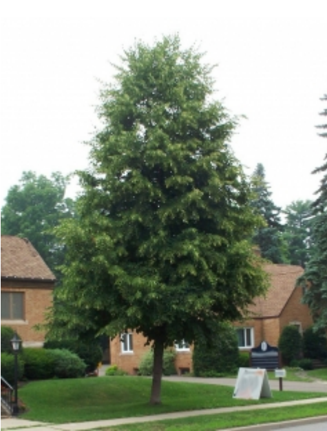
Tilia cordata 'Glenleven' - Habit