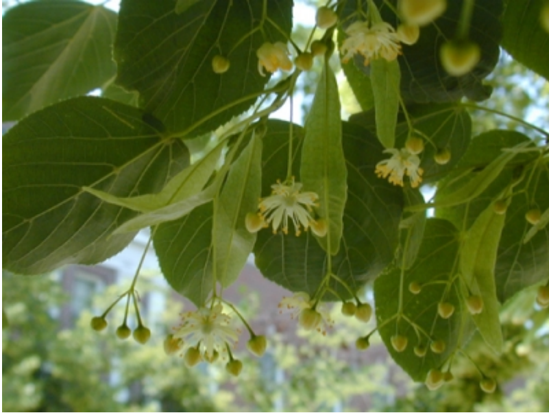
Tilia cordata - Flowers