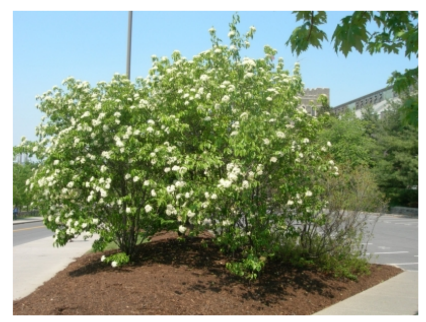
Viburnum lentago - Habit