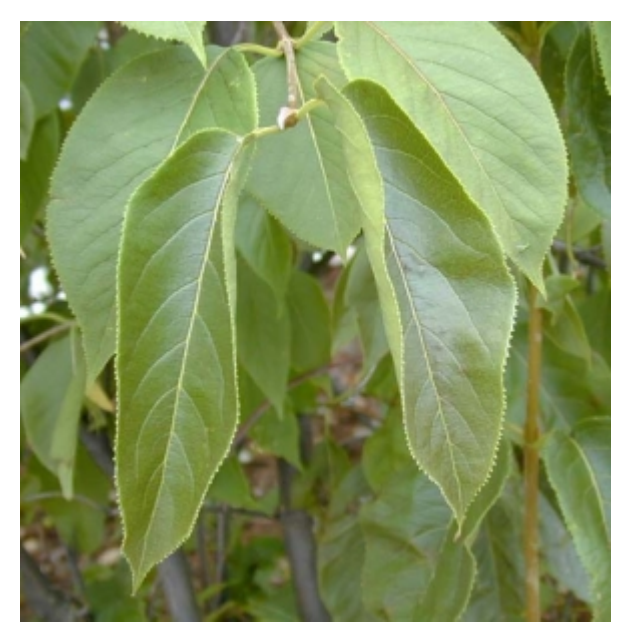
Viburnum lentago - Leaves