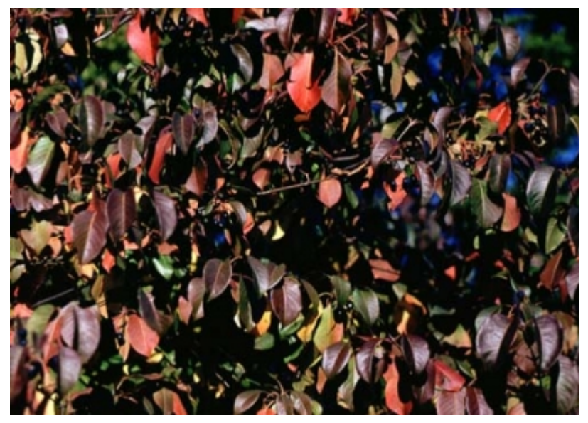
Viburnum lentago - Fall Interest