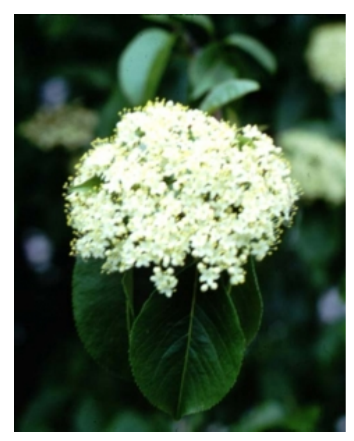
Viburnum lentago - Flowers