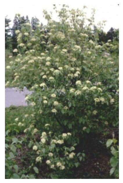
Viburnum lentago - Habit