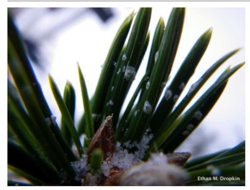
Pinus aristata - Sap Dots