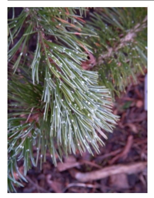
Pinus aristata - Leaves