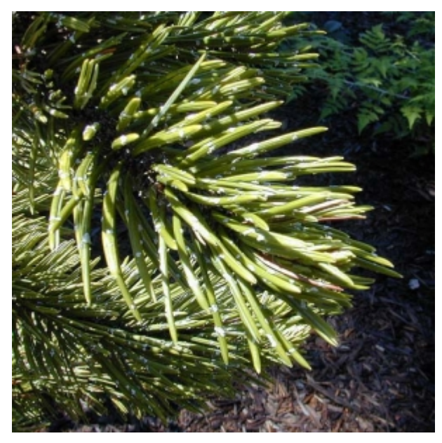
Pinus aristata - Leaves