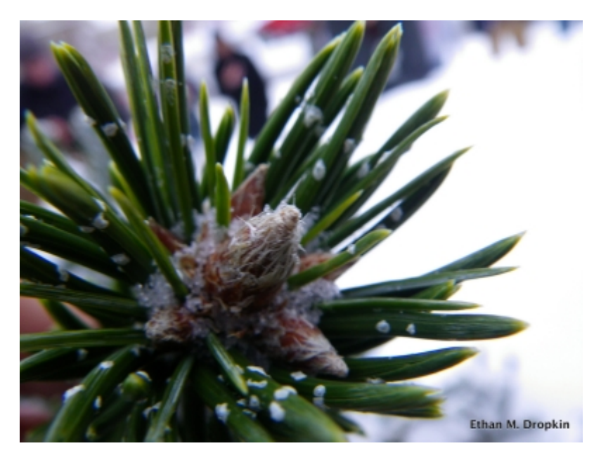
Pinus aristata - Buds