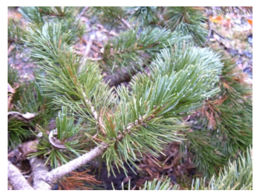
Pinus aristata - Leaves