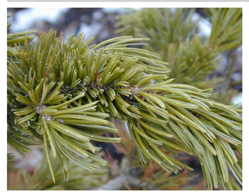
Pinus aristata - Leaves