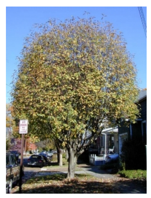
Sorbus thuringiaca tree