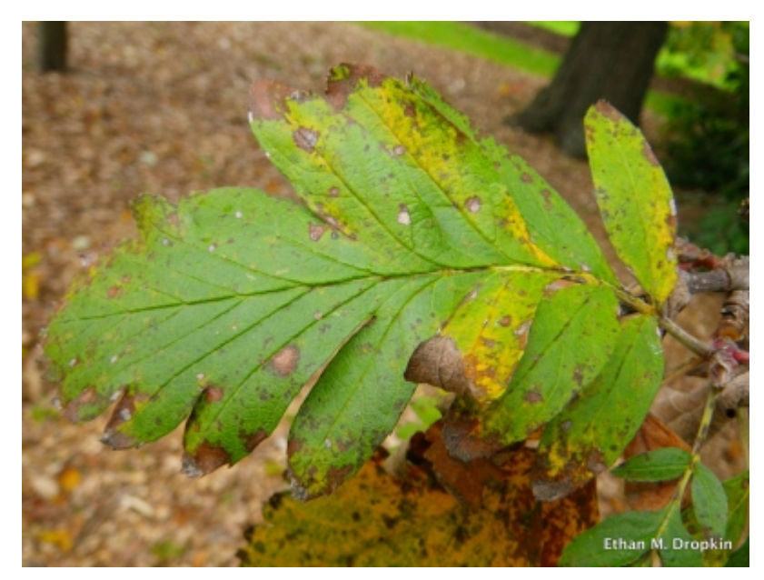
Sorbus x thuringiaca Foliage ED