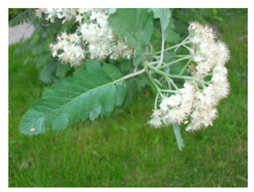
Oakleaf Mountain Ash close