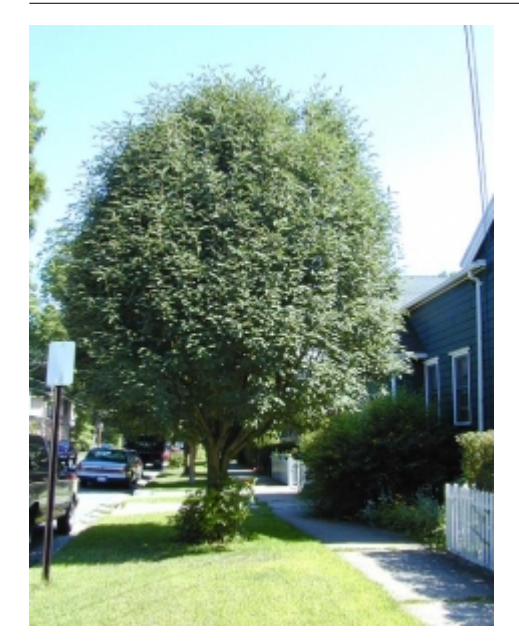
SOth B Farm