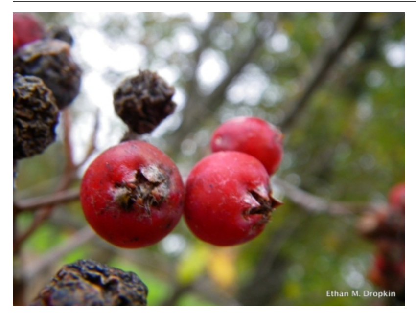
Sorbus x thuringiaca Fruit ED