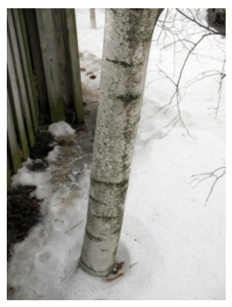
Betula populifolia - Bark