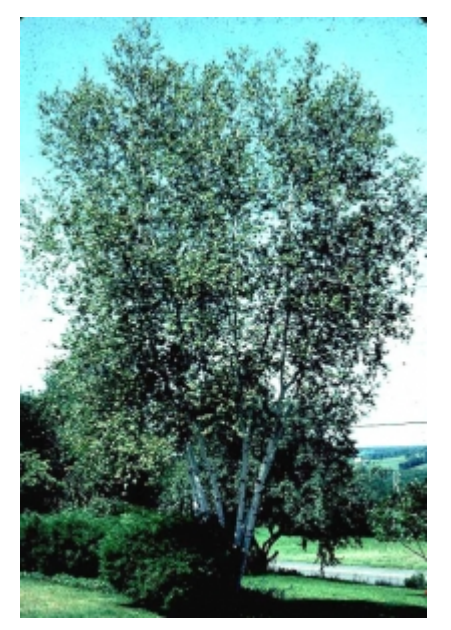
Betula populifolia - Habit