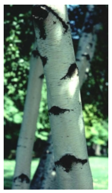
Betula populifolia - Bark