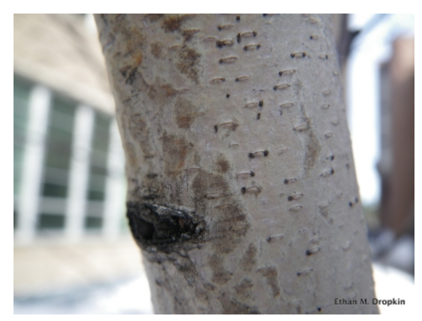
Betula populifolia - Bark