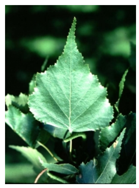
Betula populifolia - Leaf