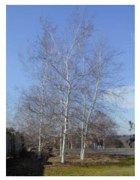
Betula populifolia - Habit