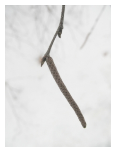
Betula populifolia - Catkin