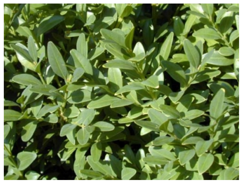
Buxus sempervirens - Leaves