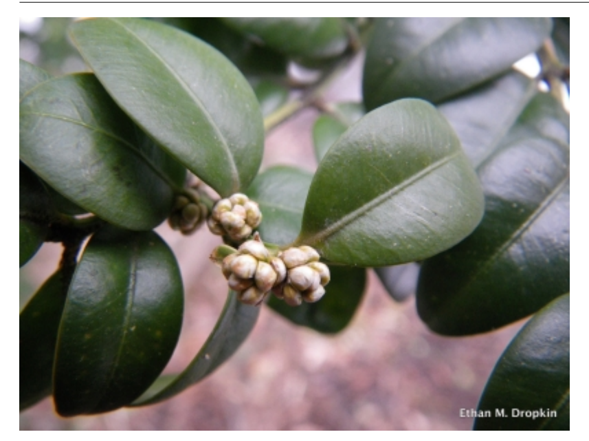
Buxus sempervirens - Buds