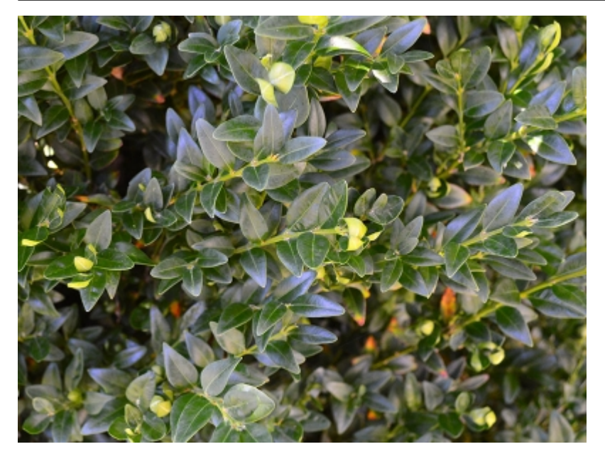
Buxus sempervirens - Leaves