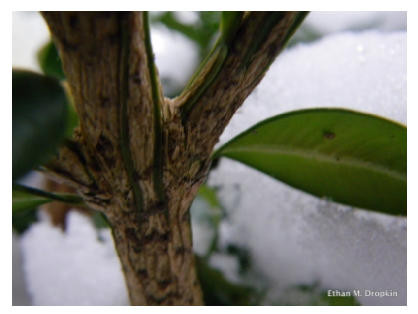
Buxus sempervirens - Bark