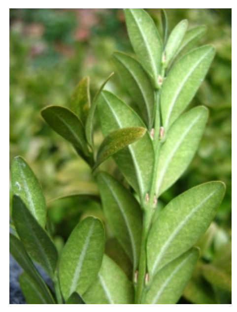
Buxus sempervirens - Leaves