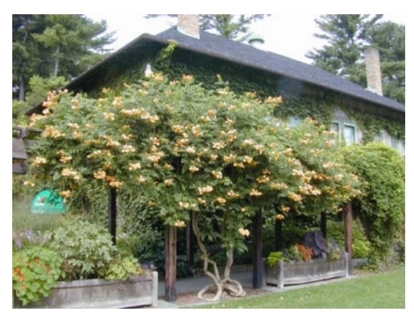
Campsis radicans - Habit, Flowers