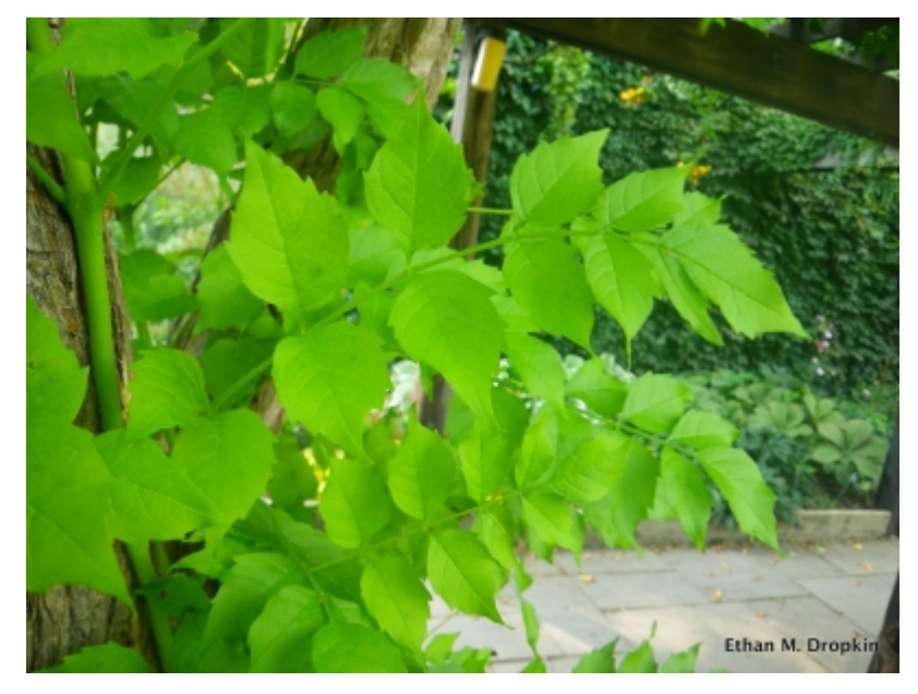
Campsis radicans - Leaves