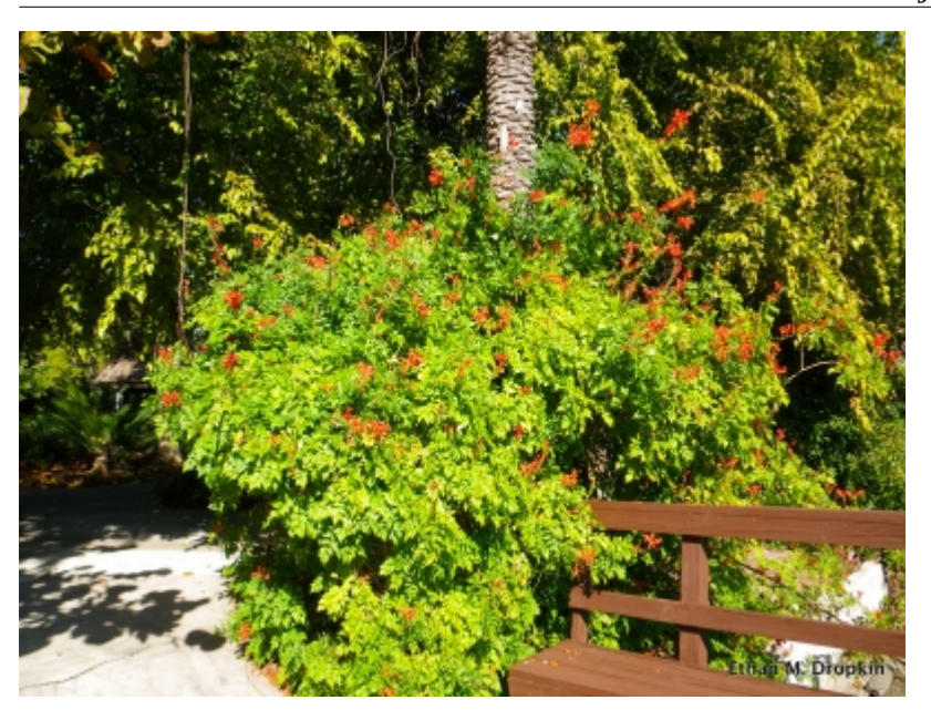
Campsis radicans - Habit