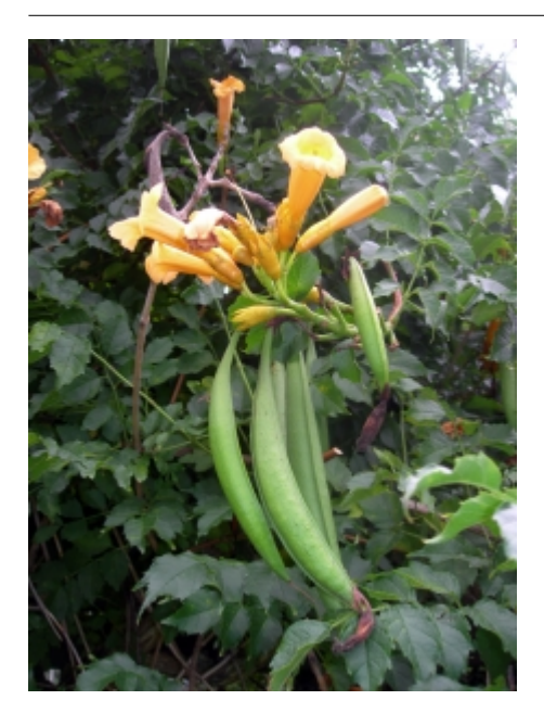
Campsis radicans - Flowers, Fruit