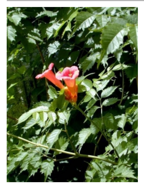
Campsis radicans - Flowers, Leaves