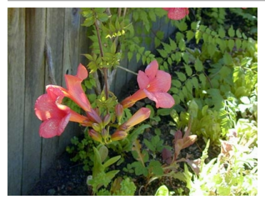
Campsis radicans - Flowers, Leaves