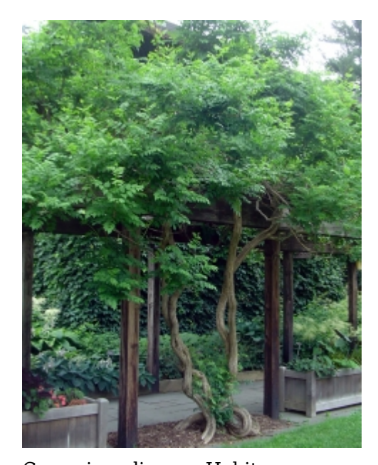
Campsis radicans - Habit