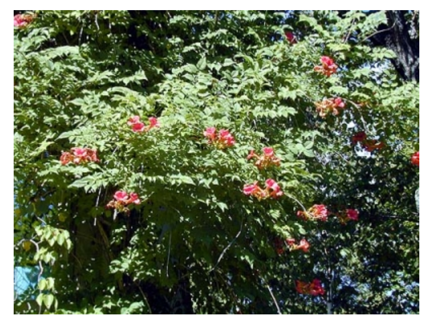
Campsis radicans - Habit, Flowers