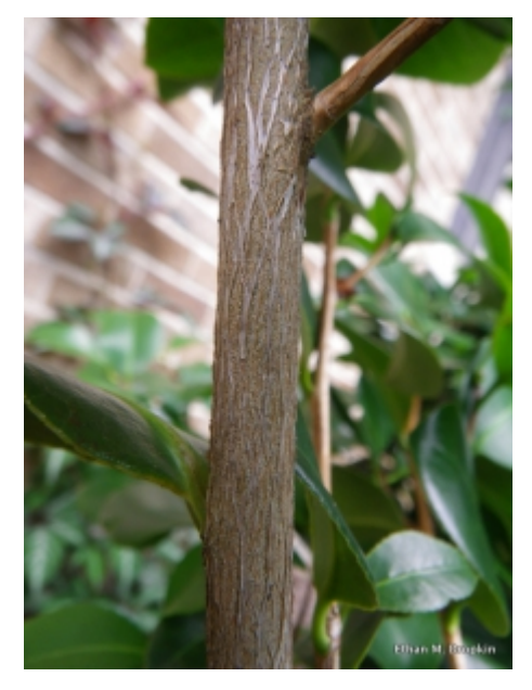
Camellia japonica - Bark