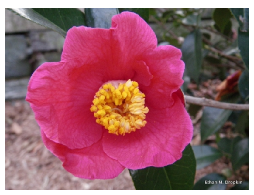
Camellia japonica - Flower