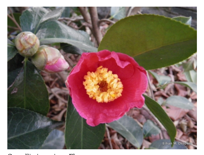
Camellia japonica - Flower