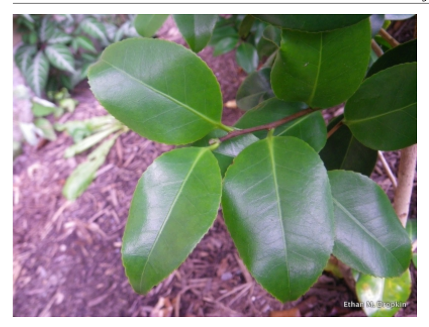
Camellia japonica - Leaves