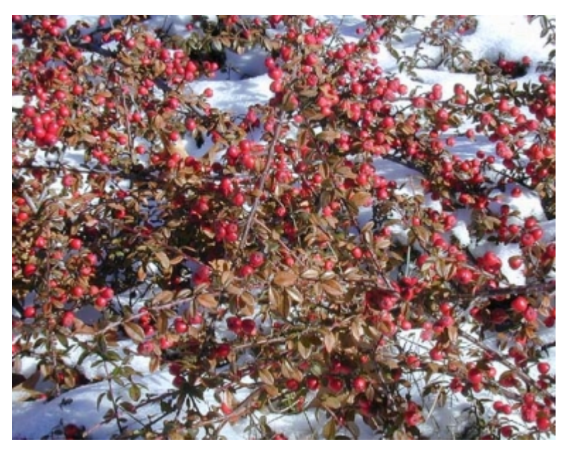
Cotoneaster horizontalis - Leaves, Fruit