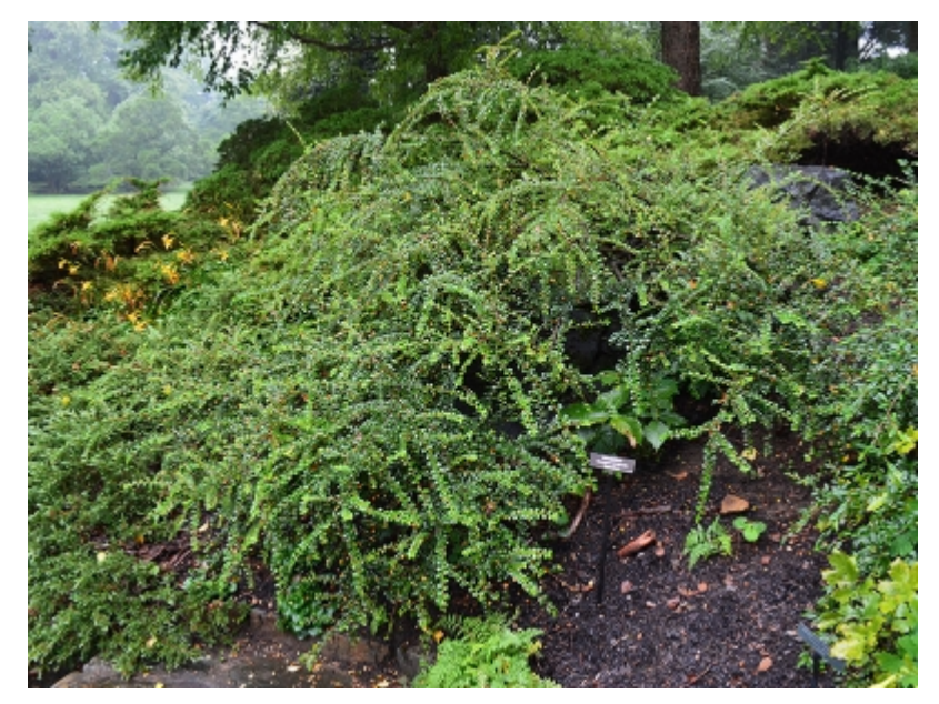
Cotoneaster horizontalis - Habit