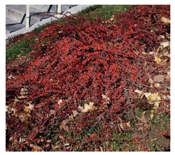
Cotoneaster horizontalis - Habit, Fruit