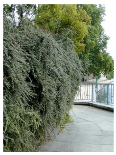
Cotoneaster horizontalis - Habit

Cotoneaster horizontalis - Fruit, Leaves