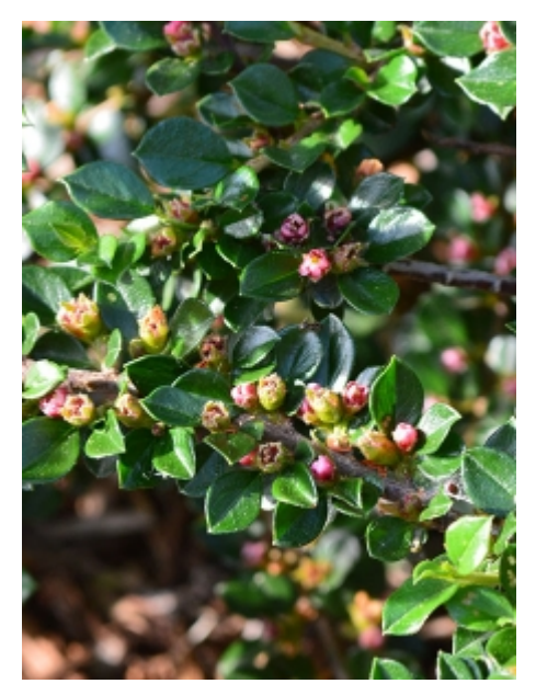
Cotoneaster horizontalis - Leaves, Flowers