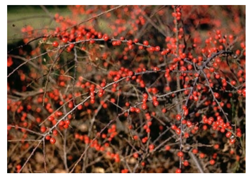
Cotoneaster horizontalis - Fruit