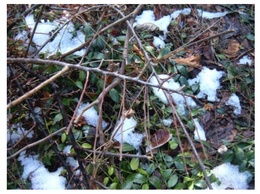
Cotoneaster horizontalis - Bark