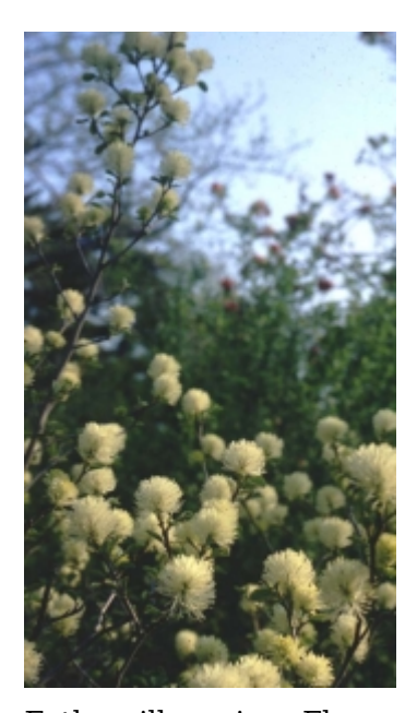
Fothergilla major - Flowers