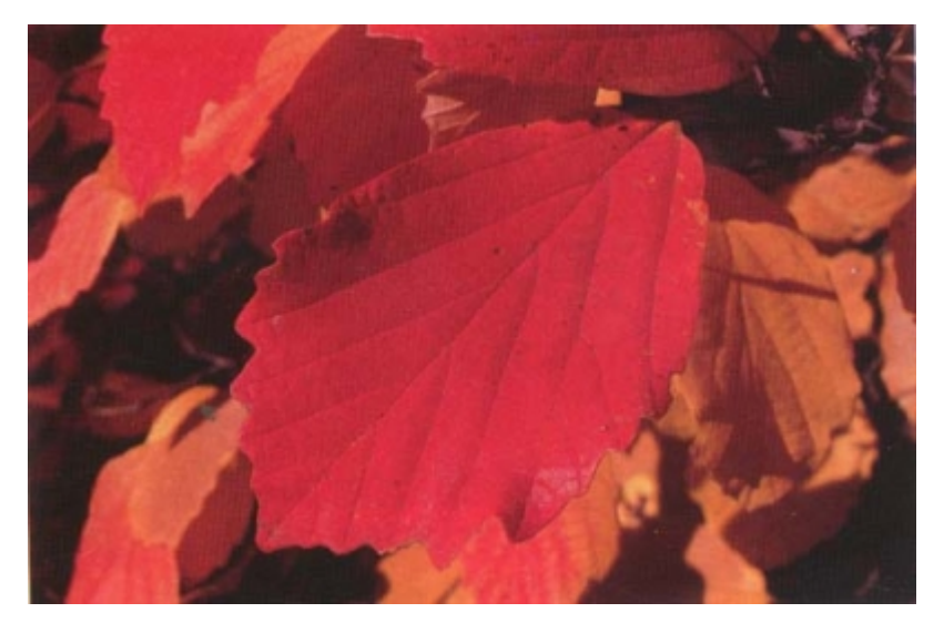
Fothergilla major - Leaf, Fall Interest