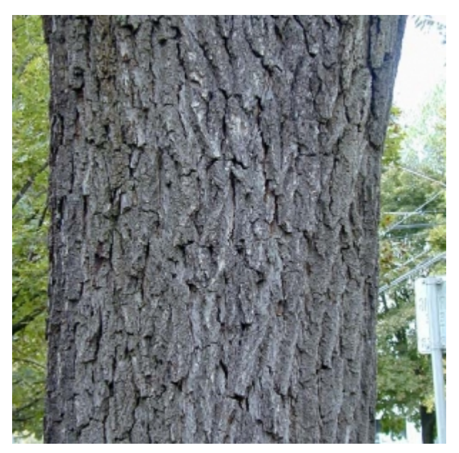
Juglans nigra - Bark