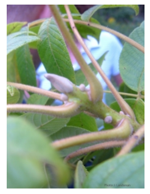
Juglans nigra - Bud