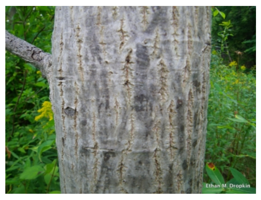
Juglans nigra - Bark