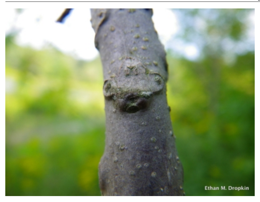
Juglans nigra - Leaf Scar