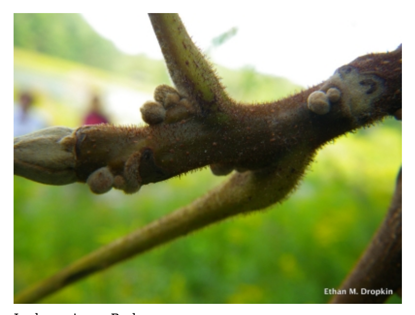
Juglans nigra - Buds