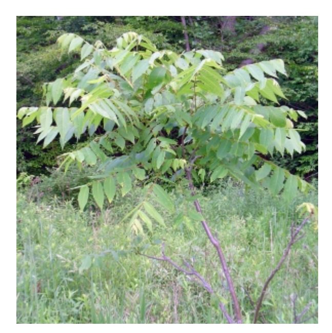
Juglans nigra - Habit