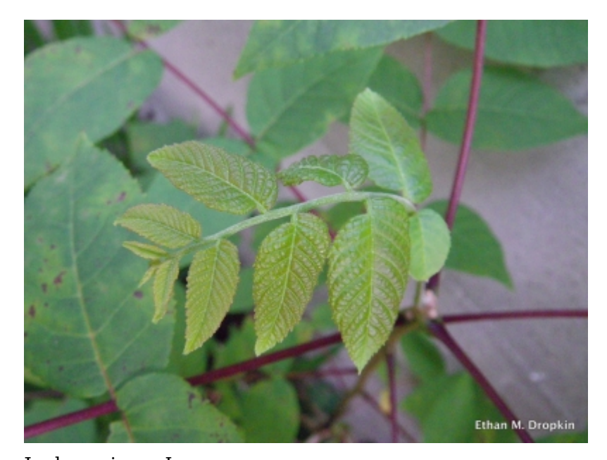
Juglans nigra - Leaves