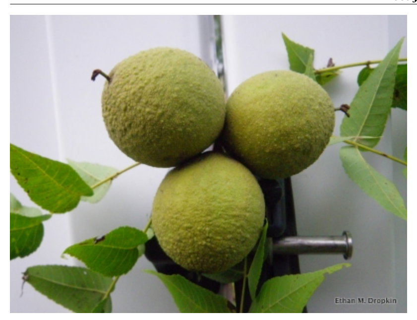
Juglans nigra - Fruit