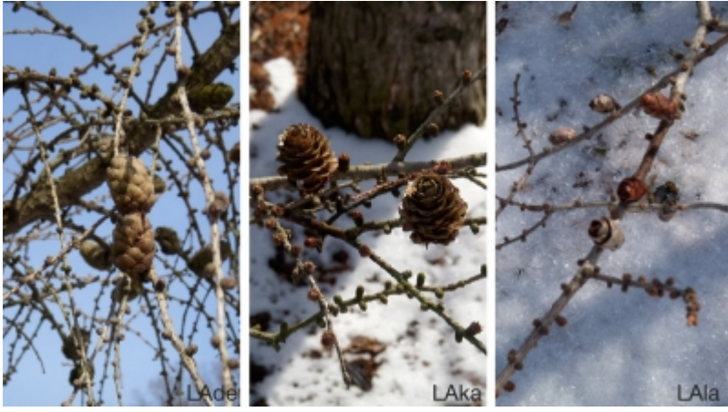
Larix laricina - Cones