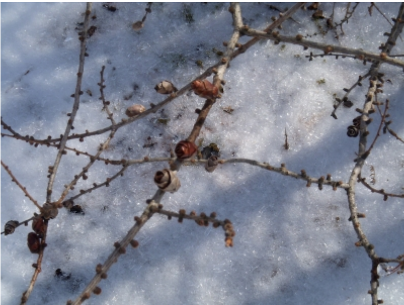
Larix laricina - Cones