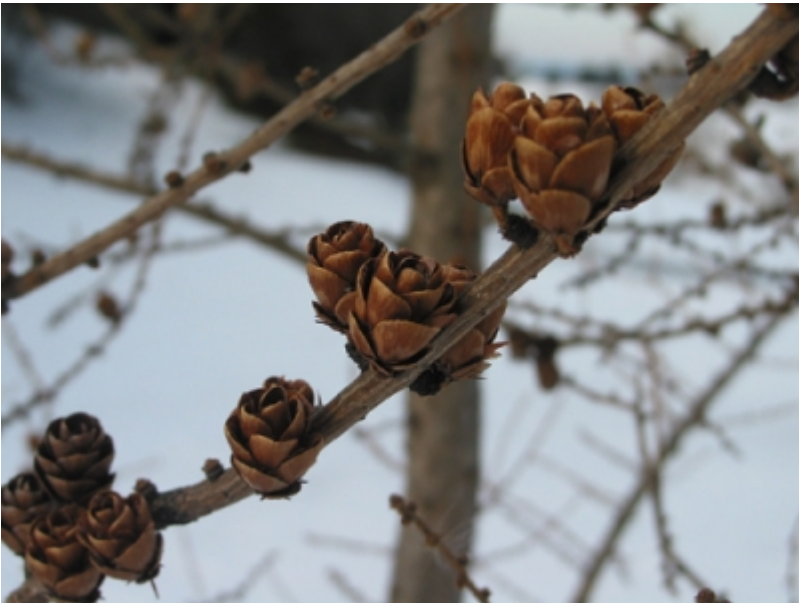
Larix laricina - Cones