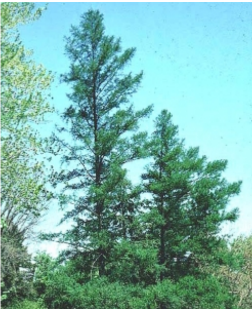
Larix laricina - Habit