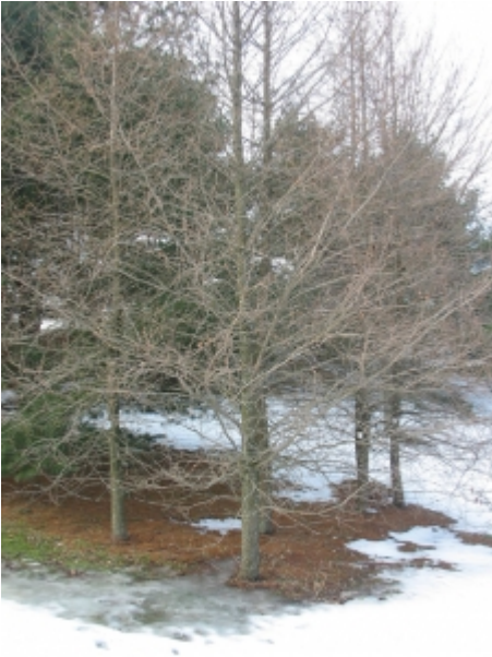
Larix laricina - Habit