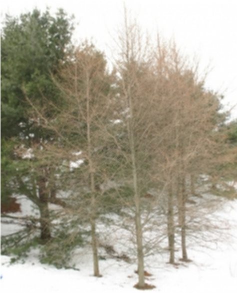
Larix laricina - Habit