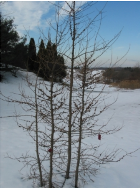
Larix laricina - Habit