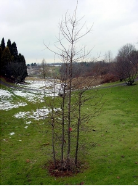
Larix laricina - Habit