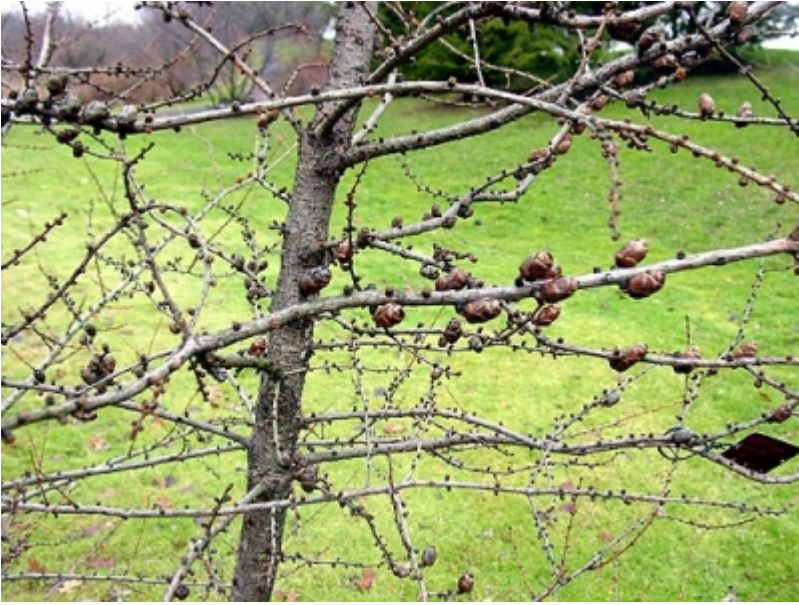
Larix laricina - Cones