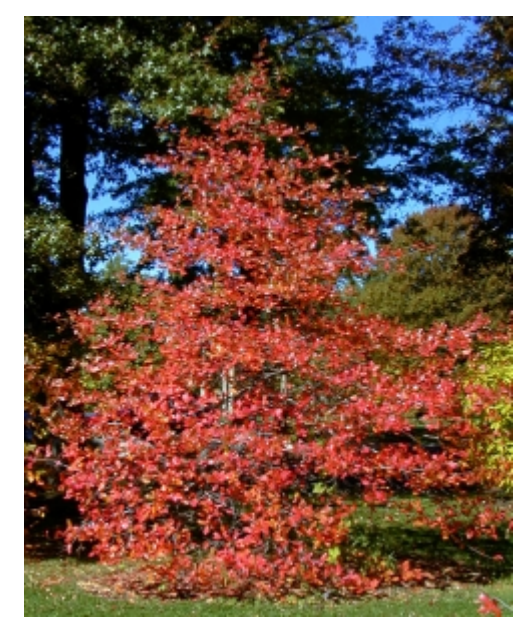
Nyssa sylvatica - Habit, Fall Interest