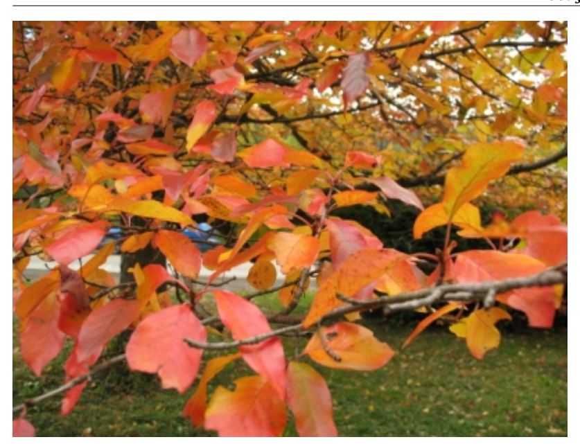
Nyssa sylvatica - Leaves, Fall Interest