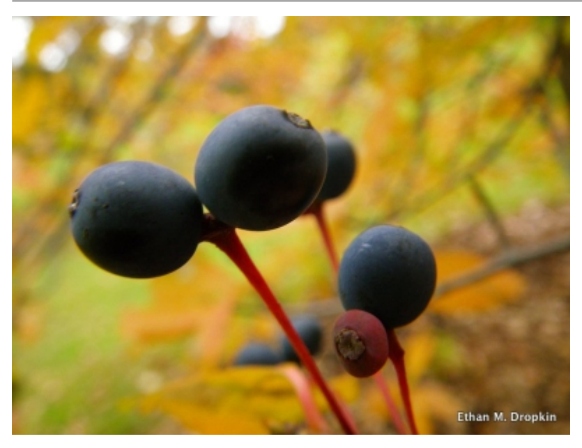
Nyssa sylvatica - Fruit