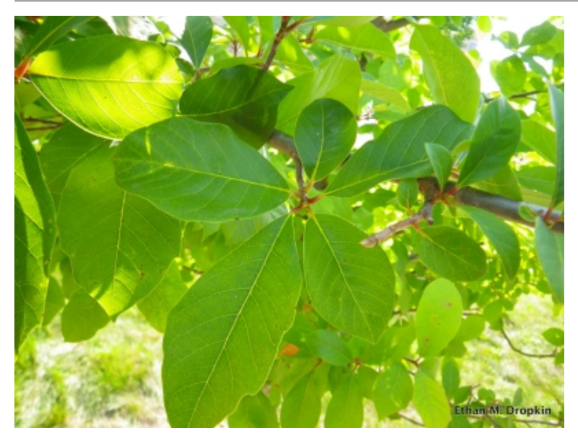
Nyssa sylvatica - Leaves