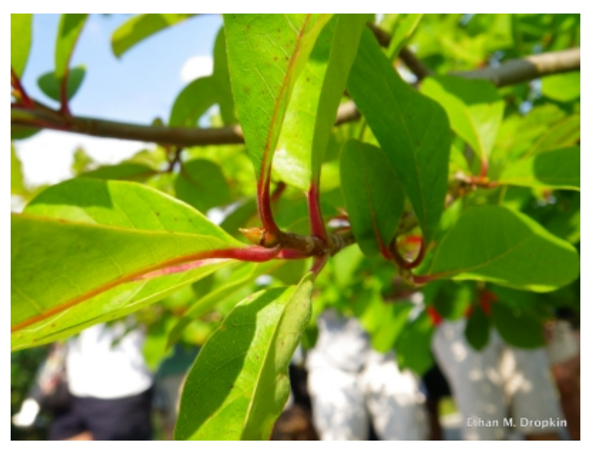
Nyssa sylvatica - Leaves, Petioles