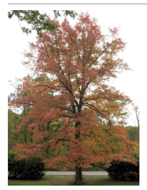
Nyssa sylvatica - Habit, Fall Interest