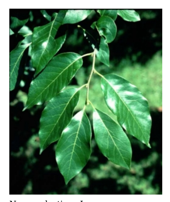
Nyssa sylvatica - Leaves