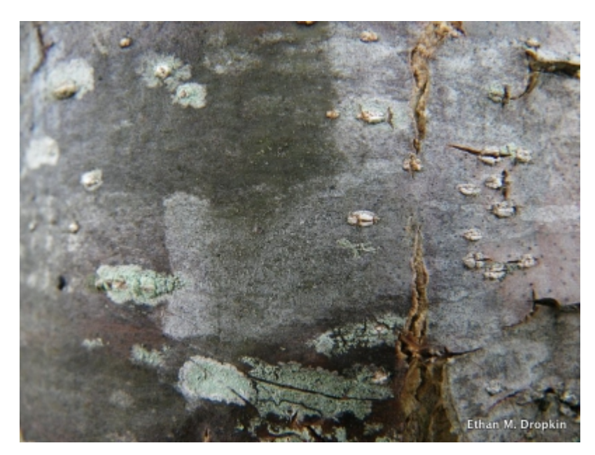
Nyssa sylvatica - Bark