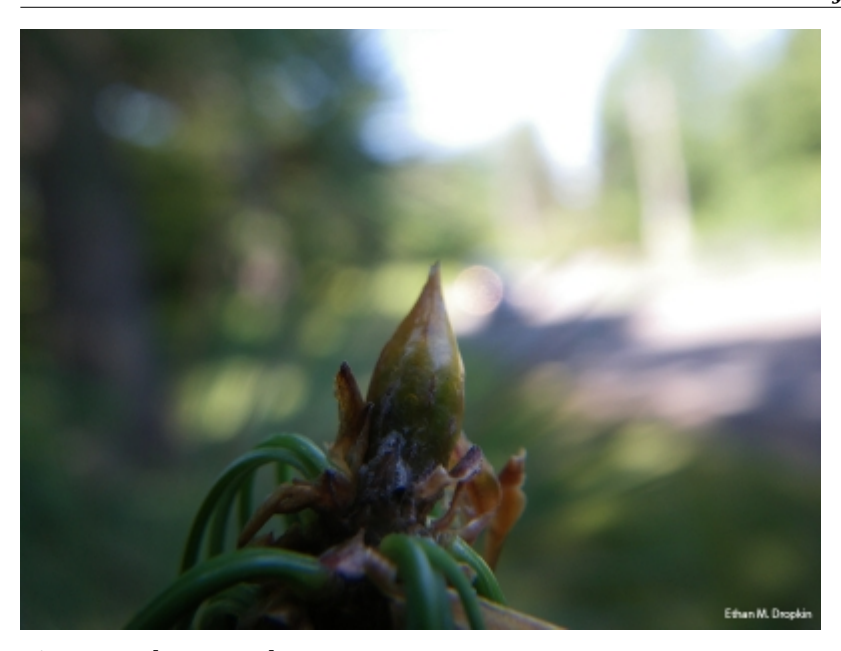
Pinus strobus - Bud