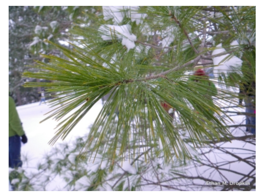
Pinus strobus - Leaves