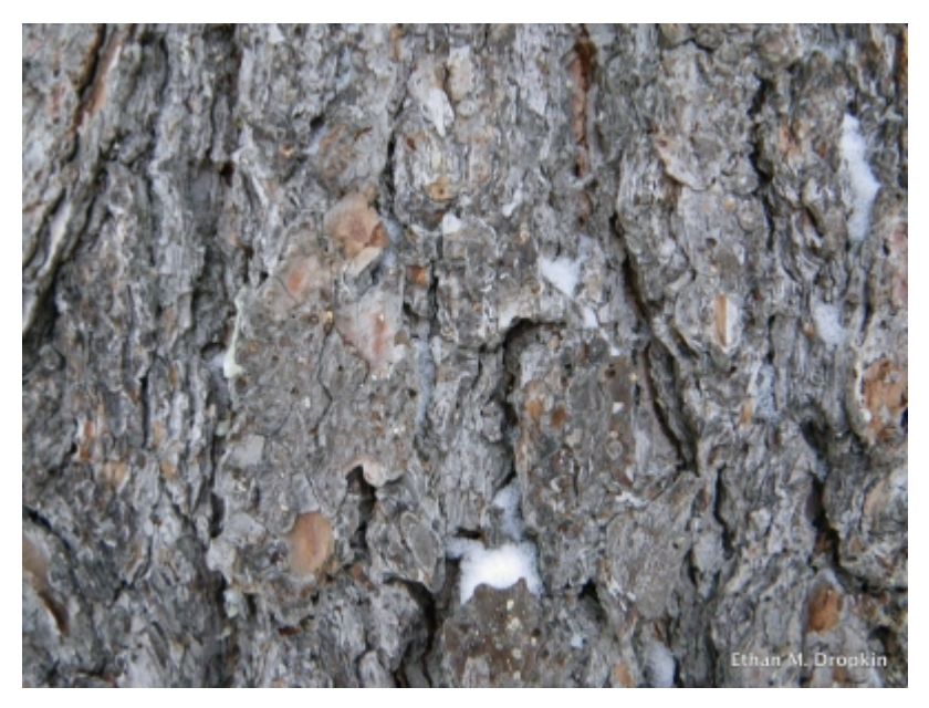
Pinus strobus - Bark