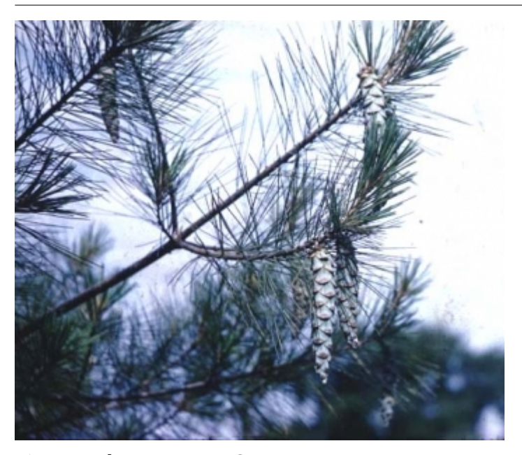
Pinus strobus - Leaves, Cones