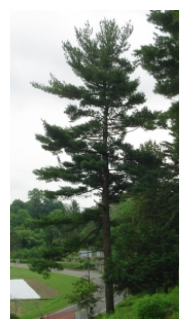
Pinus strobus - Habit