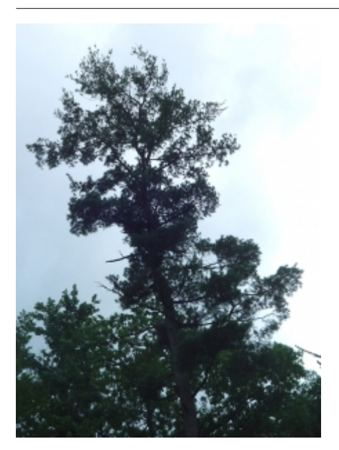
Pinus strobus - Habit