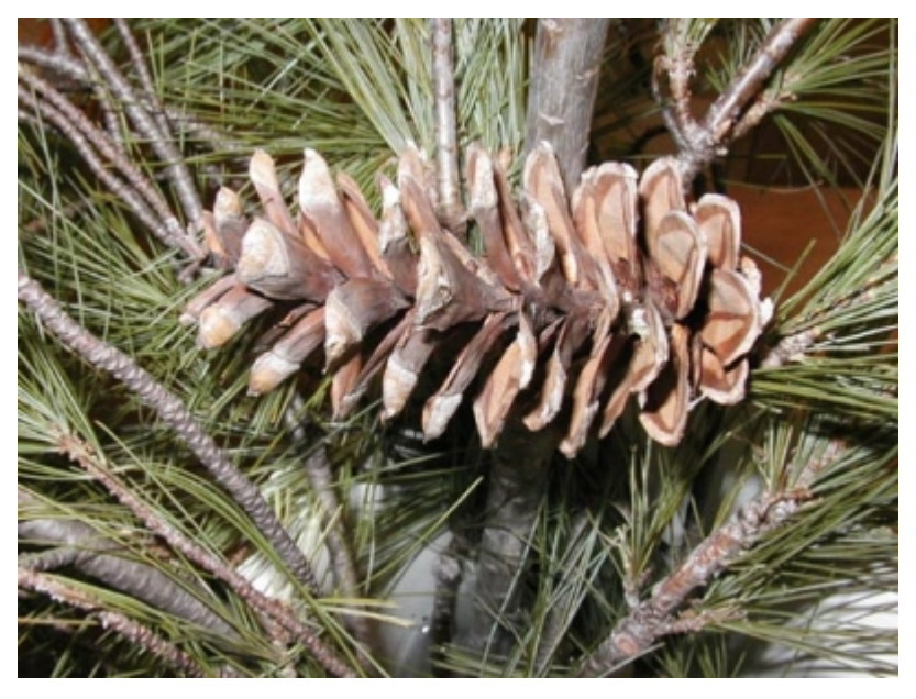
Pinus strobus - Cone