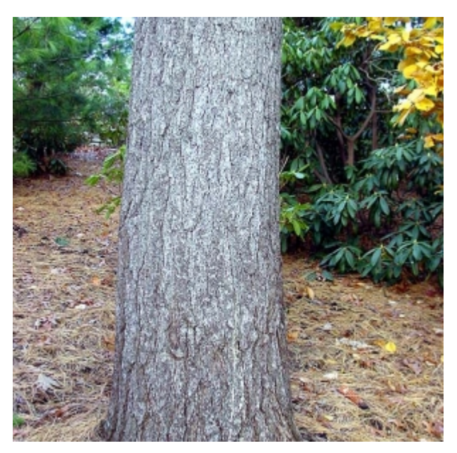
Pinus strobus - Bark