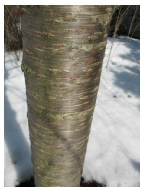
Prunus subhirtella - Bark