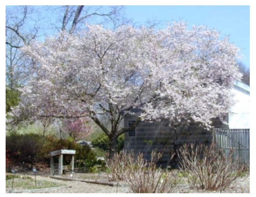
Prunus subhirtella - Habit, Flowers