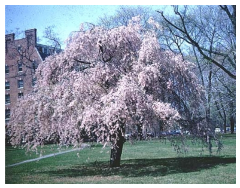
Prunus subhirtella - Habit, Flowers