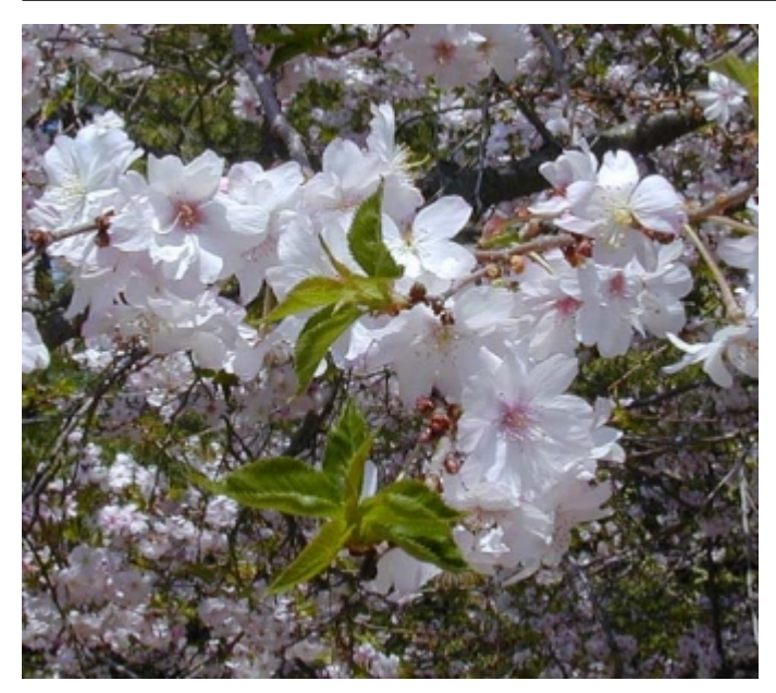
Prunus subhirtella - Flowers