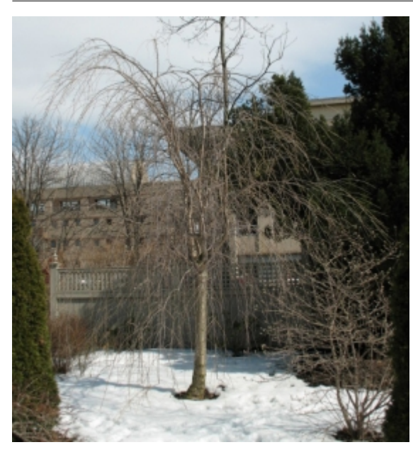
Prunus subhirtella - Habit