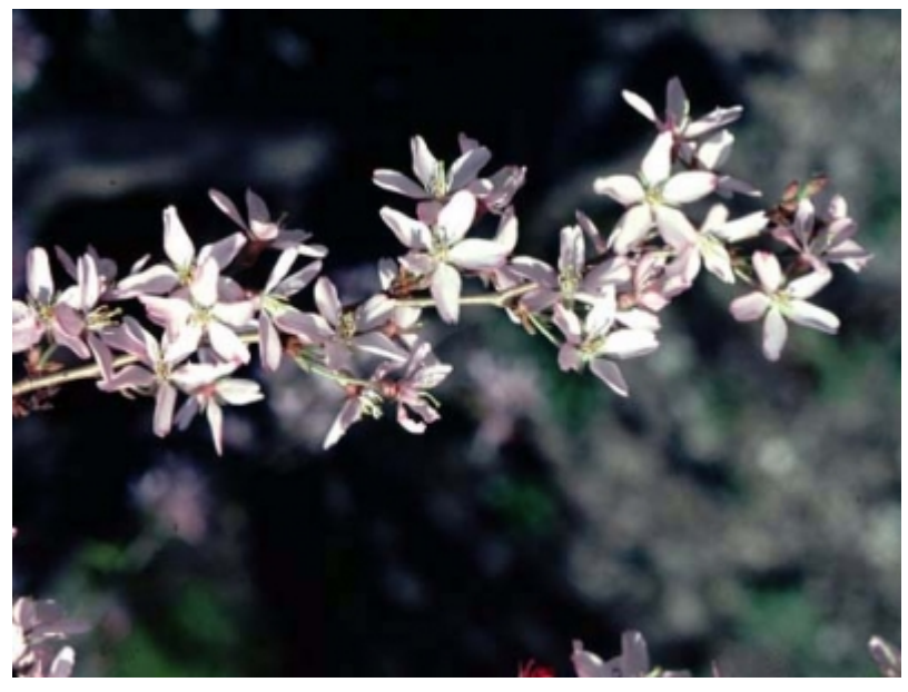
Prunus subhirtella - Flowers