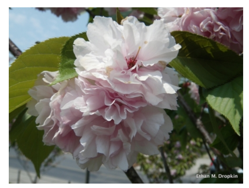
Prunus subhirtella - Flowers