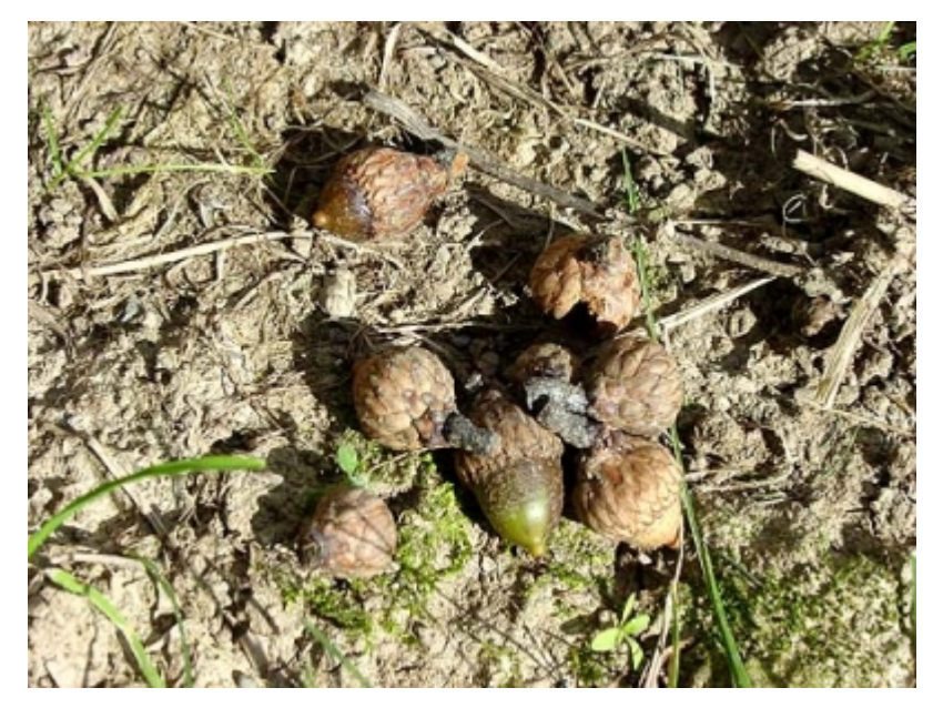
Quercus velutina - Acorns