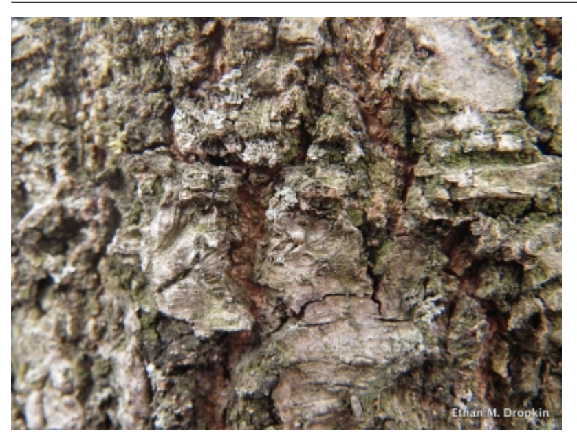
Quercus velutina - Bark