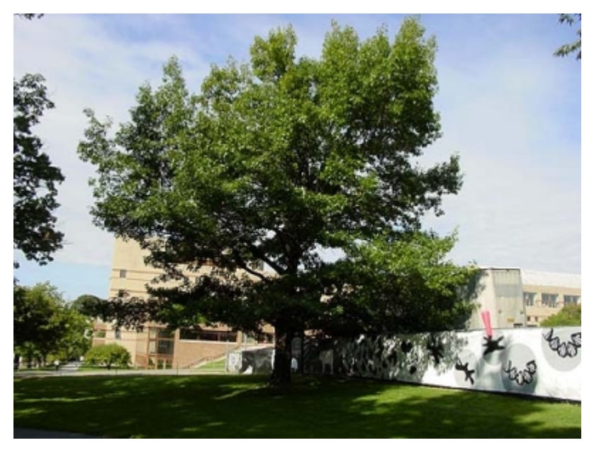
Quercus velutina - Habit