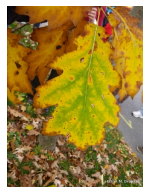
Quercus velutina - Leaves, Fall Interest