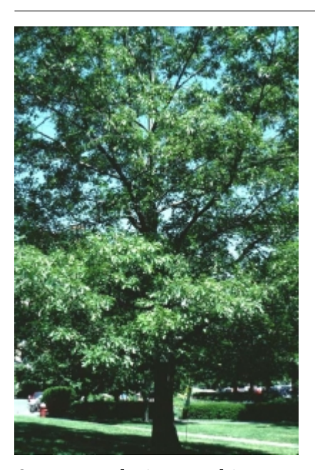
Quercus velutina - Habit