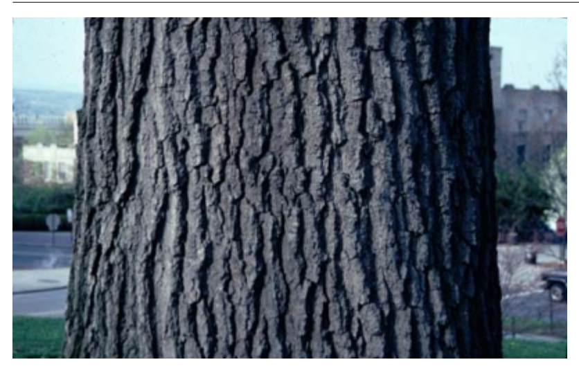
Quercus velutina - Bark