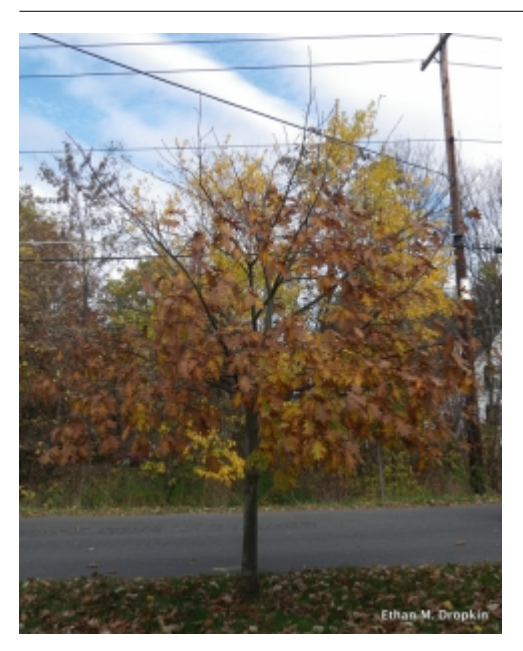
Quercus velutina - Habit, Fall Interest