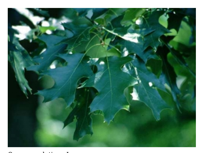
Quercus velutina - Leaves