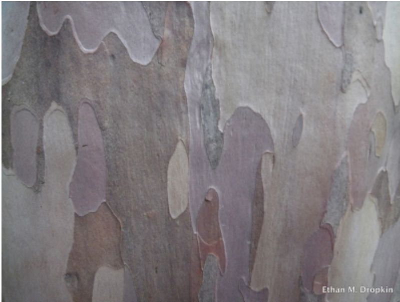
Stewartia pseudocamellia - Bark