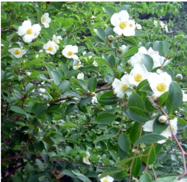
Stewartia pseudocamellia - Habit, Flowers