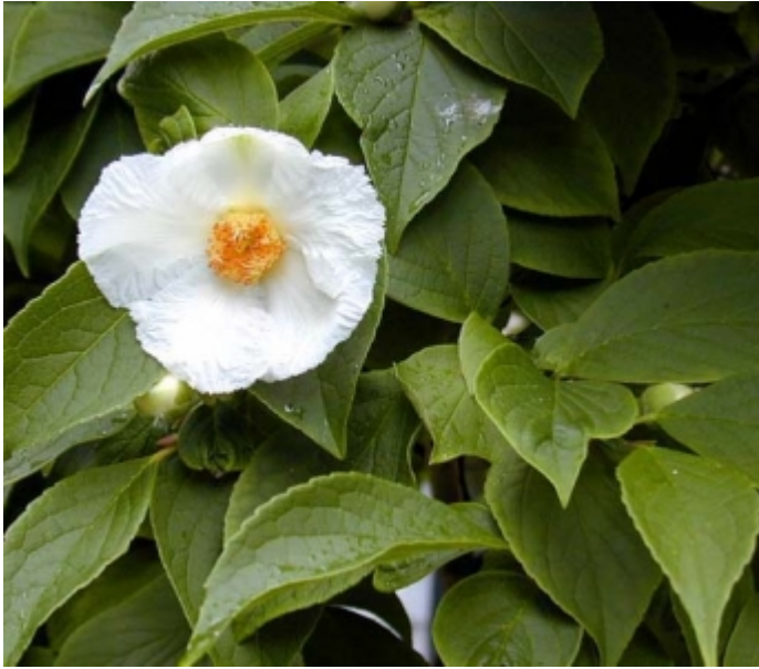
Stewartia pseudocamellia - Leaves, Flower