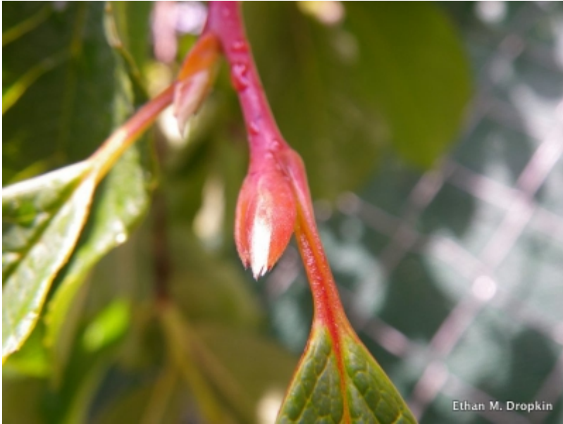
Stewartia pseudocamellia - Bud