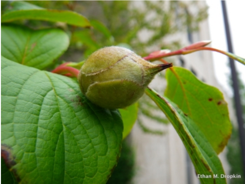
Stewartia pseudocamellia - Immature Fruit