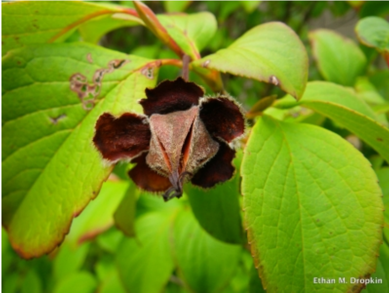
Stewartia pseudocamellia - Fruit