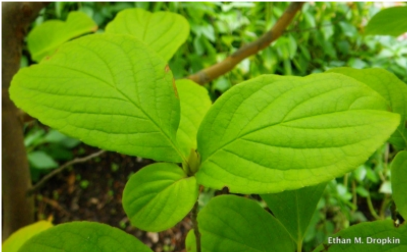
Stewartia pseudocamellia - Leaves