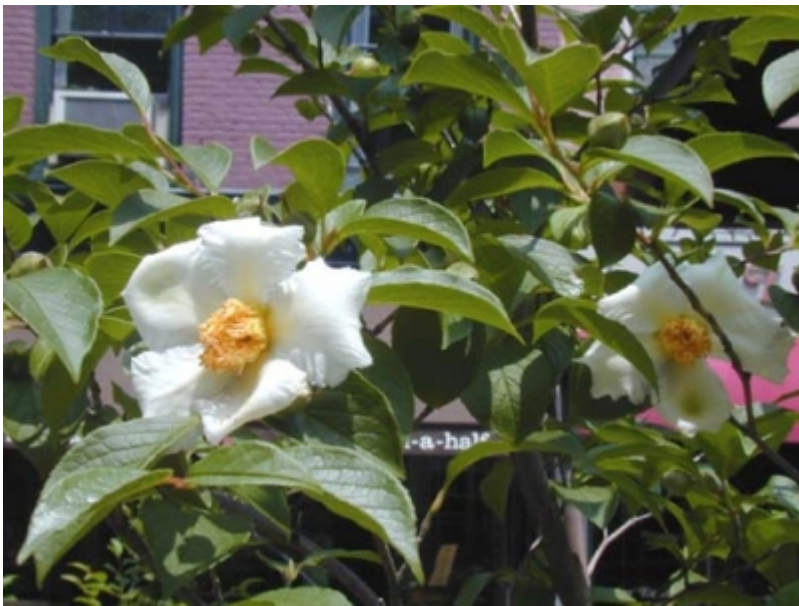
Stewartia pseudocamellia - Leaves, Flower