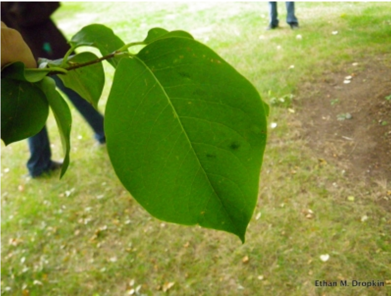
Syringa reticulata - Leaf