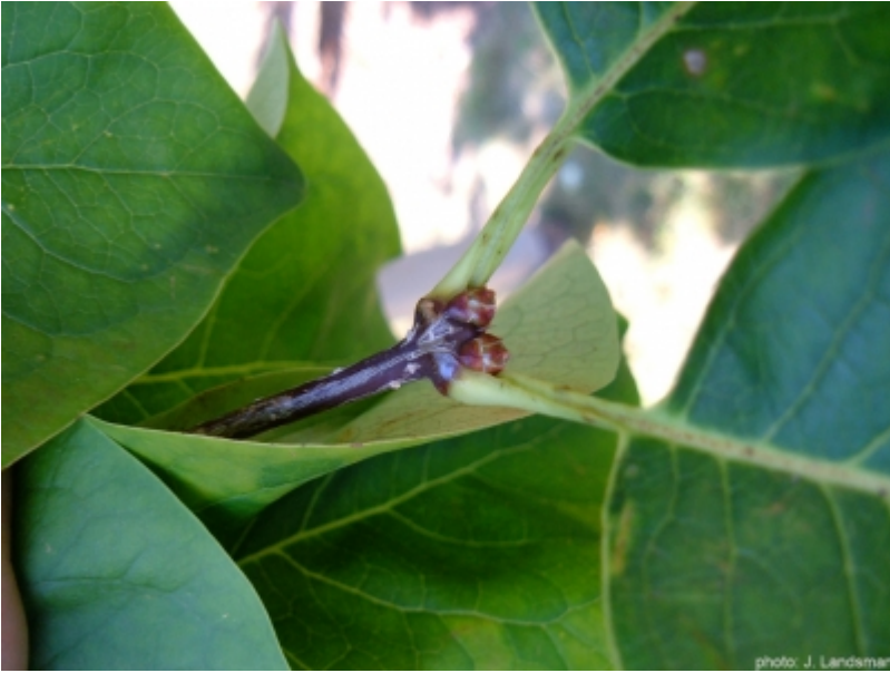
Syringa reticulata - Buds