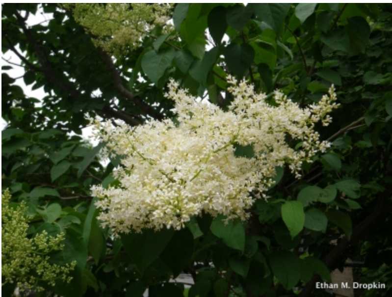
Syringa reticulata - Flowers