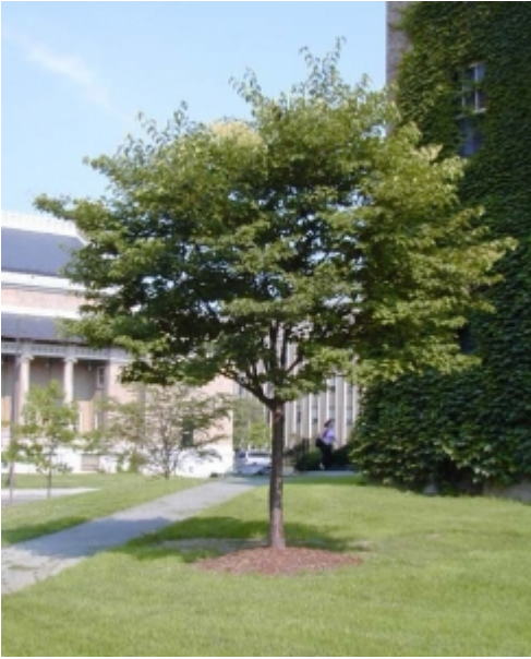
Syringa reticulata - Habit