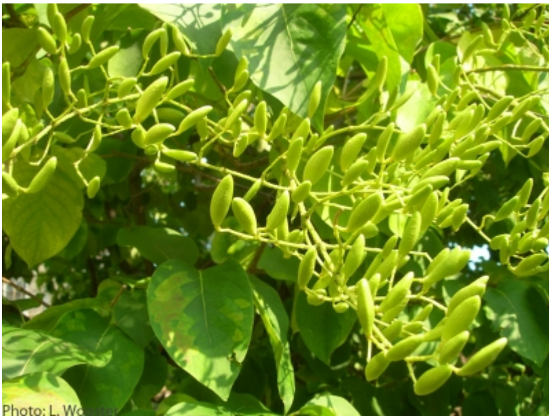
Syringa reticulata - Fruit