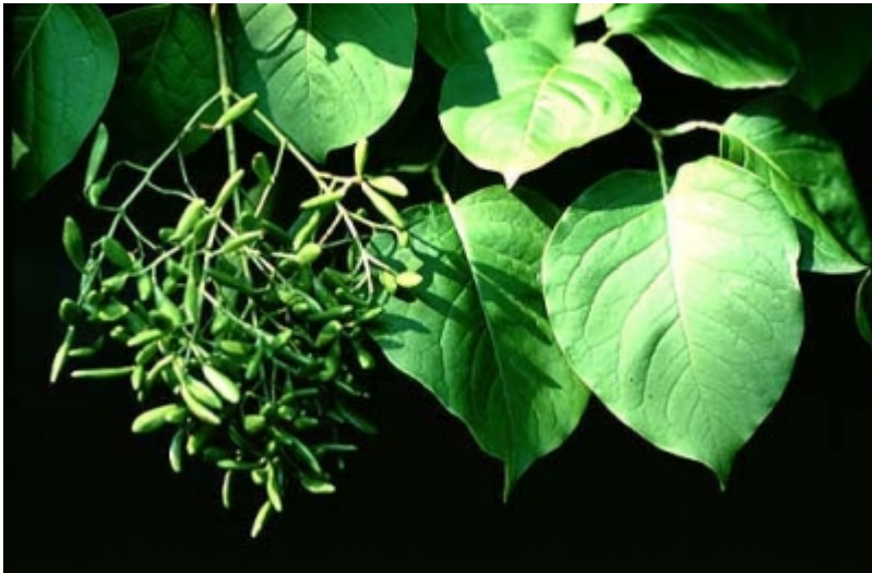
Syringa reticulata - Leaves, Fruit