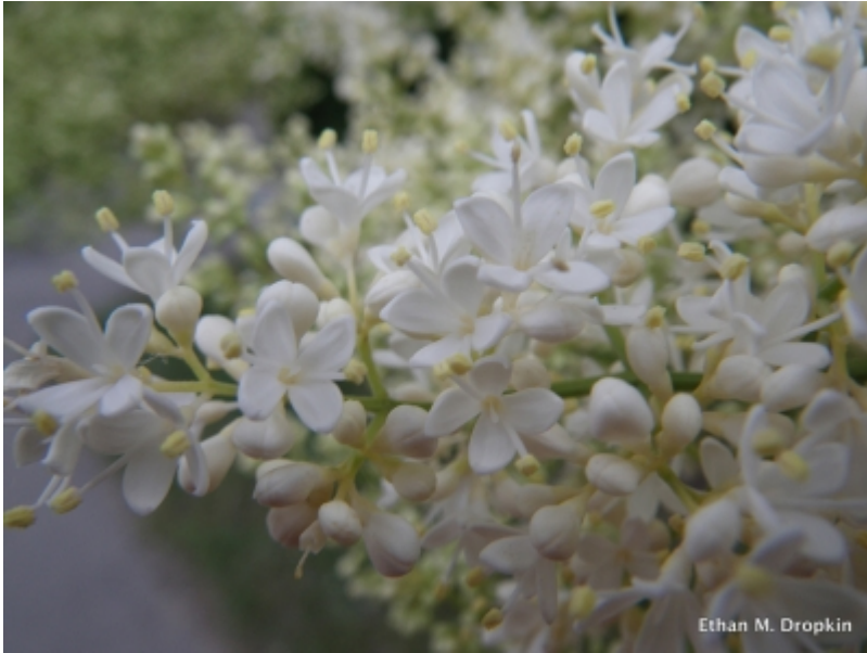
Syringa reticulata - Flowers