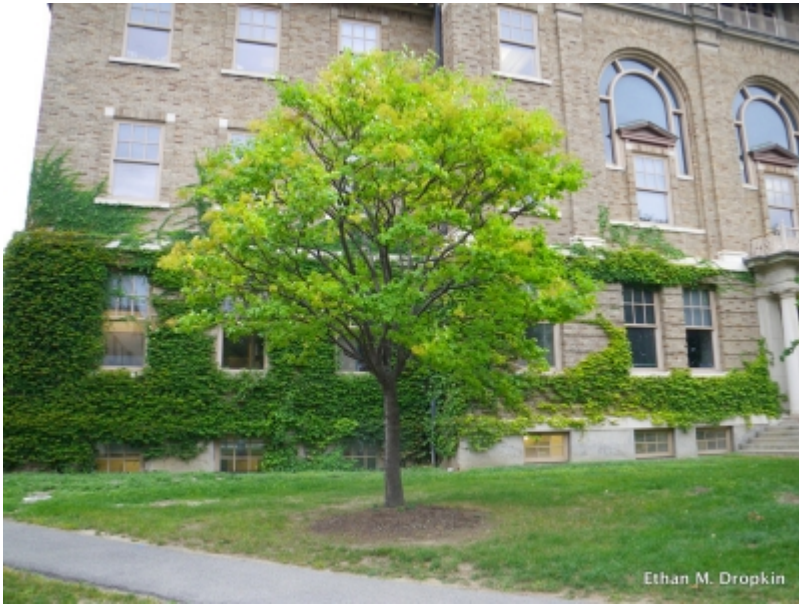
Syringa reticulata - Habit