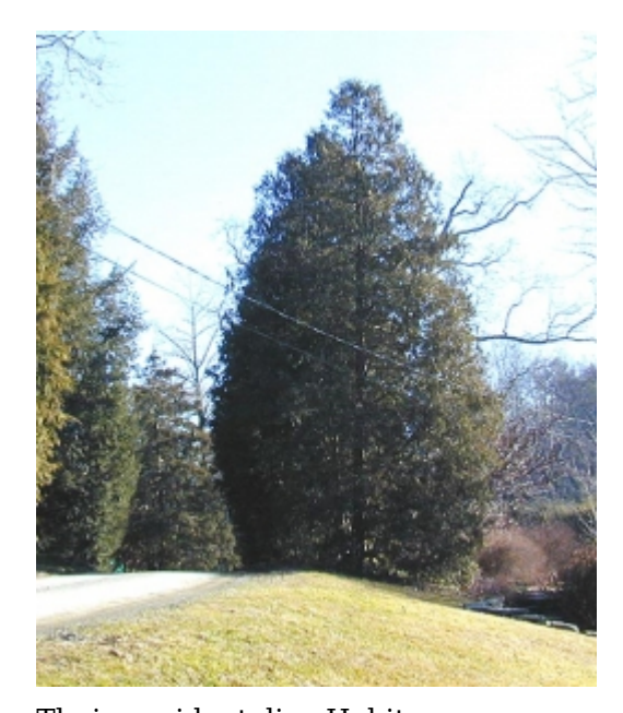
Thuja occidentalis - Habit