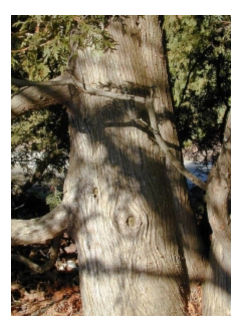
Thuja occidentalis - Bark