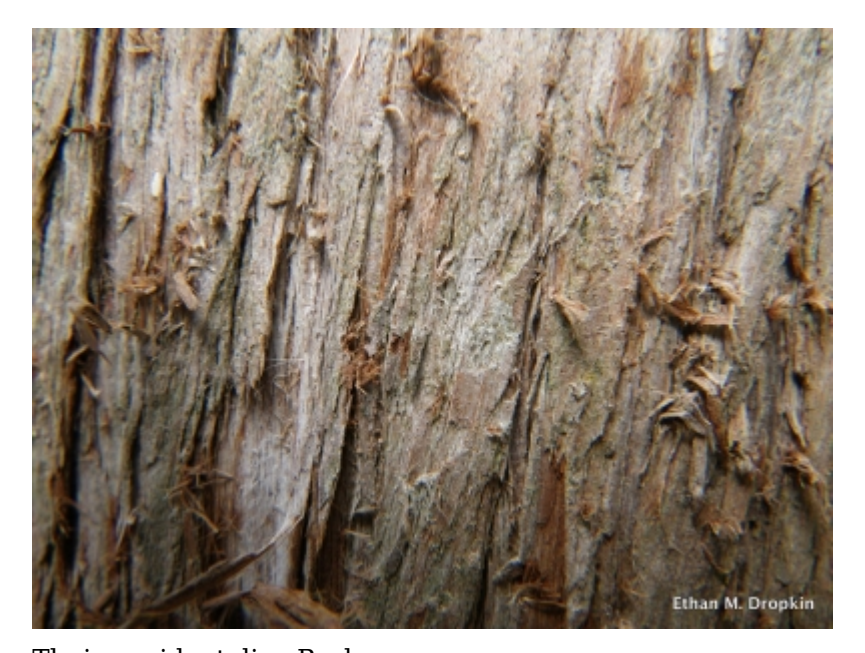
Thuja occidentalis - Bark