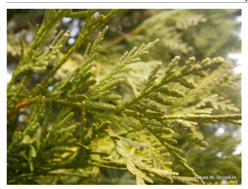
Thuja occidentalis - Leaves