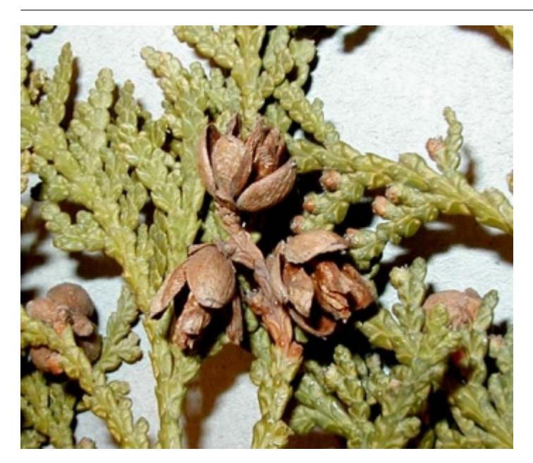
Thuja occidentalis - Cones