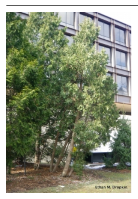
Thuja occidentalis - Habit