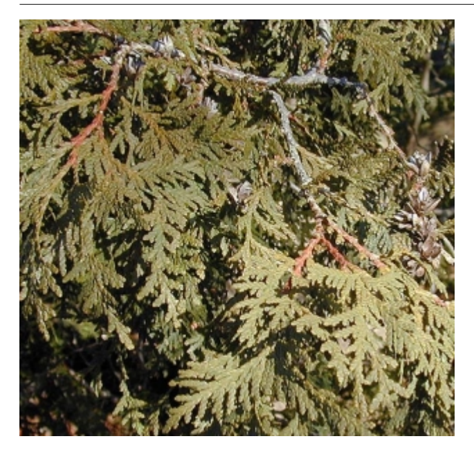
Thuja occidentalis - Leaves