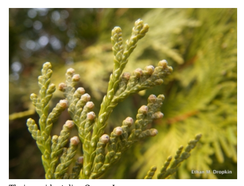
Thuja occidentalis - Cones, Leaves