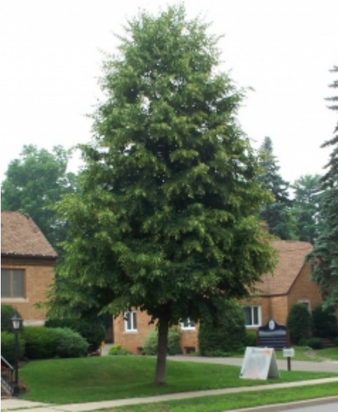
Tilia cordata 'Glenleven' - Habit