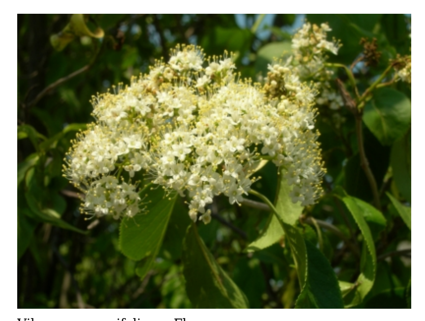
Viburnum\ prunifolium\ -\ Flowers