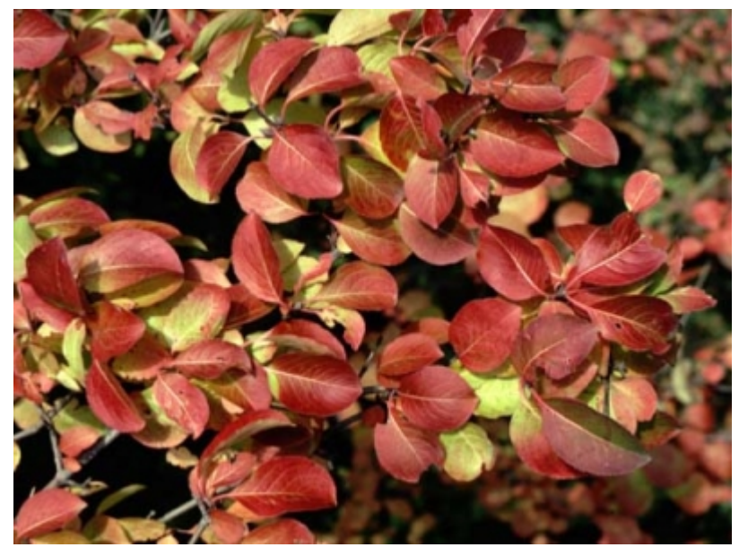
Viburnum prunifolium - Leaves, Fall Interest