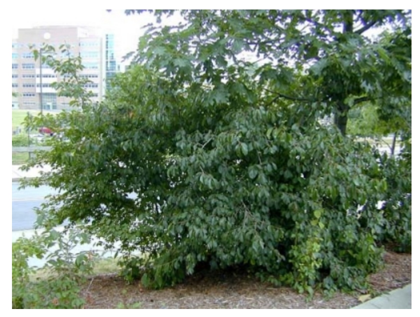
Viburnum prunifolium - Habit