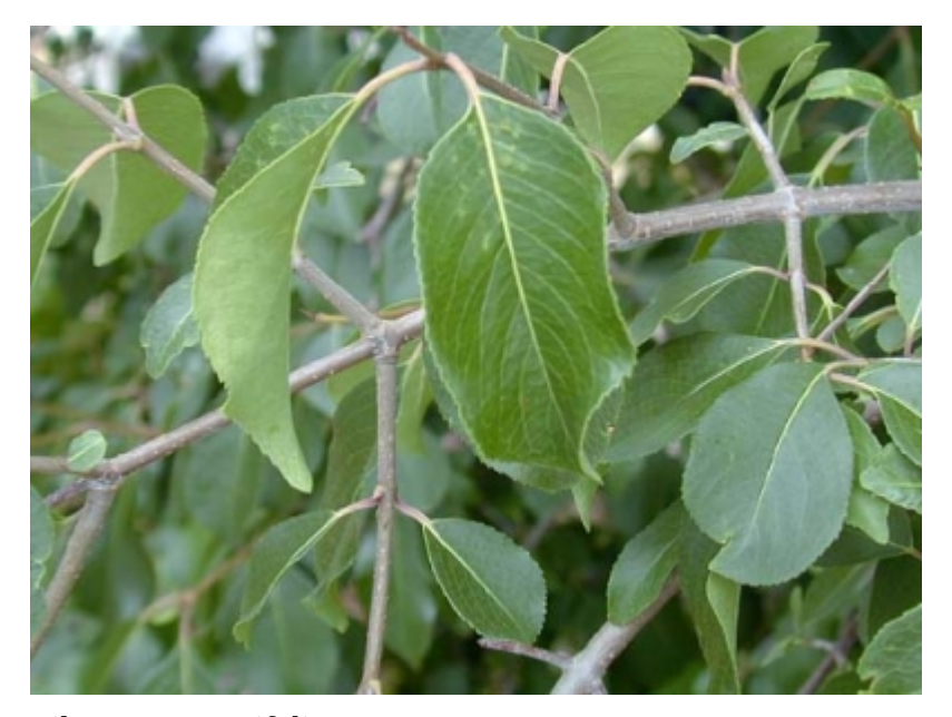
Viburnum prunifolium - Leaves