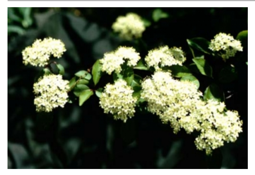
Viburnum\ prunifolium\ -\ Flowers