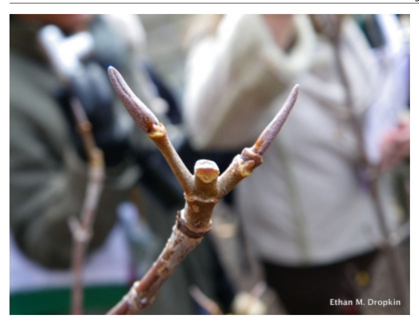
Viburnum\ prunifolium\ -\ Buds