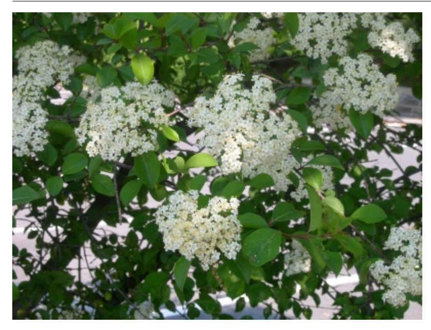
Viburnum\ prunifolium\ -\ Flowers