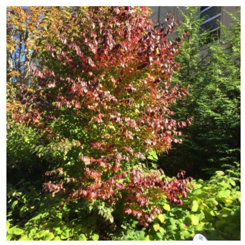
Viburnum prunifolium, habit, fall interest