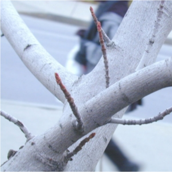
Acer x freemanii - Buds