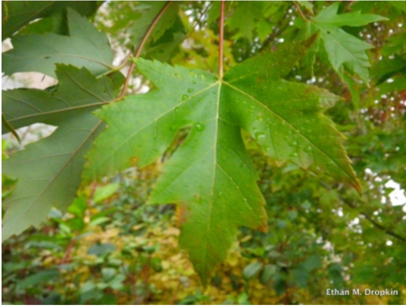
Acer x freemanii - Leaf