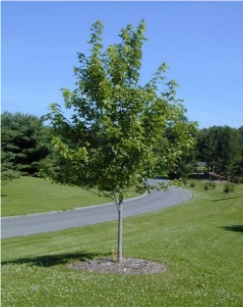
Acer x freemanii - Habit