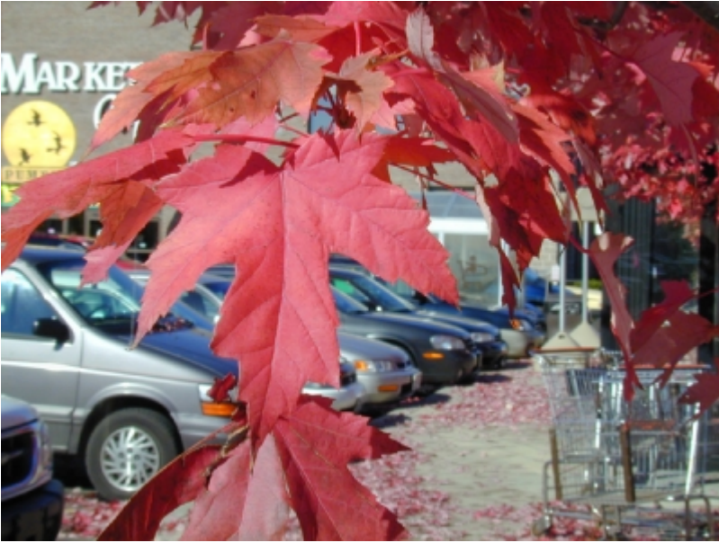
Acer x freemanii - Leaves, Fall Interest