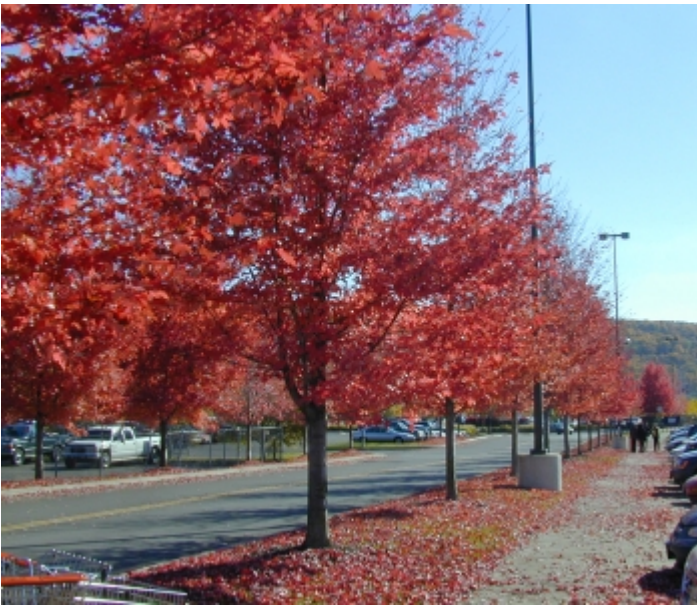
Acer x freemanii - Habit, Fall Interest