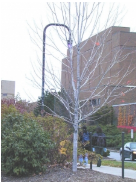
Acer x freemanii - Habit