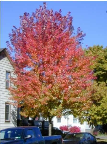
Acer x freemanii - Habit, Fall Interest