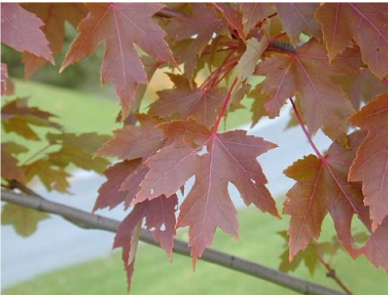
Acer x freemanii - Leaves, Fall Interest