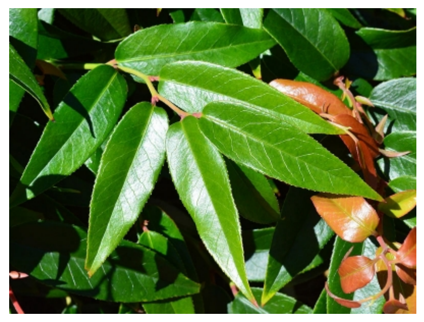
Leucothoe fontanesiana - Leaves