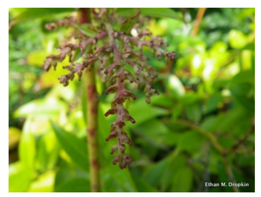
Leucothoe fontanesiana - Fruit