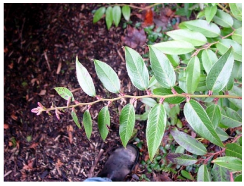
Leucothoe fontanesiana - Leaves