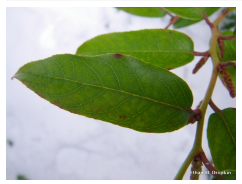
Leucothoe fontanesiana - Leaves