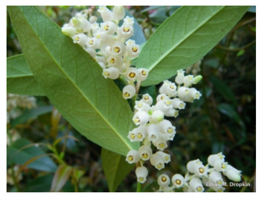
Leucothoe fontanesiana - Flowers