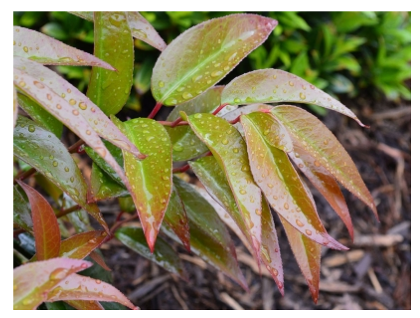
Leucothoe fontanesiana - Leaves