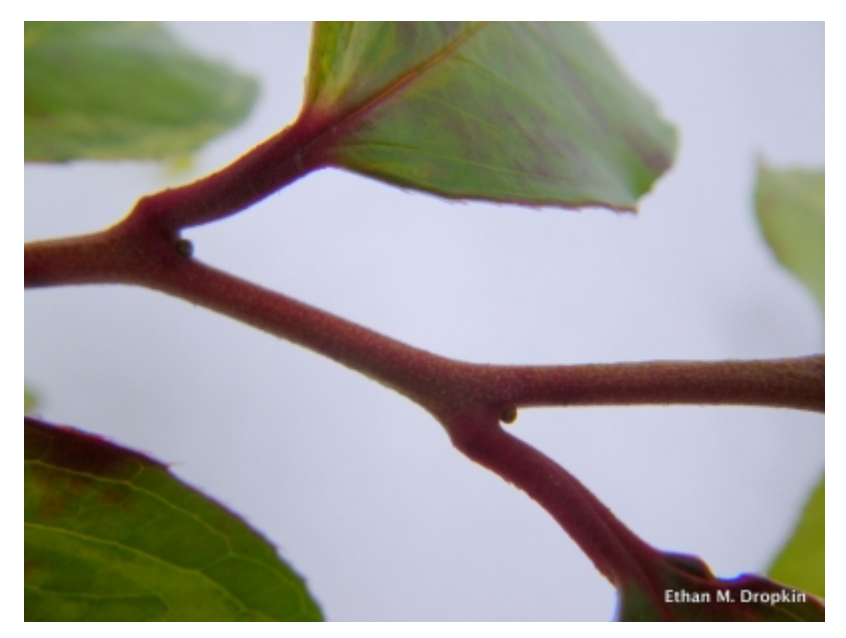
Leucothoe fontanesiana - Bark