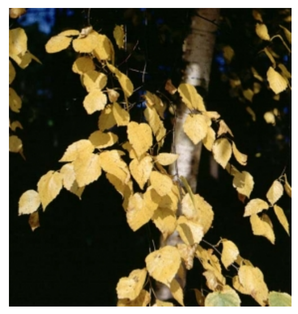
Betula papyrifera - Leaves, Fall Interest