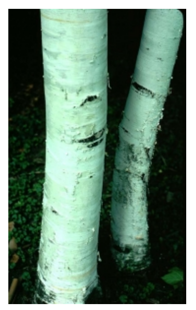
Betula papyrifera - Bark