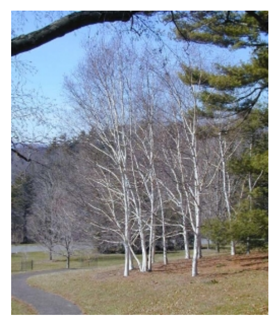
Betula papyrifera - Habit