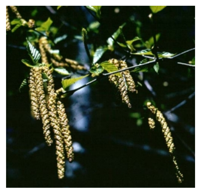
Betula papyrifera - Catkins