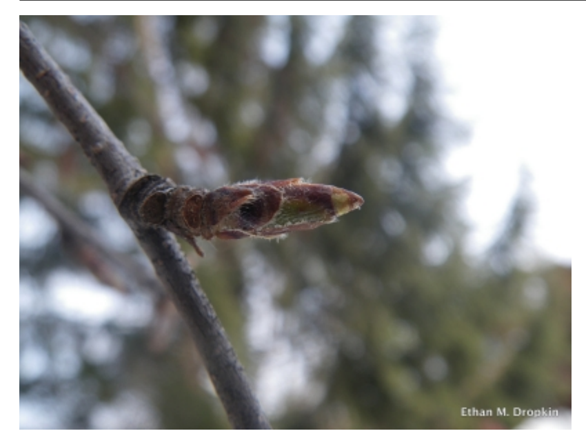
Betula papyrifera - Bud