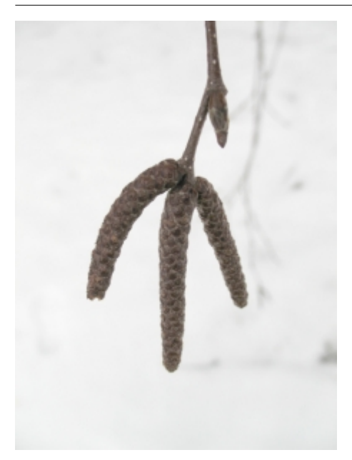
Betula papyrifera - Catkins