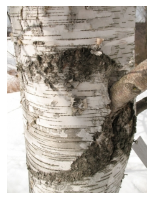
Betula papyrifera - Bark