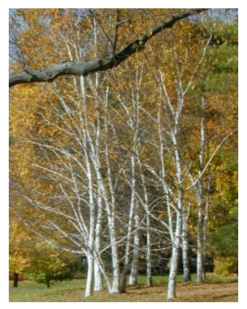
Betula papyrifera - Habit, Fall Interest