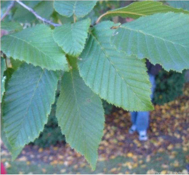
Carpinus caroliniana - Leaves