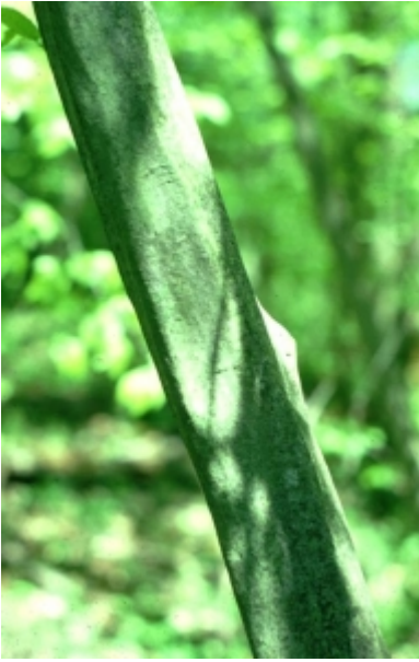
Carpinus caroliniana - Bark