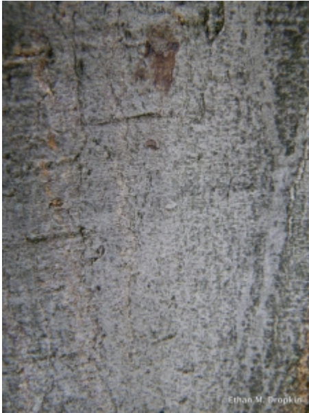
Carpinus caroliniana - Bark