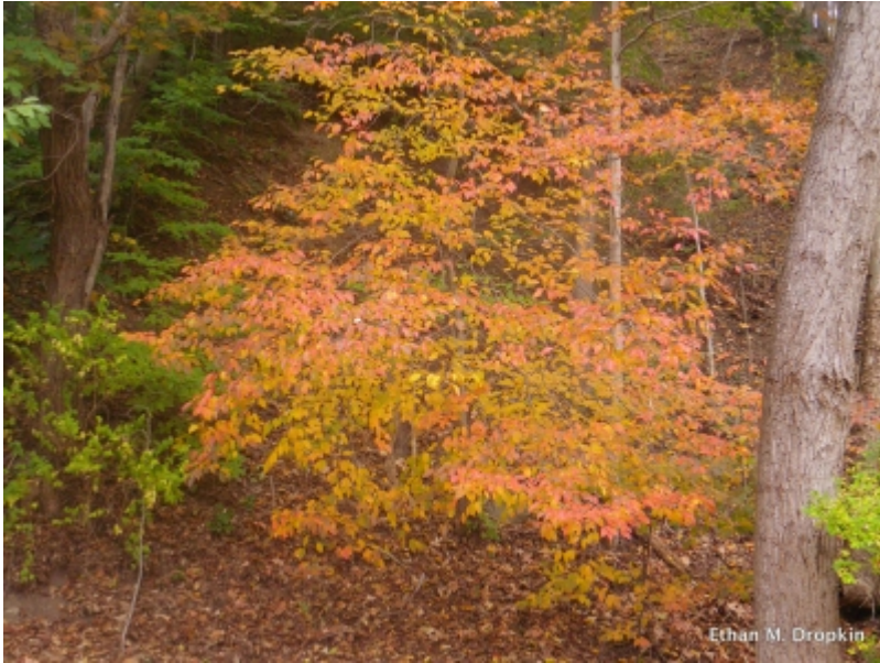
Carpinus caroliniana - Habit, Fall Interest