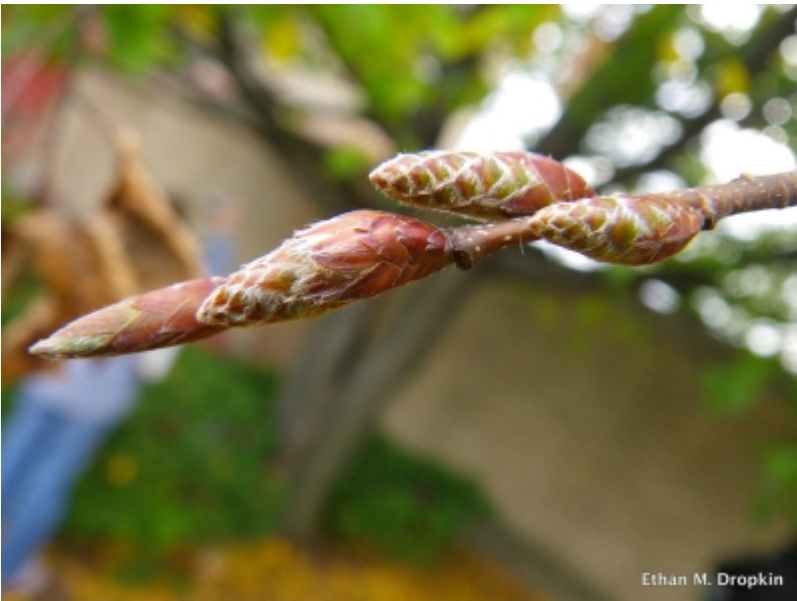
Carpinus caroliniana - Buds