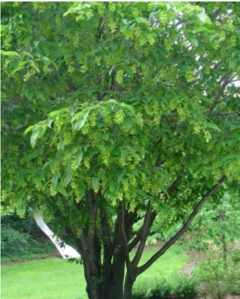
Carpinus caroliniana - Habit