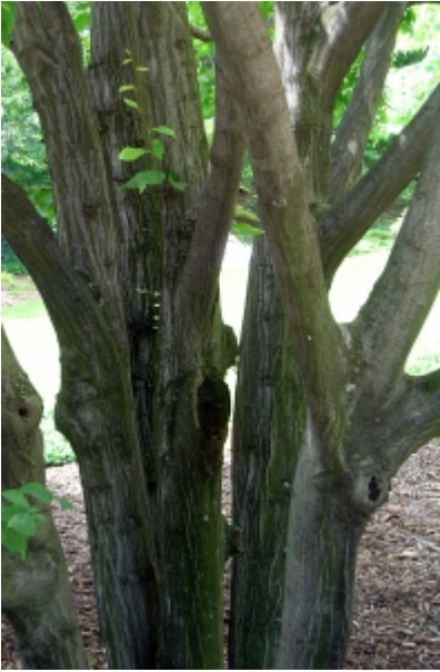
Carpinus caroliniana - Bark