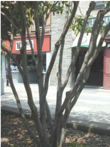
Carpinus caroliniana - Bark