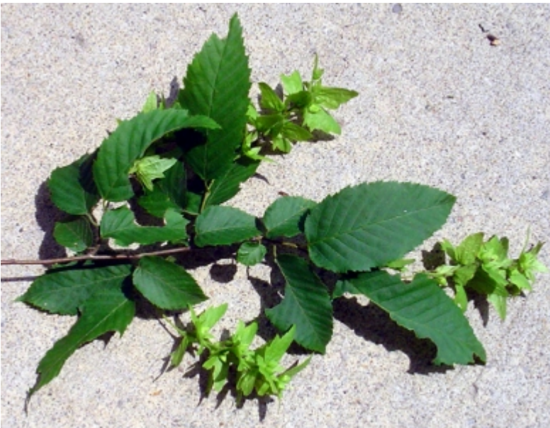
Carpinus caroliniana - Leaves, Fruit