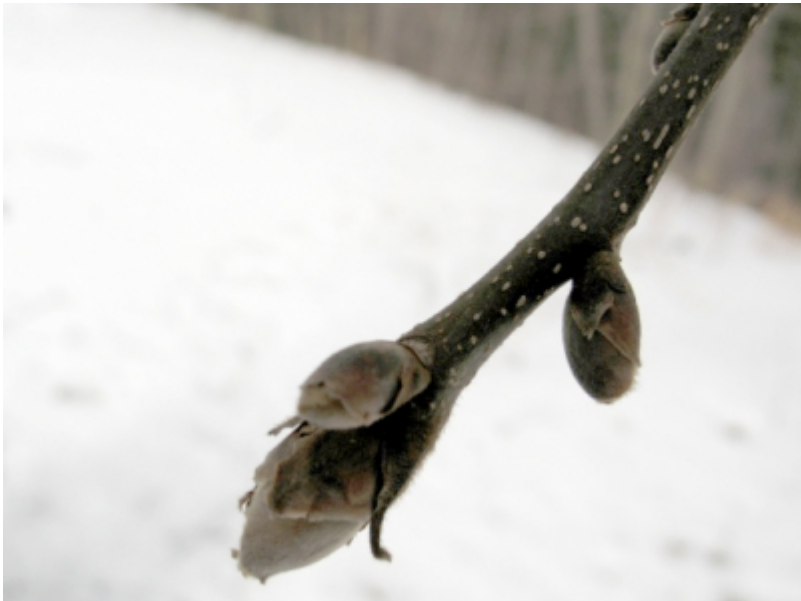
Carya ovata - Buds