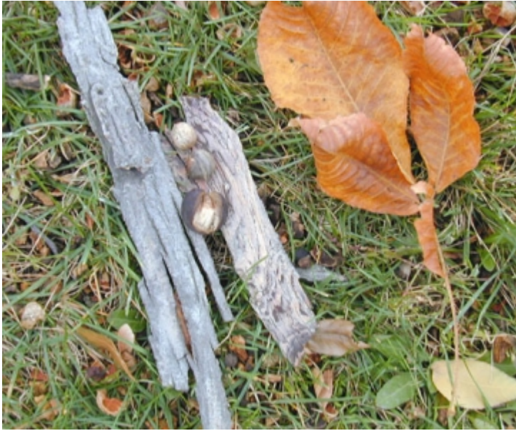
Carya ovata - Bark, Fruit, Leaves, Fall Interest