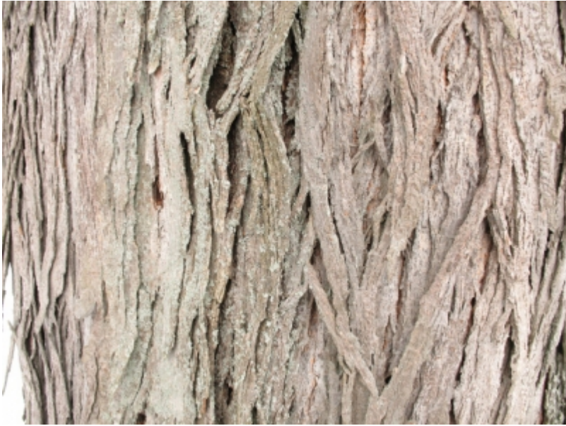
Carya ovata - Bark