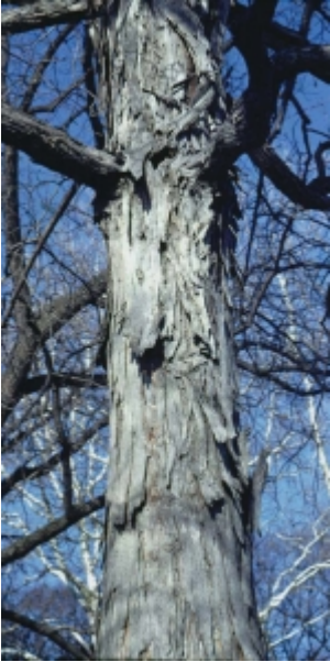
Carya ovata - Bark