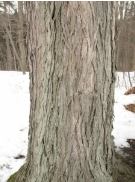
Carya ovata - Bark