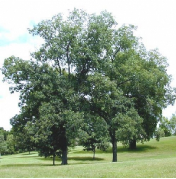
Carya ovata - Habit