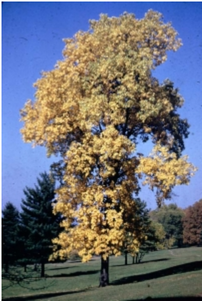
Carya ovata - Habit, Fall Interest