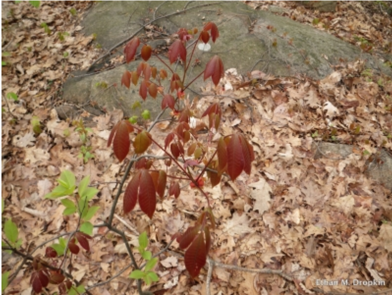
Carya ovata - Leaves