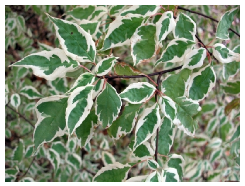
Cornus alternifolia var. - Leaves