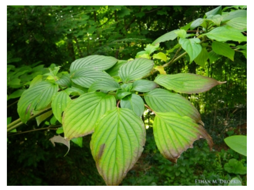
Cornus alternifolia - Leaves