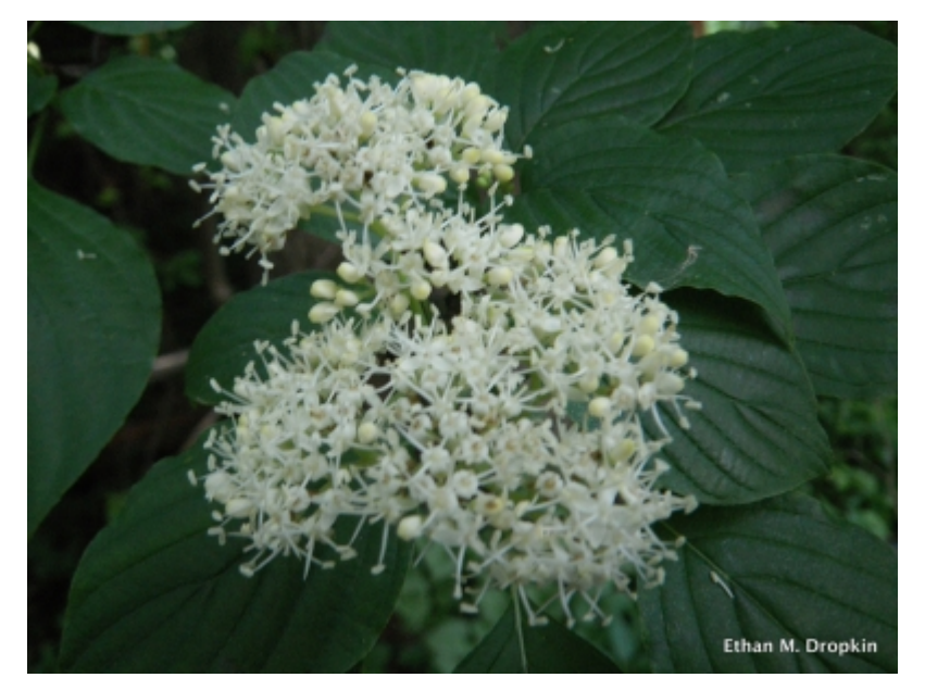
Cornus alternifolia - Flowers