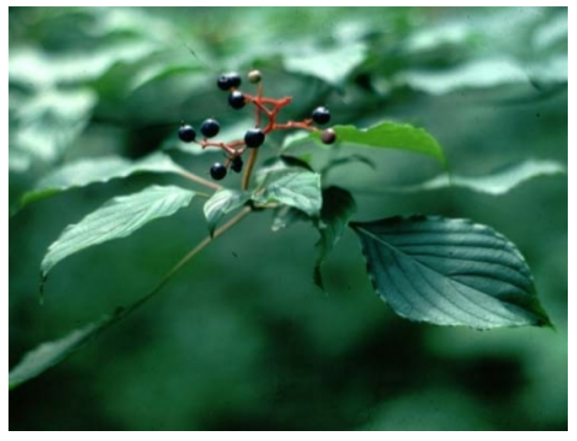
Cornus alternifolia - Leaves, Fruit