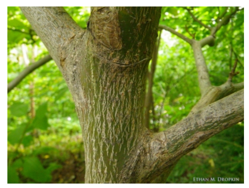
Cornus alternifolia - Bark