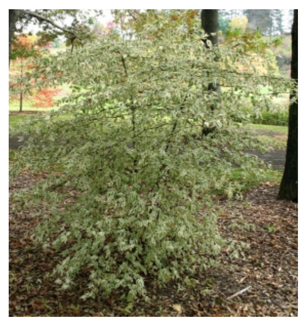
Cornus alternifolia var. - Habit