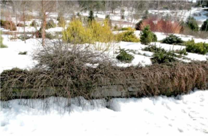
Cotoneaster apiculatus - Habit