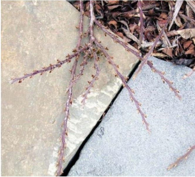
Cotoneaster apiculatus - Buds