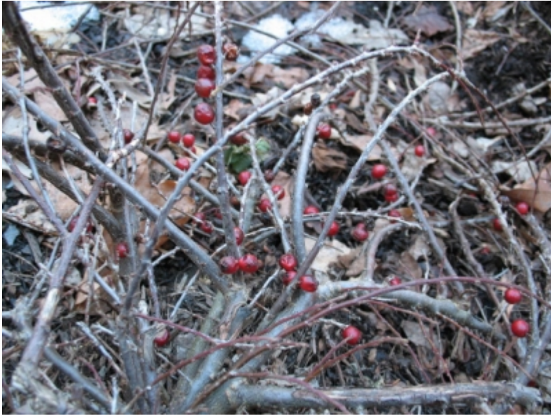
Cotoneaster apiculatus - Bark, Fruit