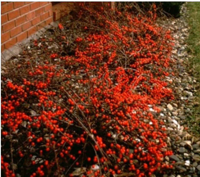
Cotoneaster apiculatus - Habit, Fruit