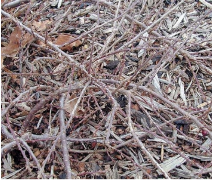
Cotoneaster apiculatus - Habit, Bark