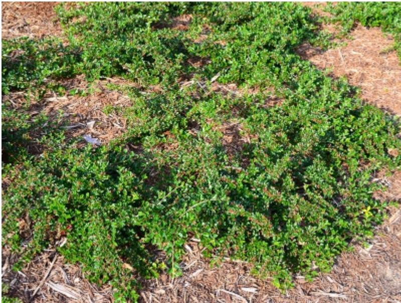
Cotoneaster apiculatus - Habit