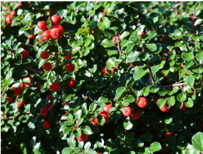
Cotoneaster apiculatus - Leaves, Fruit