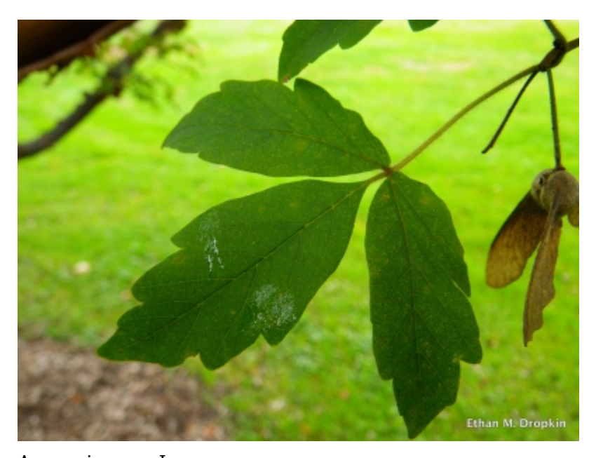
Acer griseum - Leaves