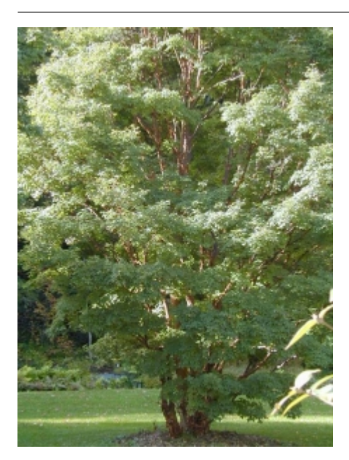
Acer griseum - Habit