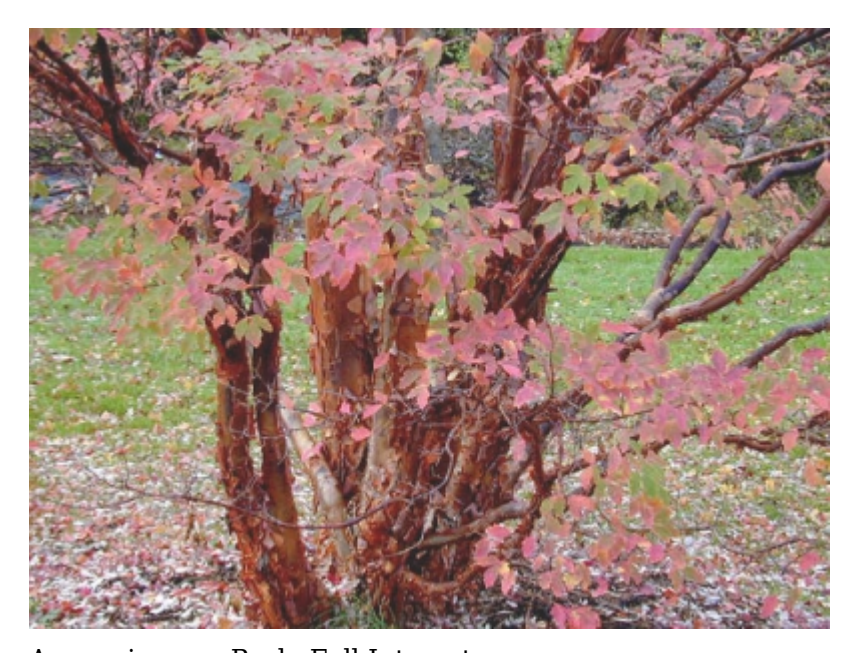
Acer griseum - Bark, Fall Interest