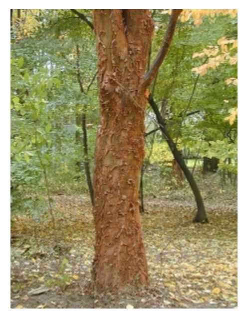
Acer griseum - Bark