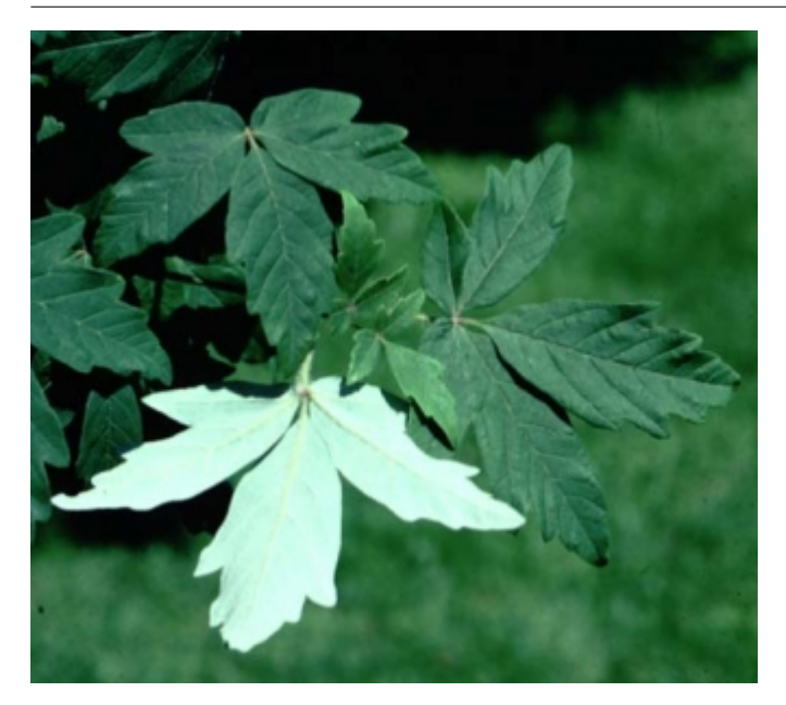
Acer griseum - Leaves