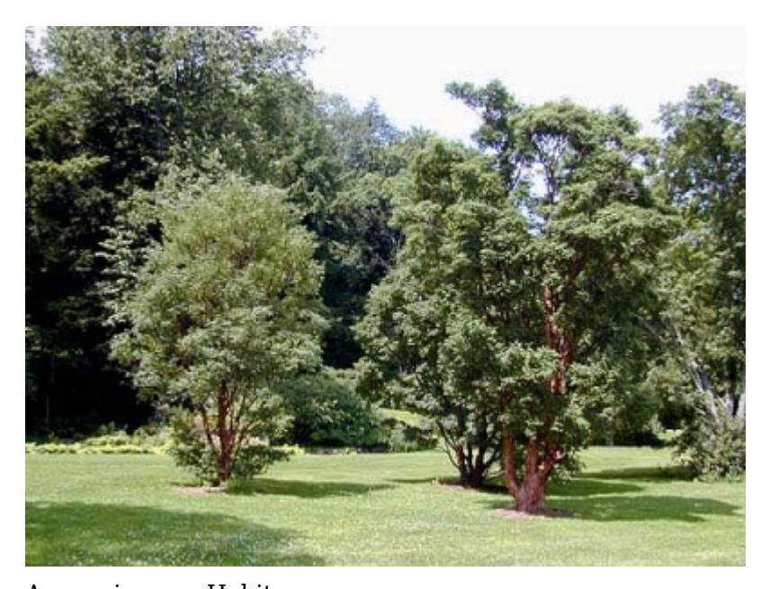
Acer griseum - Habit