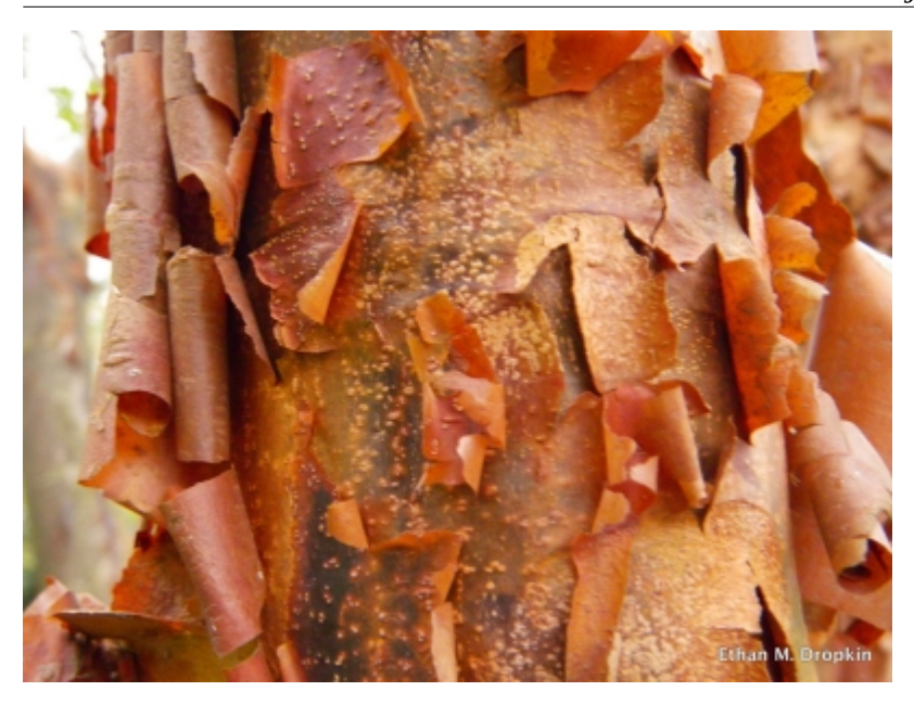
Acer griseum - Bark